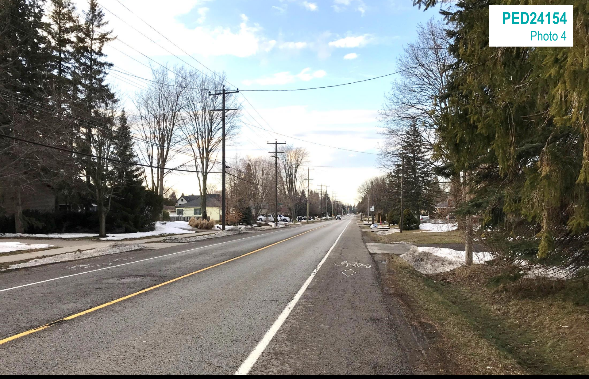
Fiddler's Green Road looking north