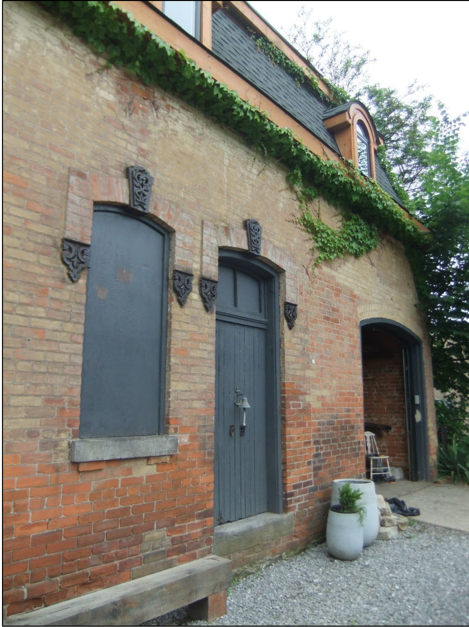
Image 2: Close-up of the eastern elevation, showing the openings and brick in greater detail.