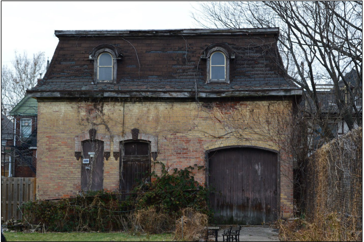
Image 13: Image of the eastern elevation.