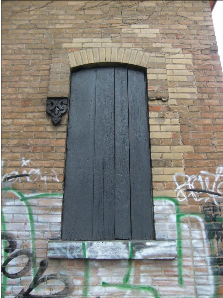
Image 7: Close-up of a window opening on the western elevation. Note the different colour bricks and missing cast-iron elements, indicating that the opening was repaired in the past.