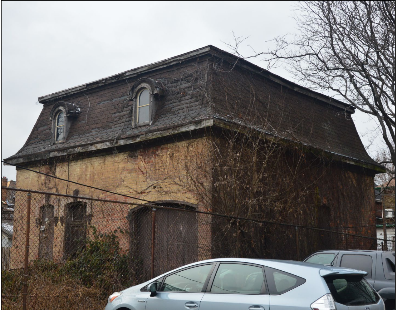
Image 12: Image of the eastern and northern elevations. Image by Graham Carrol and Ann Gillespie, 2019