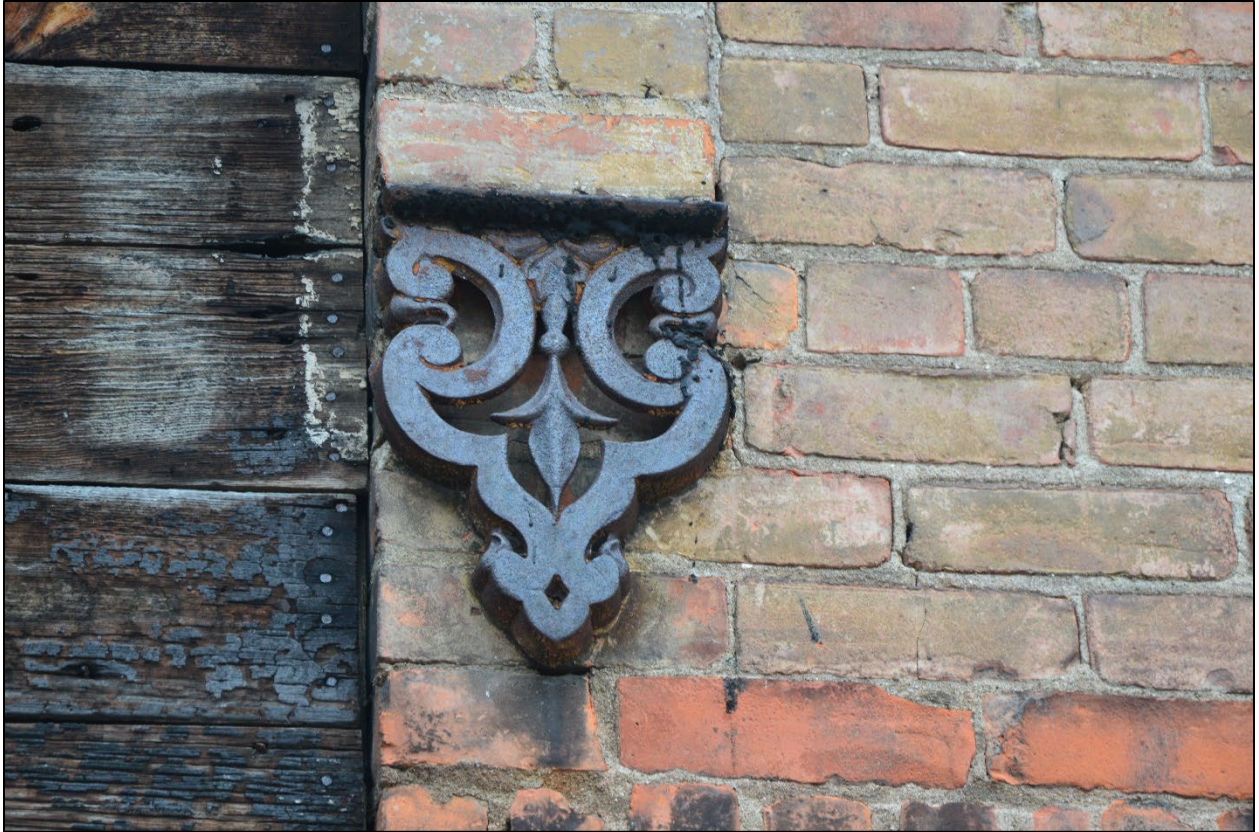
Image 9: Close-up of the cast-iron ornaments at the extremities of opening arch details.