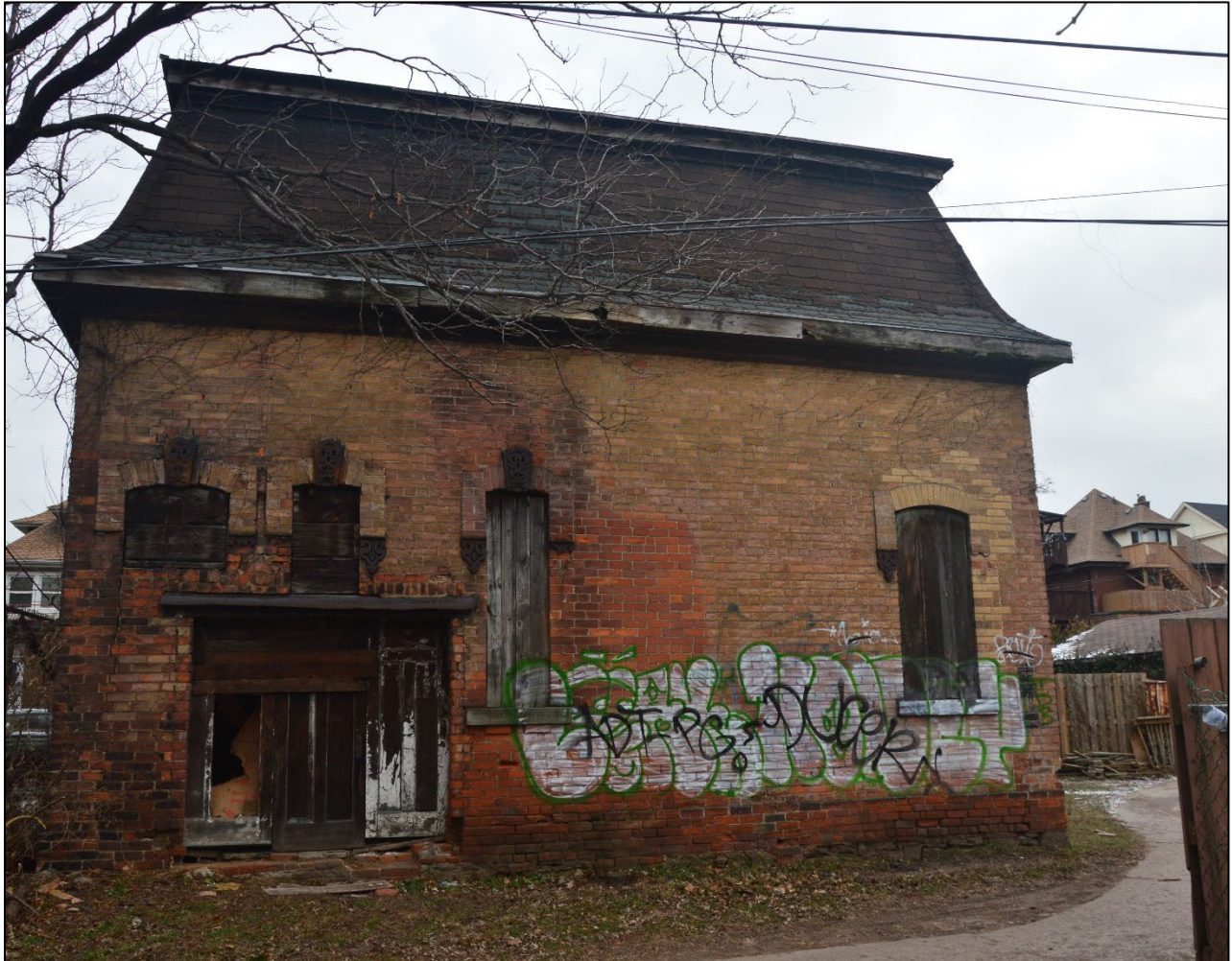
Image 11: Image of the western elevation. Image by Graham Carrol and Ann Gillespie, 2019.