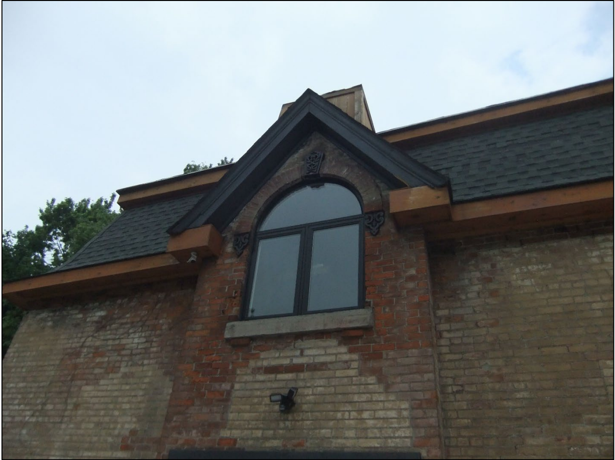
Image 5: Close-up of the southern elevation's central second-storey window opening with gable roof.