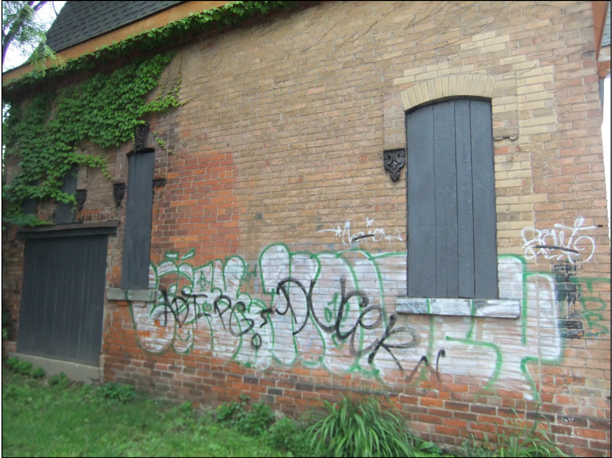
Image 6: Western elevation, take note of the truncated door and window openings on the left-hand side of the image.