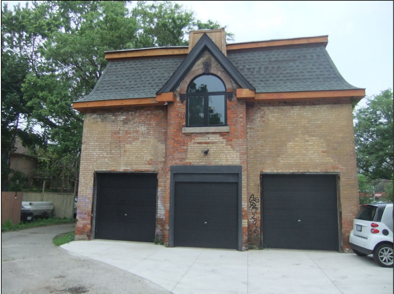
Image 4: Southern elevation looking north from the public alley. Note the varying brick colours.