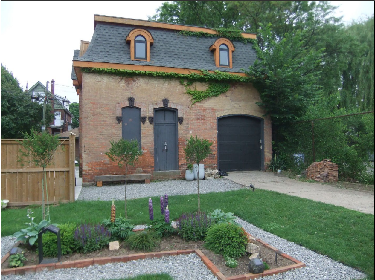
Image 1: Eastern elevation of the Eastcourt Carriage House looking west.