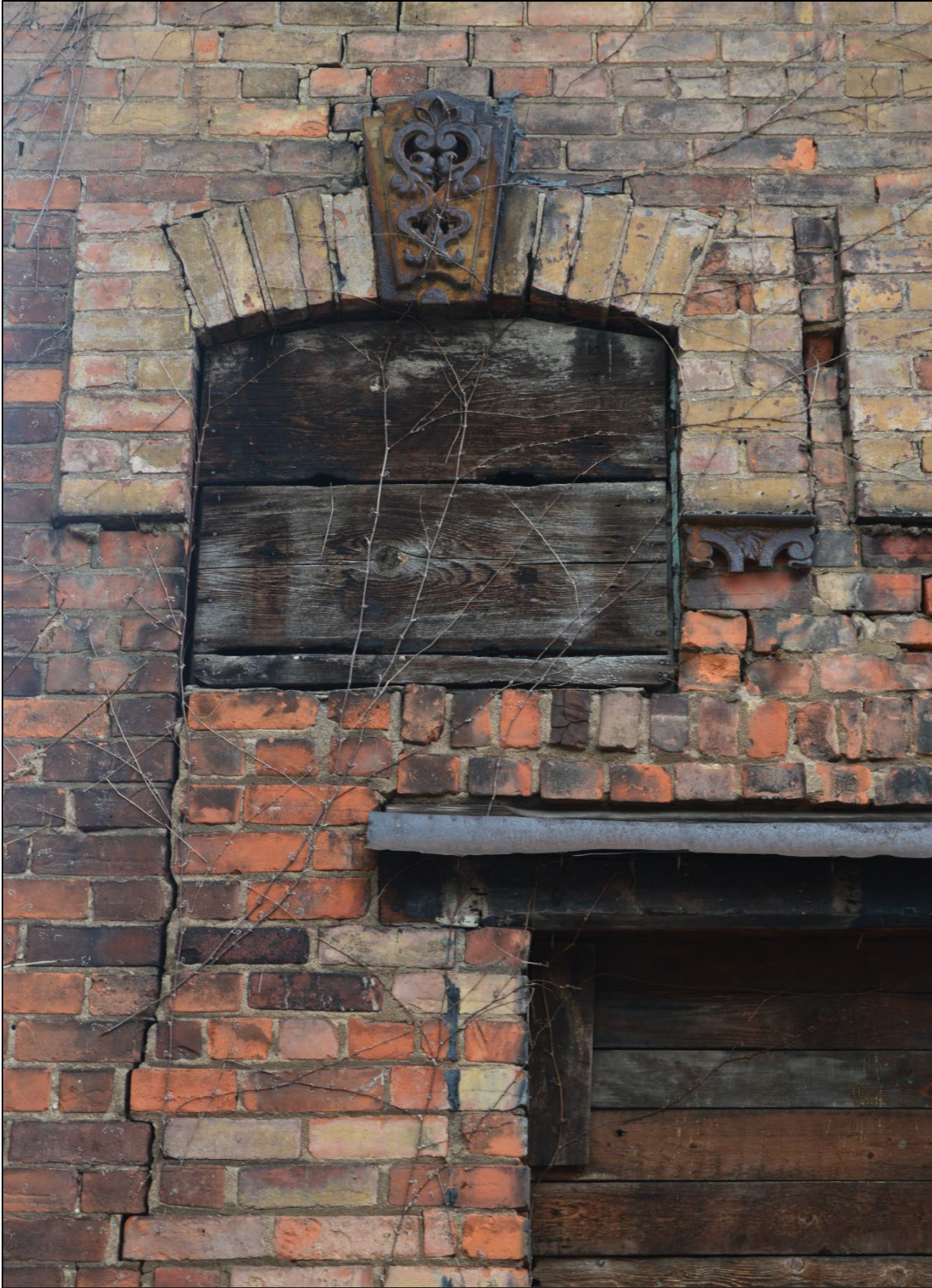
Image 10: Close-up of the truncated original openings on the western elevation.