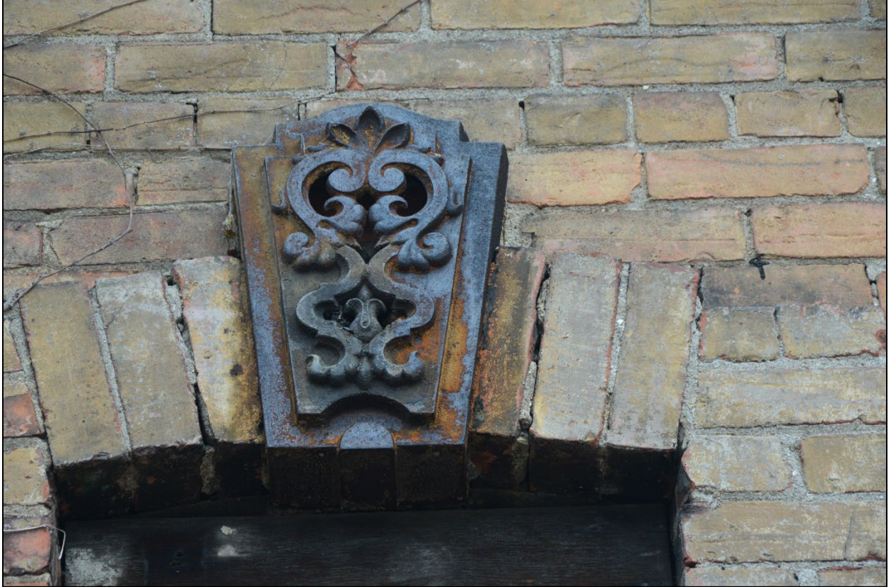
Image 8: Close-up of the cast-iron ornaments over keystones. Image by Graham Carrol and Ann Gillespie, 2019.