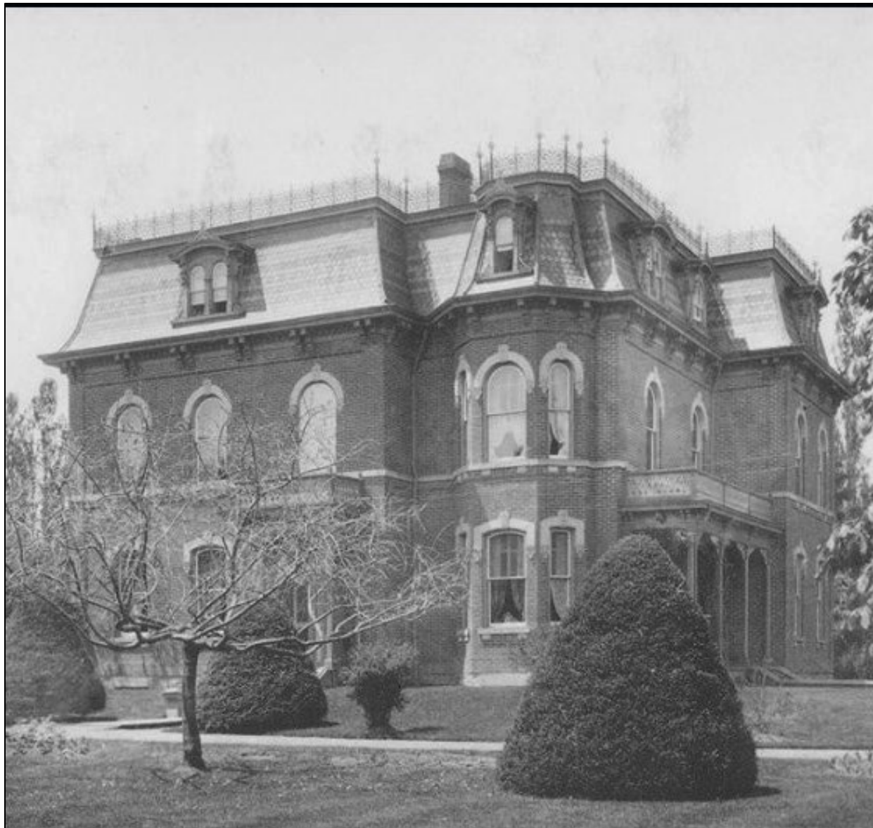
Image 15: Historic image of the original Eastcourt Estate residence. Note the cast iron ornaments around the first storey window openings which match those of the surviving Carriage House.

Image by C.S. Cochran; published by William H. Carre, Art Work on Hamilton, Canada, 1899.