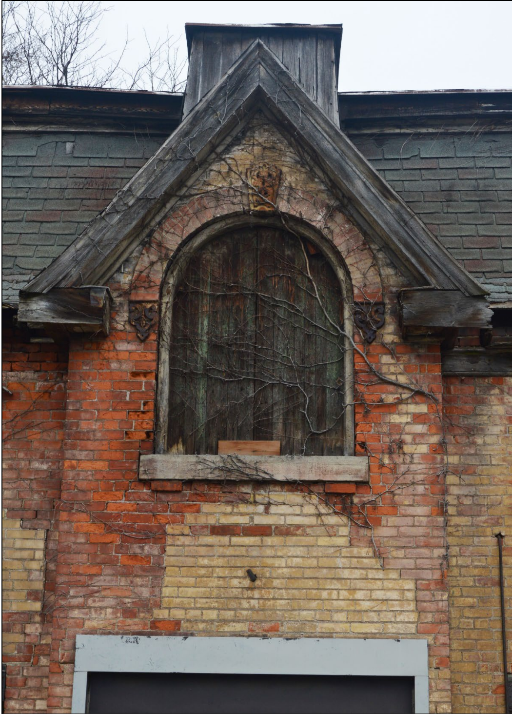
Image 14: Image of the second storey window opening on the southern elevation. Note the rust on the cast iron ornaments.