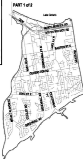
Key Map - Ward 5