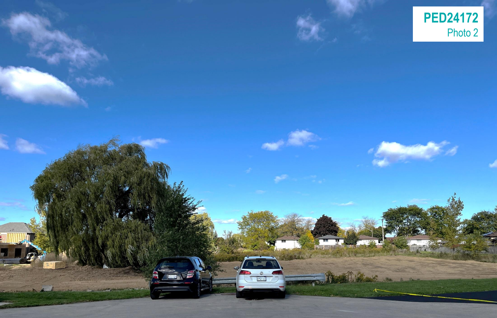
Looking north from Mentino Crescent