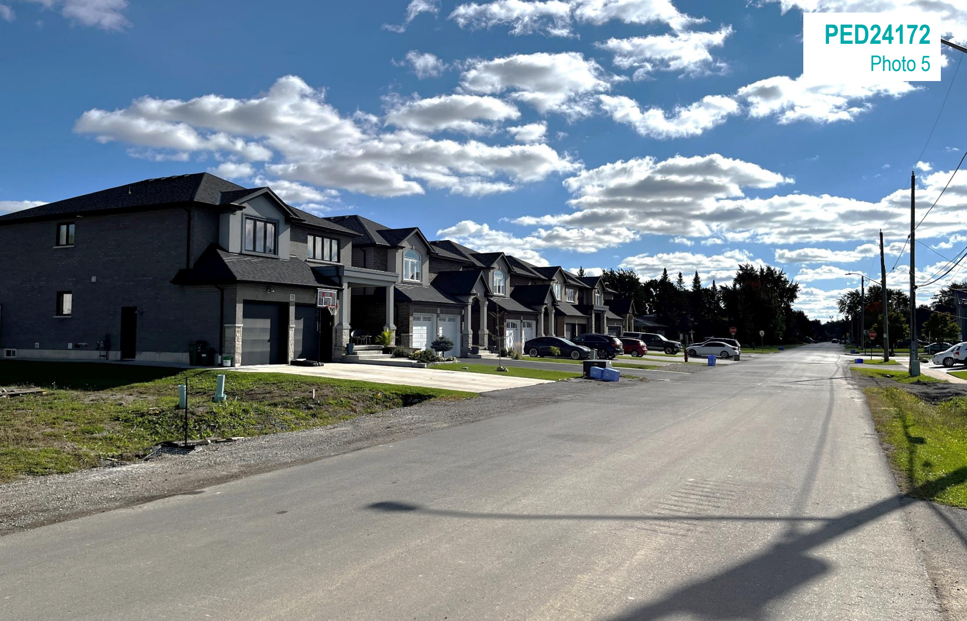
Looking south on Eleanor Avenue