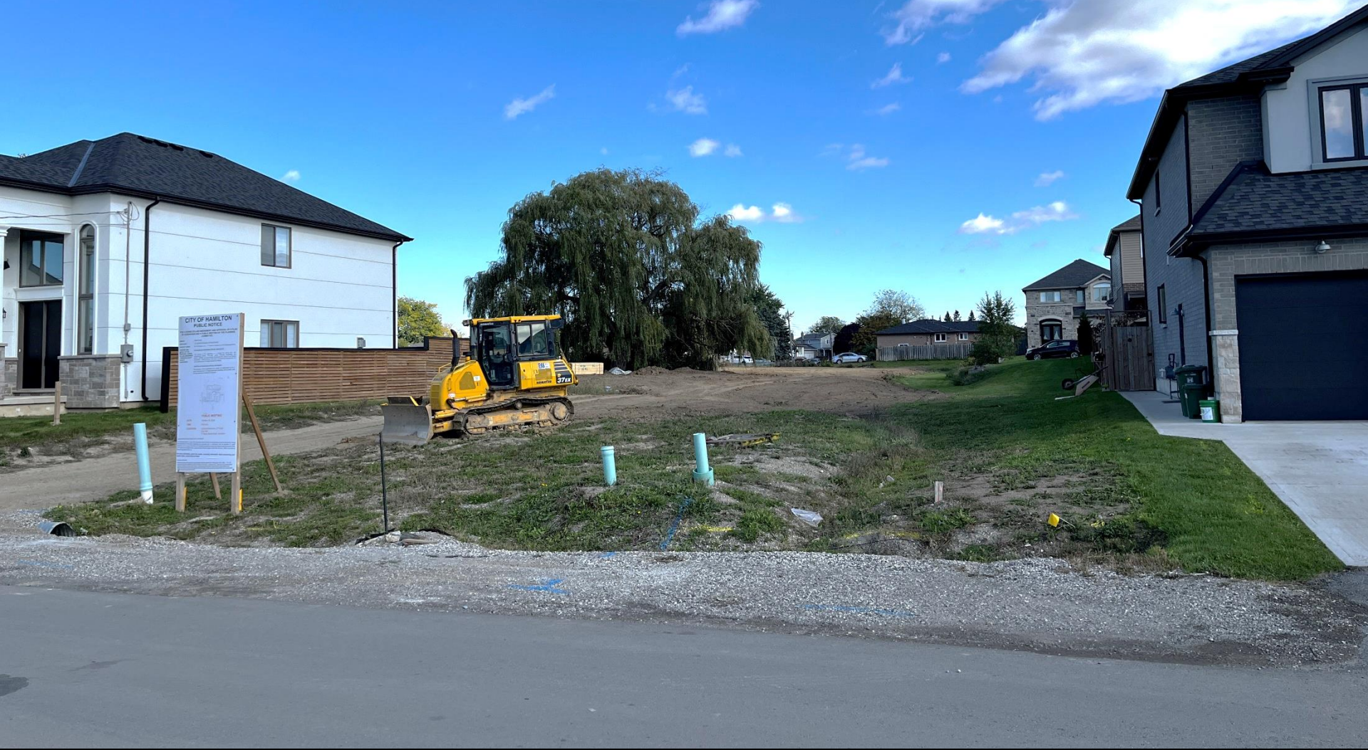
Looking east from Eleanor Avenue