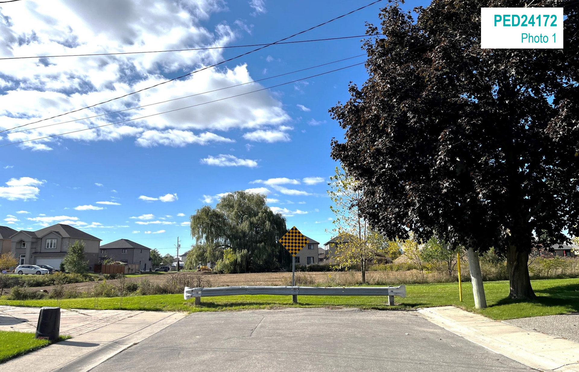
Looking west from Mentino Crescent