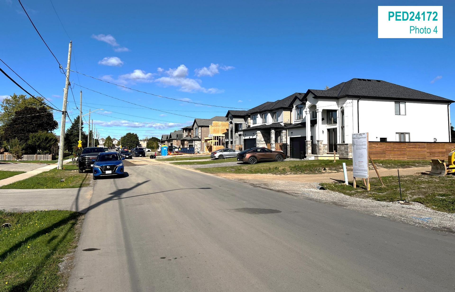
Looking north on Eleanor Avenue