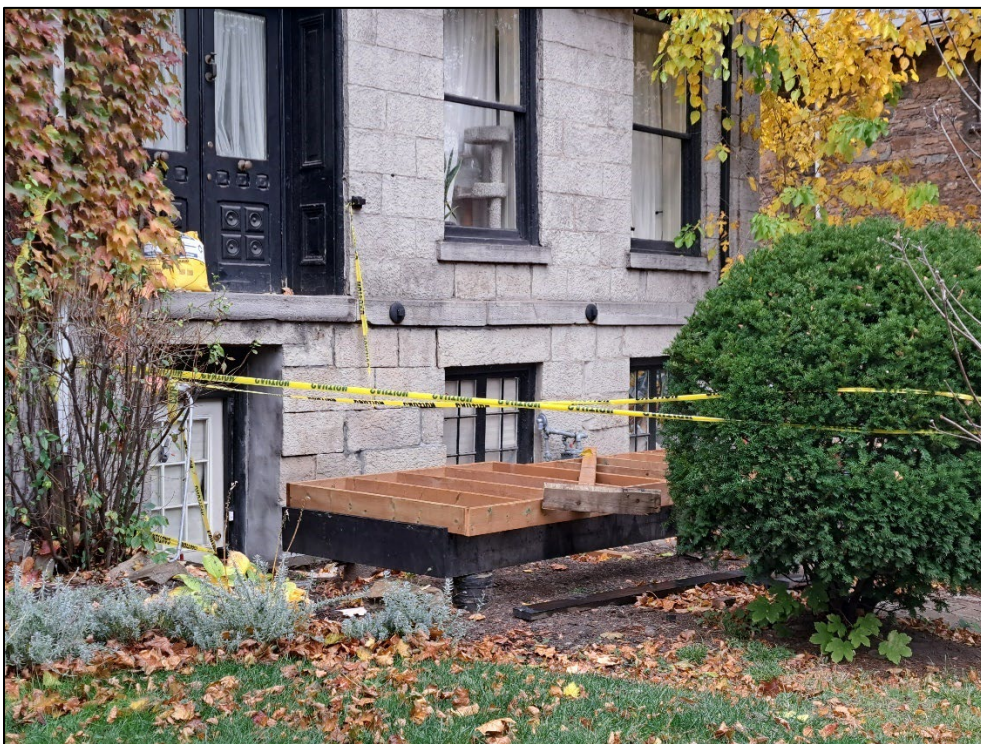
Figure 4: Base of new platform for the front steps (City of Hamilton, November 4, 2024)