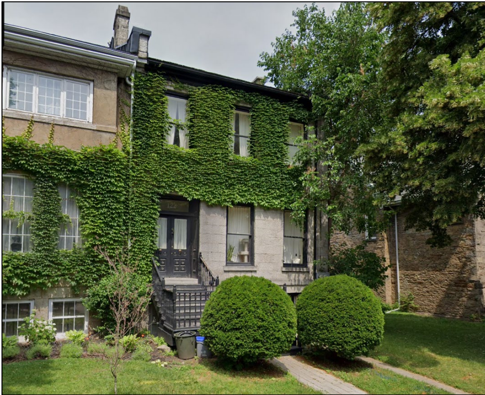
Figure 3: Front of 122 MacNab Street South (Google, June 2024)