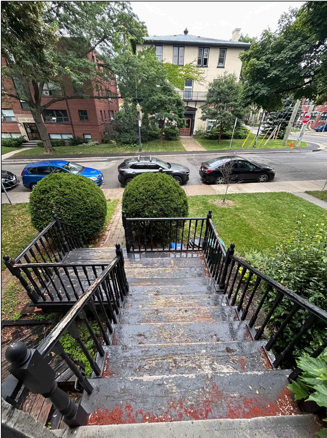
Figure 2: Photograph of previous front steps and their deterioration, looking down from the front door