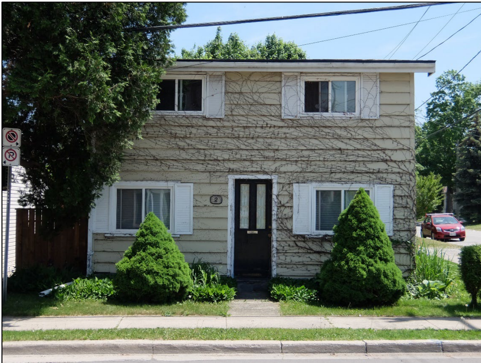
Figure 6: Front (north) elevation fronting onto Griffin Street (City of Hamilton, 2018)