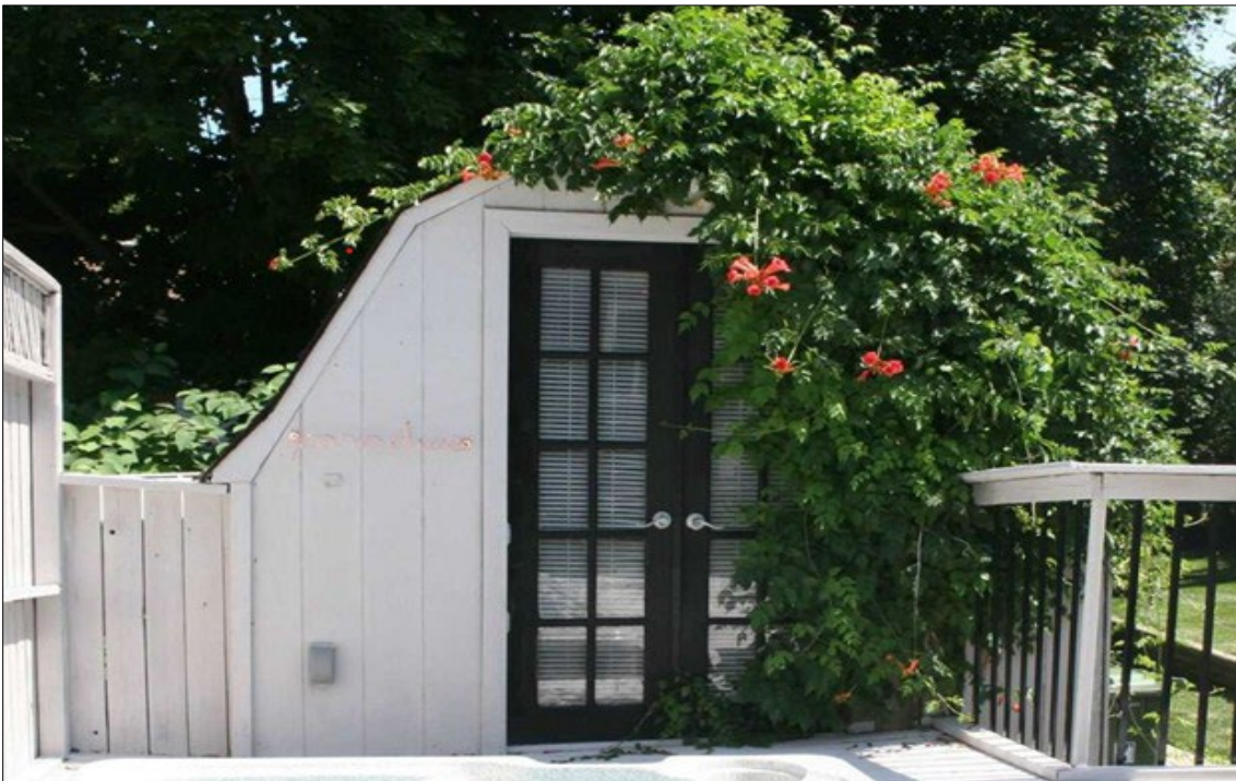
Figure 4: North elevation of the rear contemporary shed to be demolished (Submitted by Applicant)