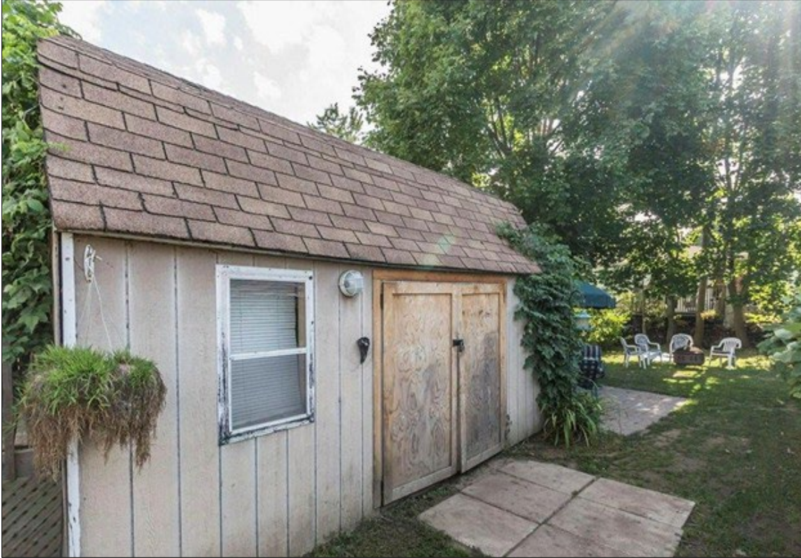
Figure 3: West elevation of the rear contemporary shed to be demolished (Submitted by the Applicant)