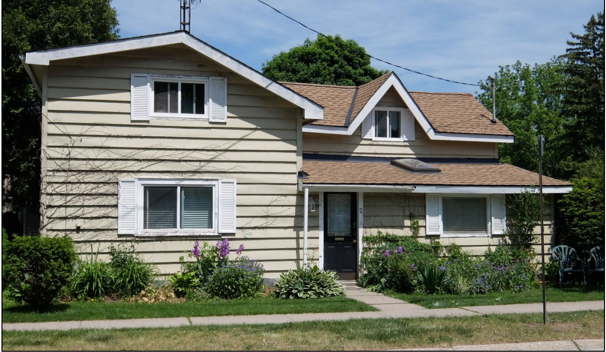
Figure 7: Side (west) elevation fronting onto Main Street South (City of Hamilton, 2018)