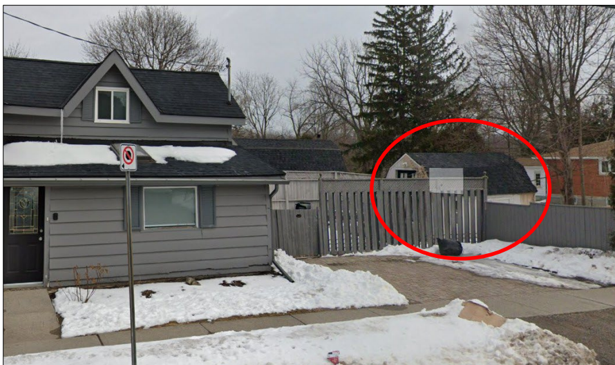
Figure 2: View of side elevation, backyard and rear shed (circled in red) from Main Street South (Google Maps, March 2022)