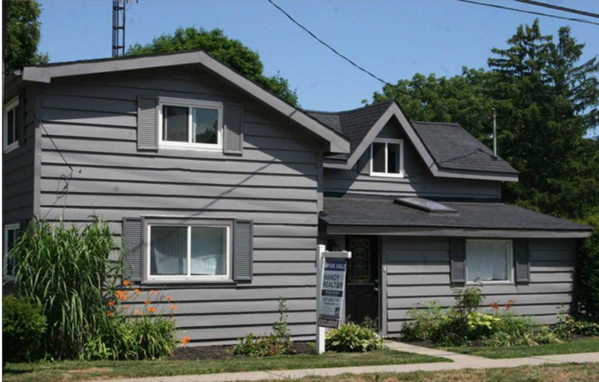
Figure 5: Side (west) elevation of 2 Griffin Street, fronting onto Main Street South