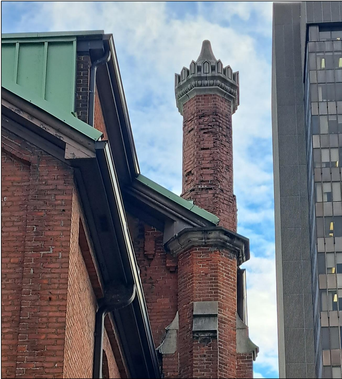
Figure 5: Close-up of northwest turret requiring further investigation and repair, looking south