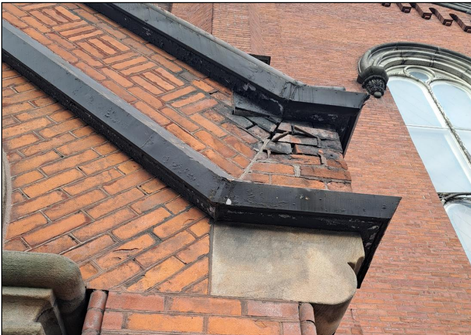
Figure 3: Area on the front portico requiring localized repointing and repairs