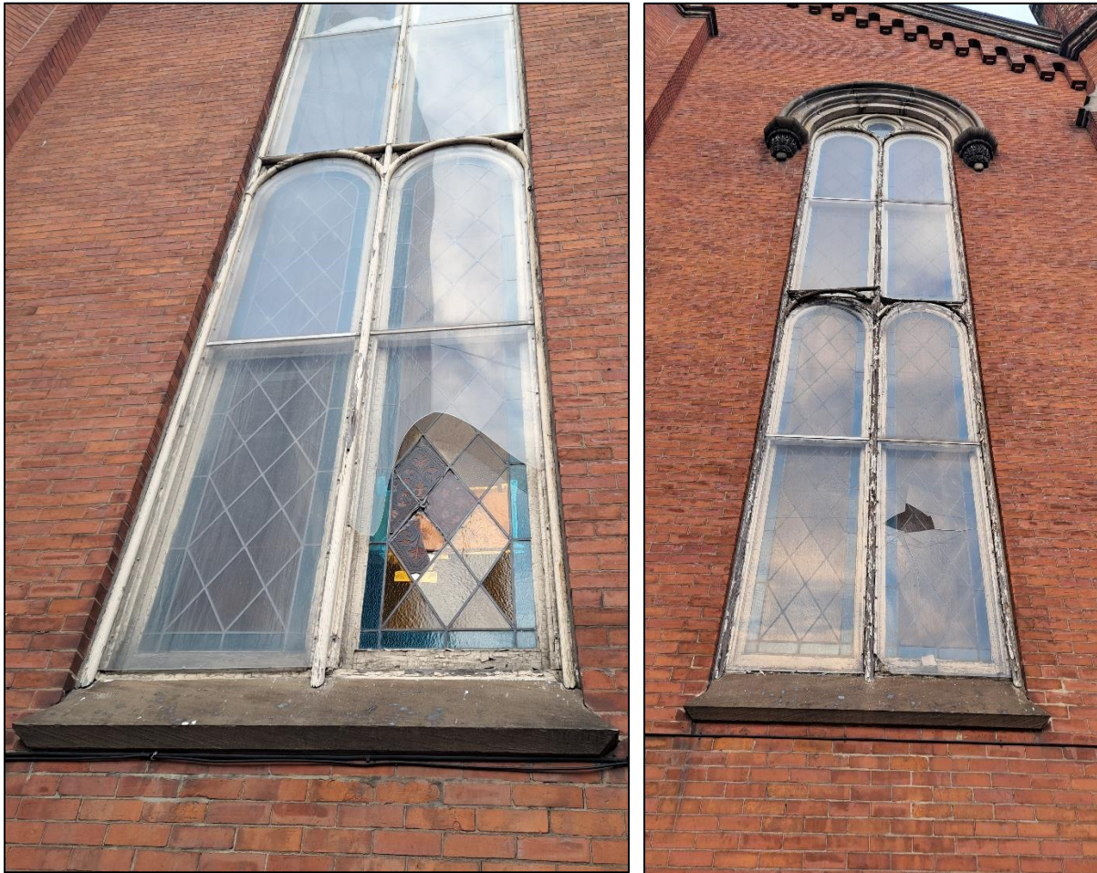
Figure 4: Damaged windows in the front (south) elevation, showing damaged protective storms to be temporarily covered by plywood hoarding and damaged wood to be removed (middle right)