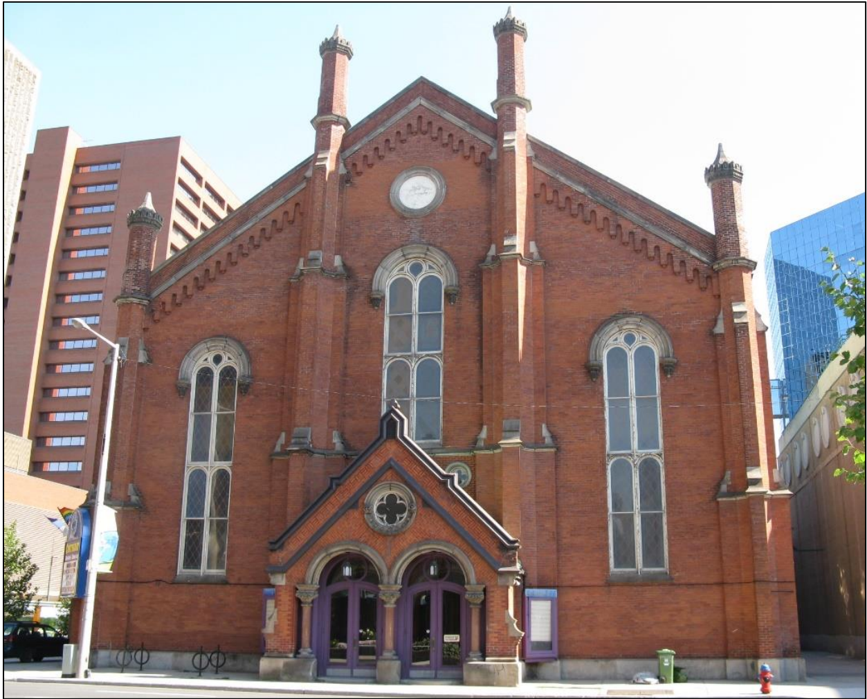
Figure 1: Front (south) elevation of the church