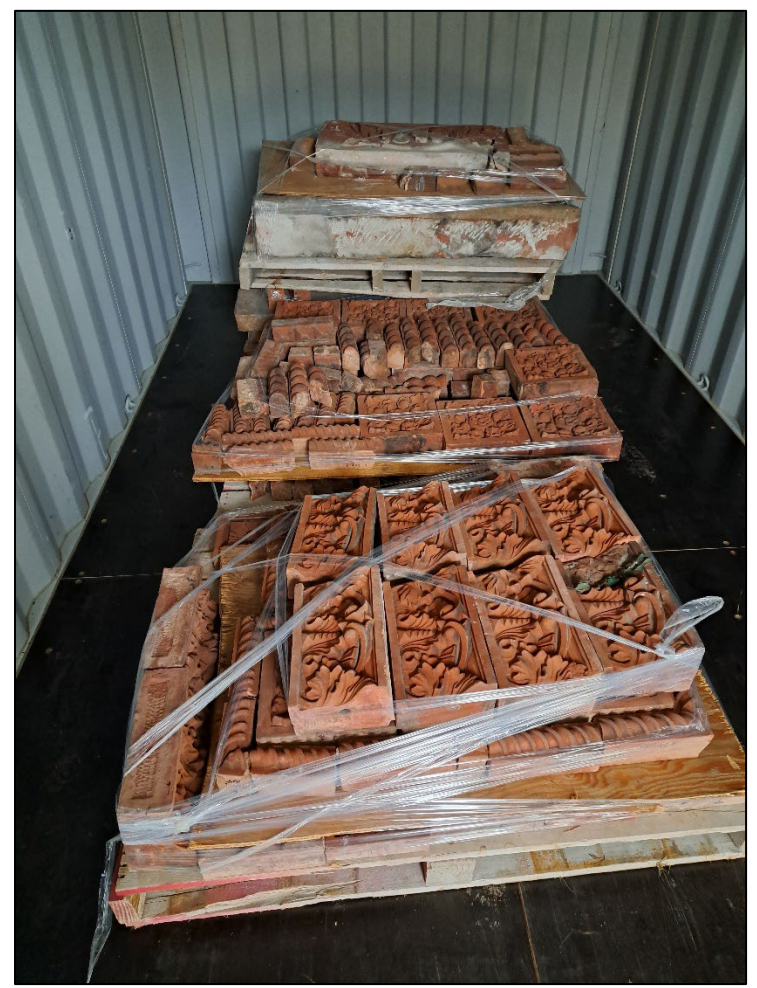
Figure 7: Salvaged heritage features, in storage (November 21, 2024)