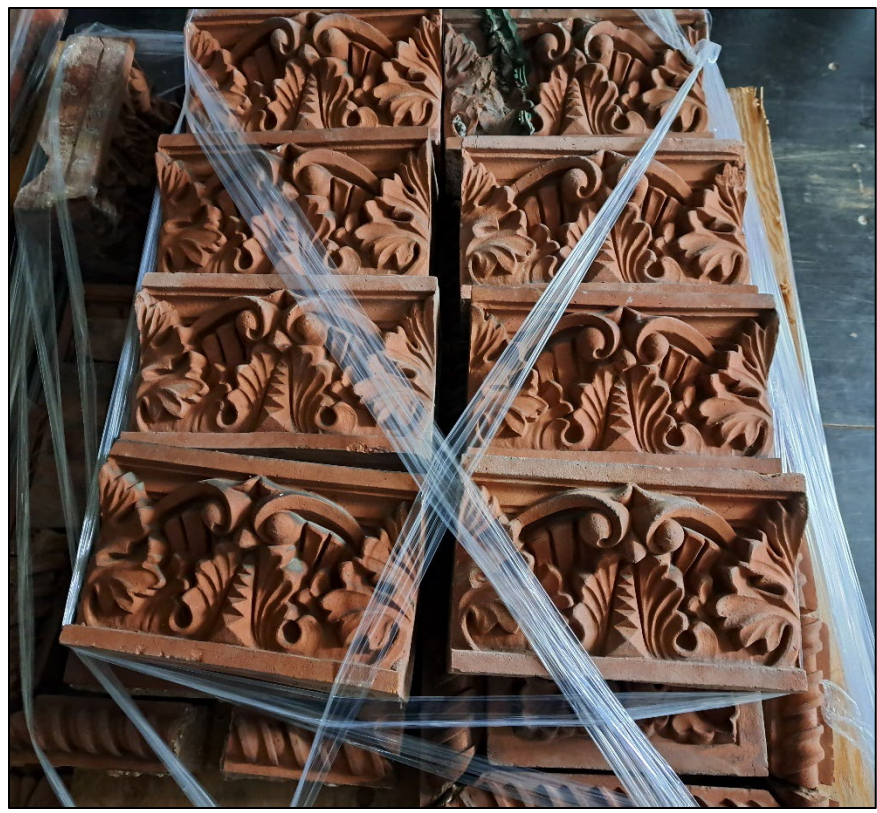
Figure 9: Salvaged terra cotta features in storage (November 21, 2024)