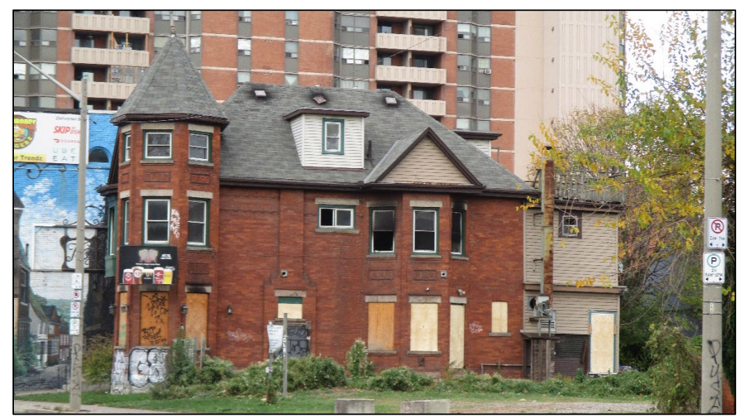
Figure 2: East elevation of property looking along King Street East. (November 6, 2024)