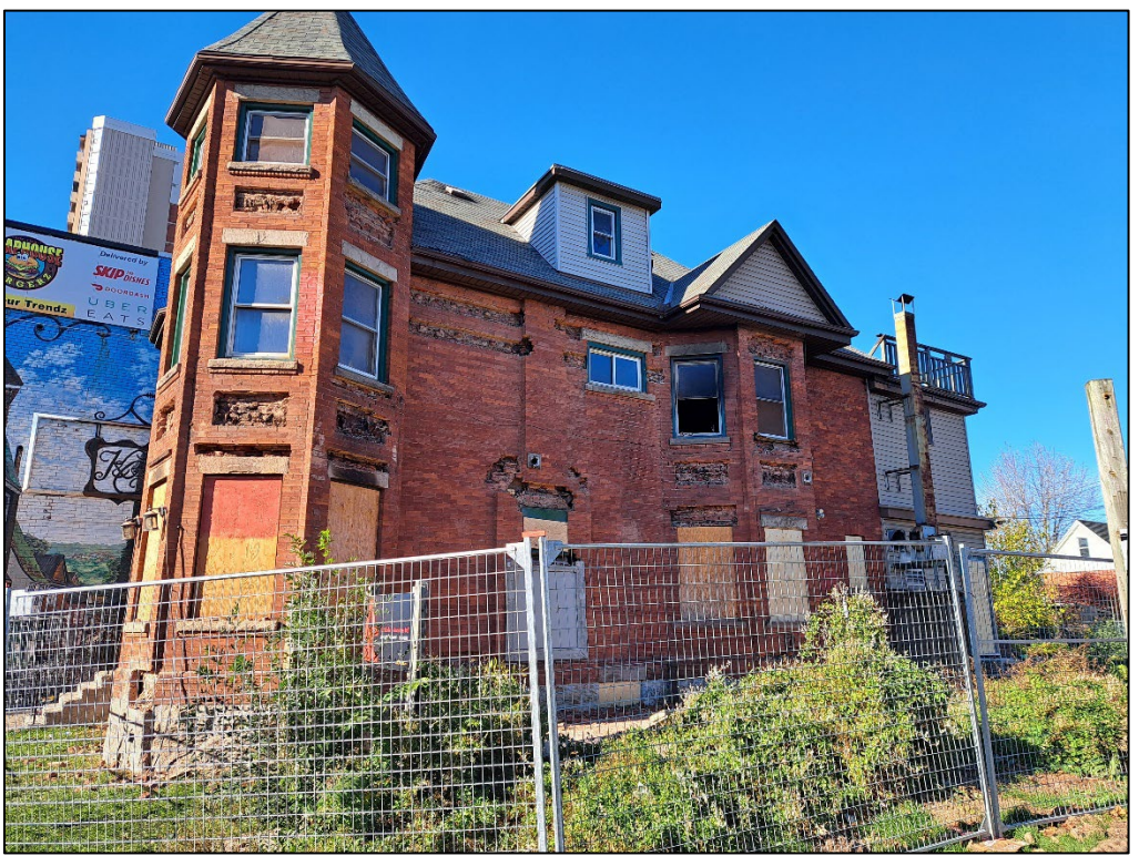
Figure 4: Subject property after removal of heritage features. (November 13, 2024)