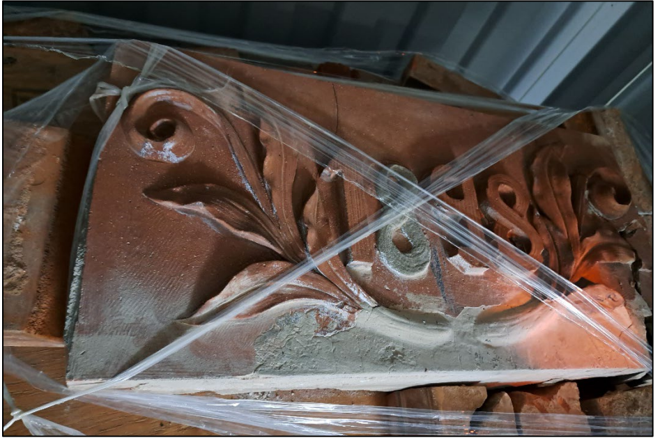
Figure 8: Salvaged date "stone" in storage (November 21, 2024)