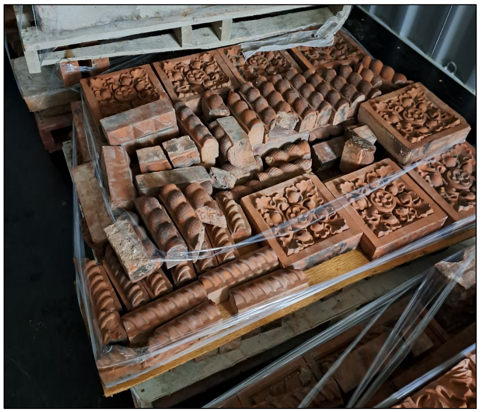
Figure 10: Salvaged terra cotta features in storage (November 21, 2024)