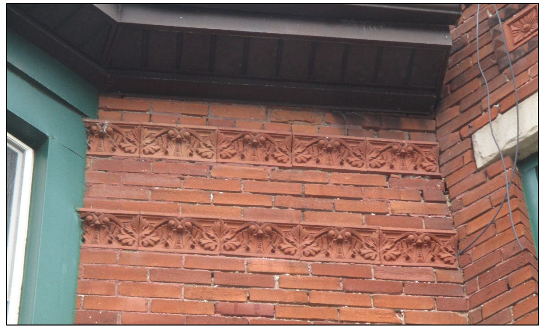
Figure 3: Detail view of terracotta courses on East elevation. (November 6, 2024)