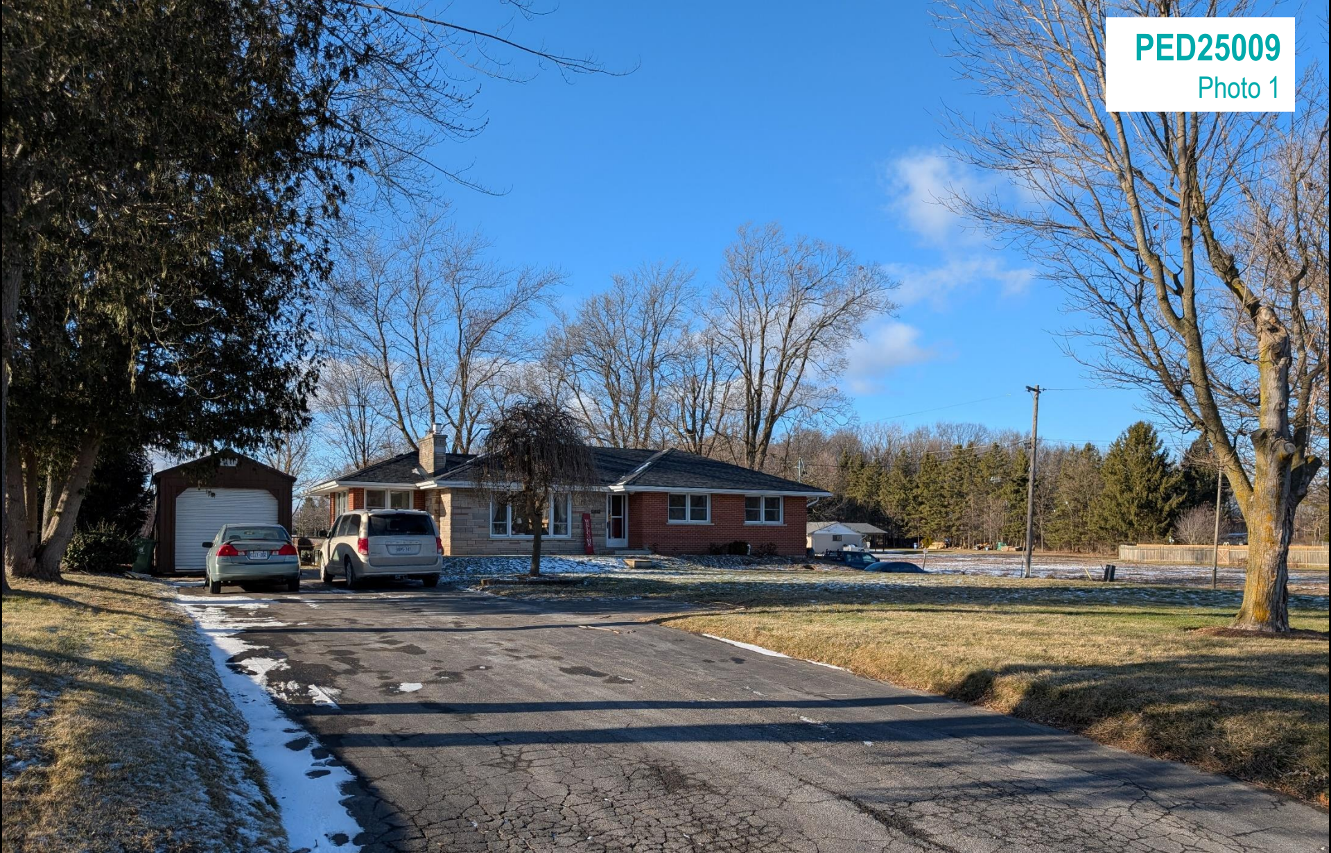
Facing the subject property on the western side of Regional Road 56, showing the eastern elevation of the dwelling