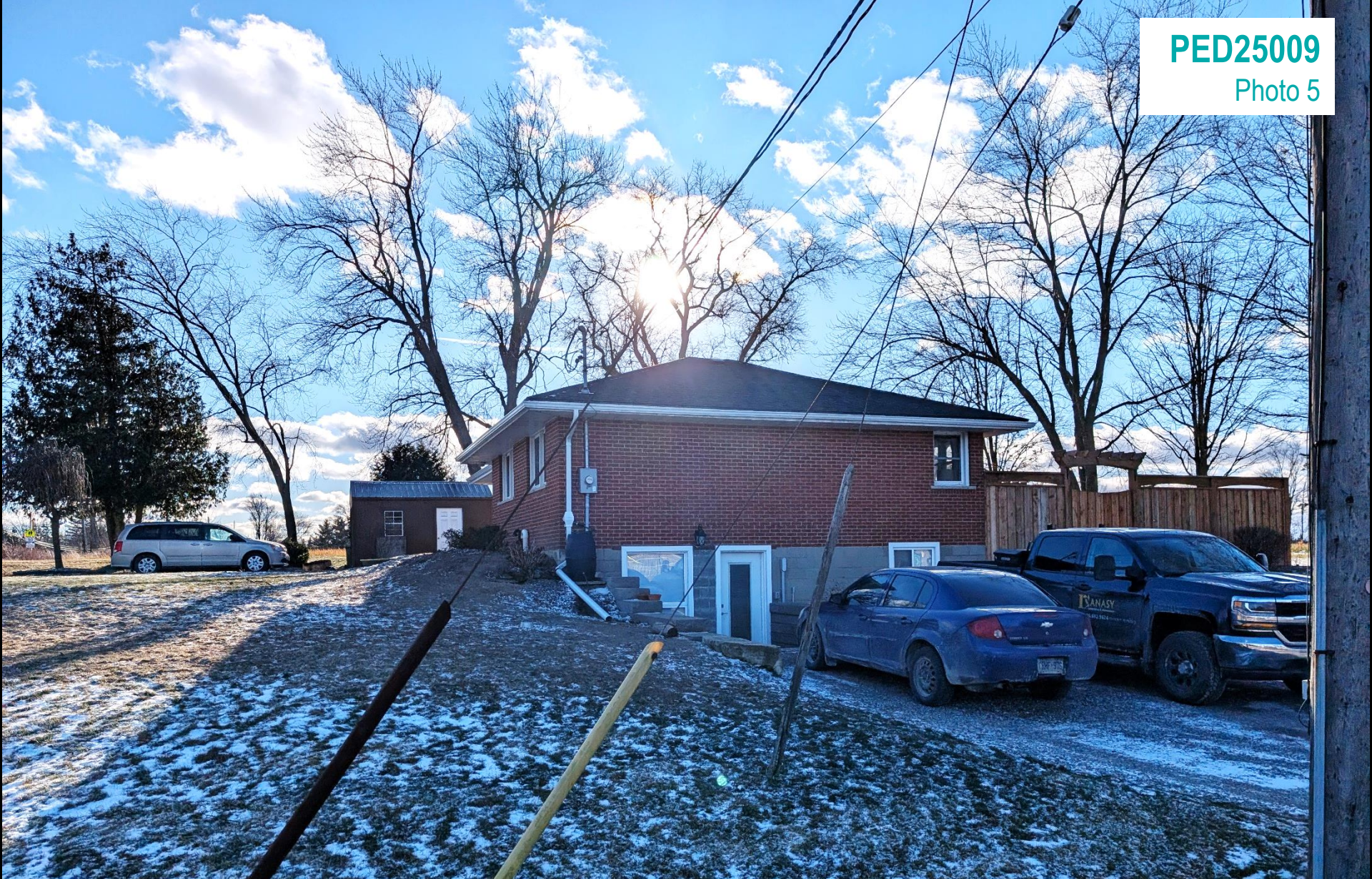
Facing the subject property from Guyatt Road (on the southern side of Guyatt), showing the northern elevation of the dwelling