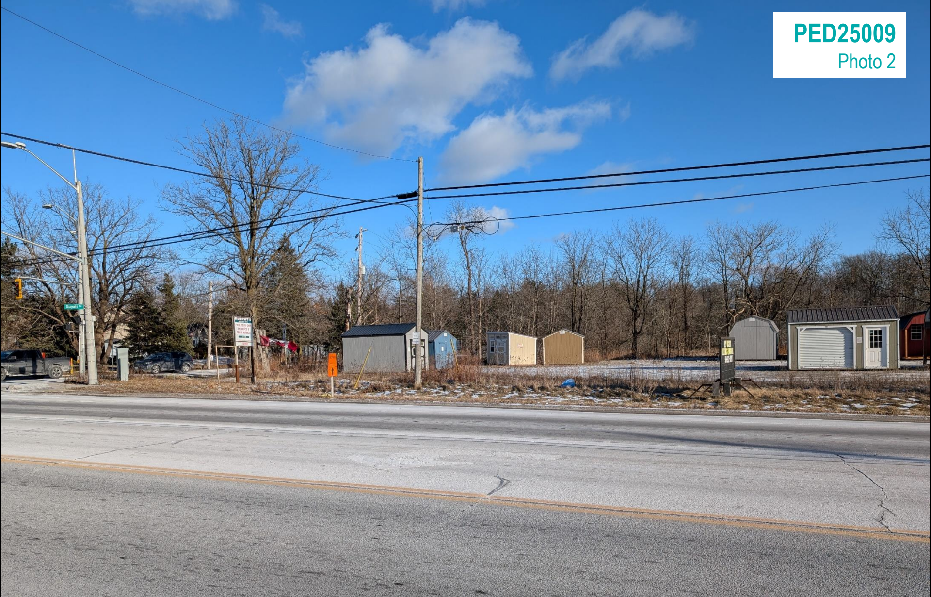
Directly across from the subject property, on the opposite (eastern) side of Regional Road 56