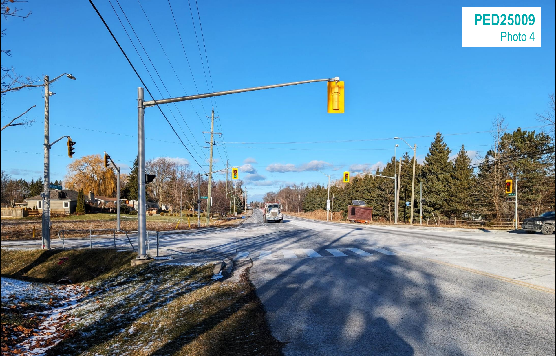
Facing north on Regional Road 56, the intersection of Regional Road 56 and Guyatt Rd is visible