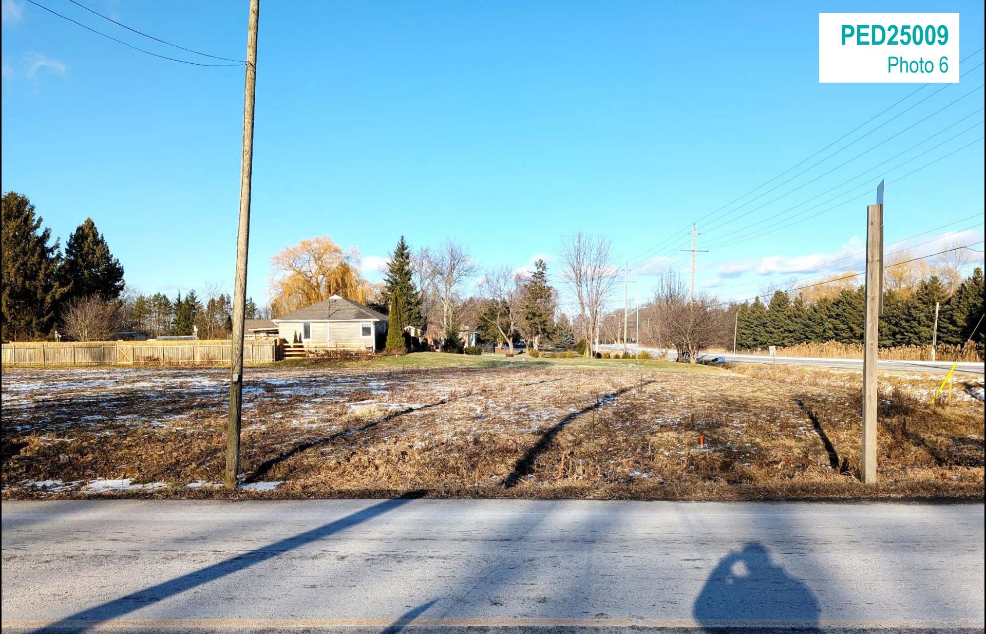
Directly across from the subject property, on the opposite (northern) side of Guyatt Rd