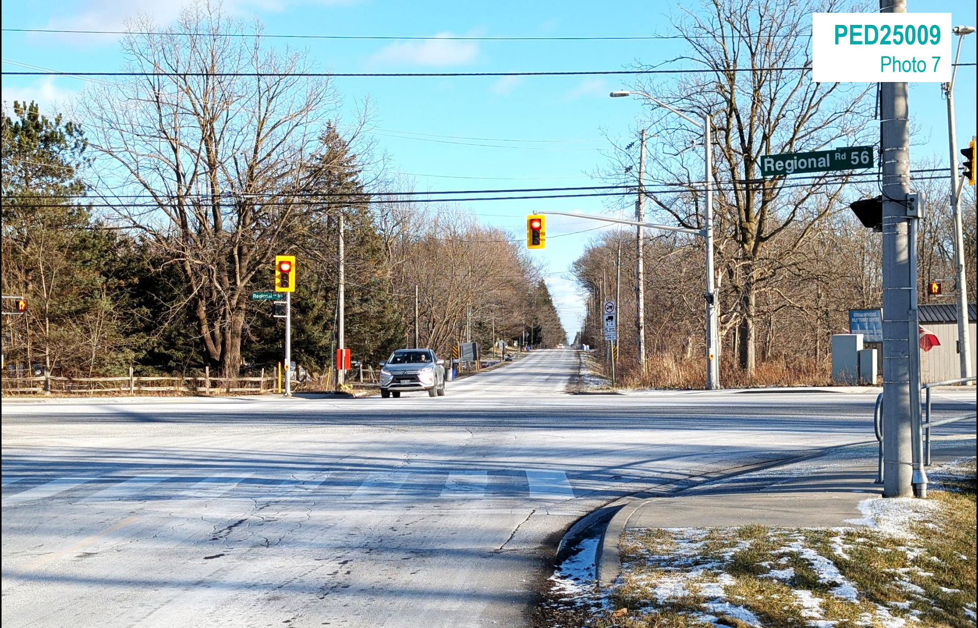
Facing east on Guyatt Rd, showing the intersection once again