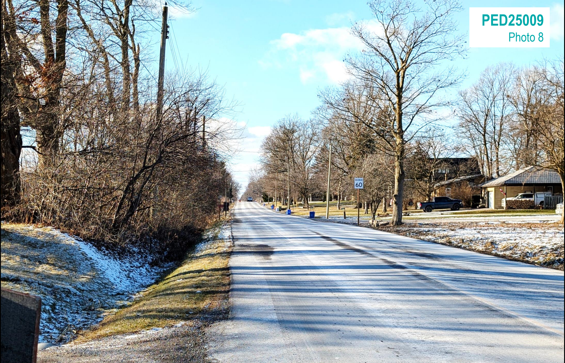
Facing west on Guyatt Rd