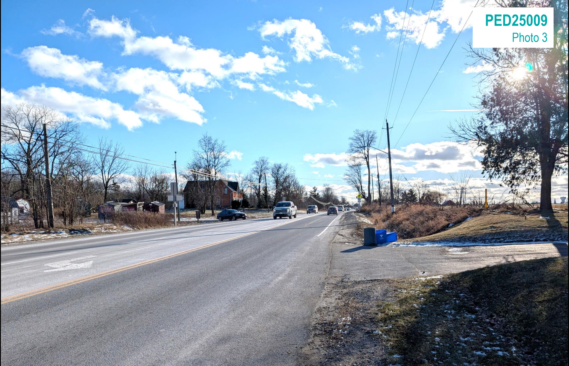
Facing south on Regional Road 56