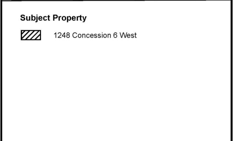
Key Map - Ward 13