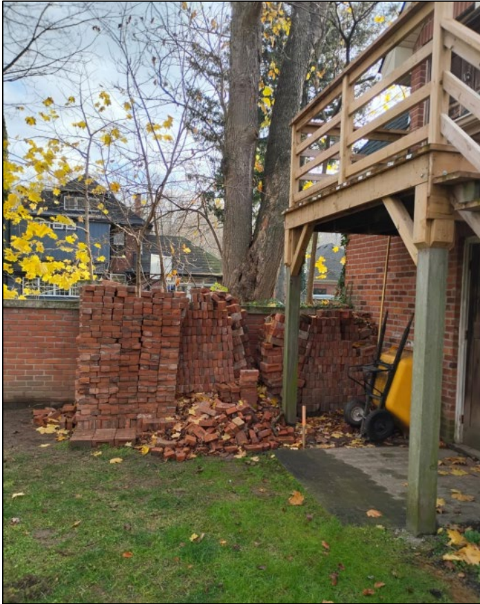
Figure 3: View of black maple tree from 9 Victoria Street (backyard)