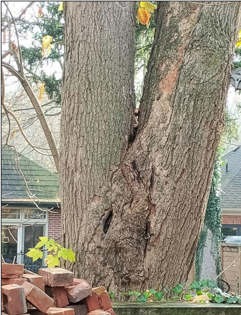
Figure 5: Close up of black maple tree