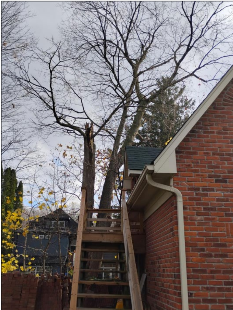
Figure 4: Another view of the black maple tree from 9 Victoria Street