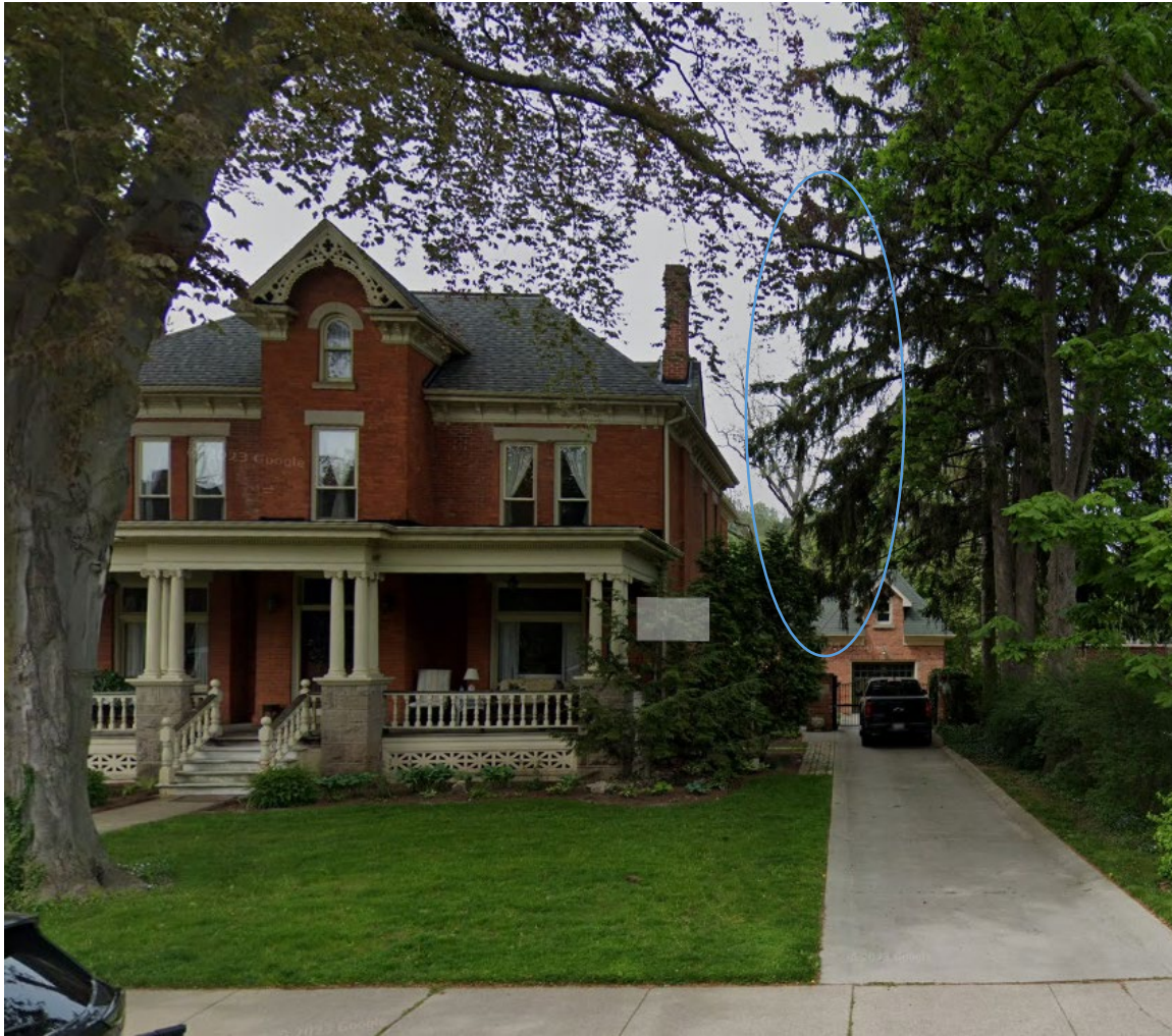
Figure 2: View of tree from public right of way