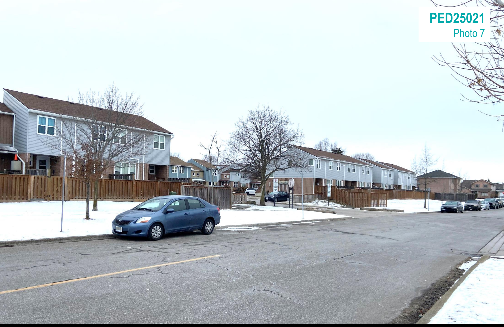
Subject Lands looking northwest from Redmond Drive