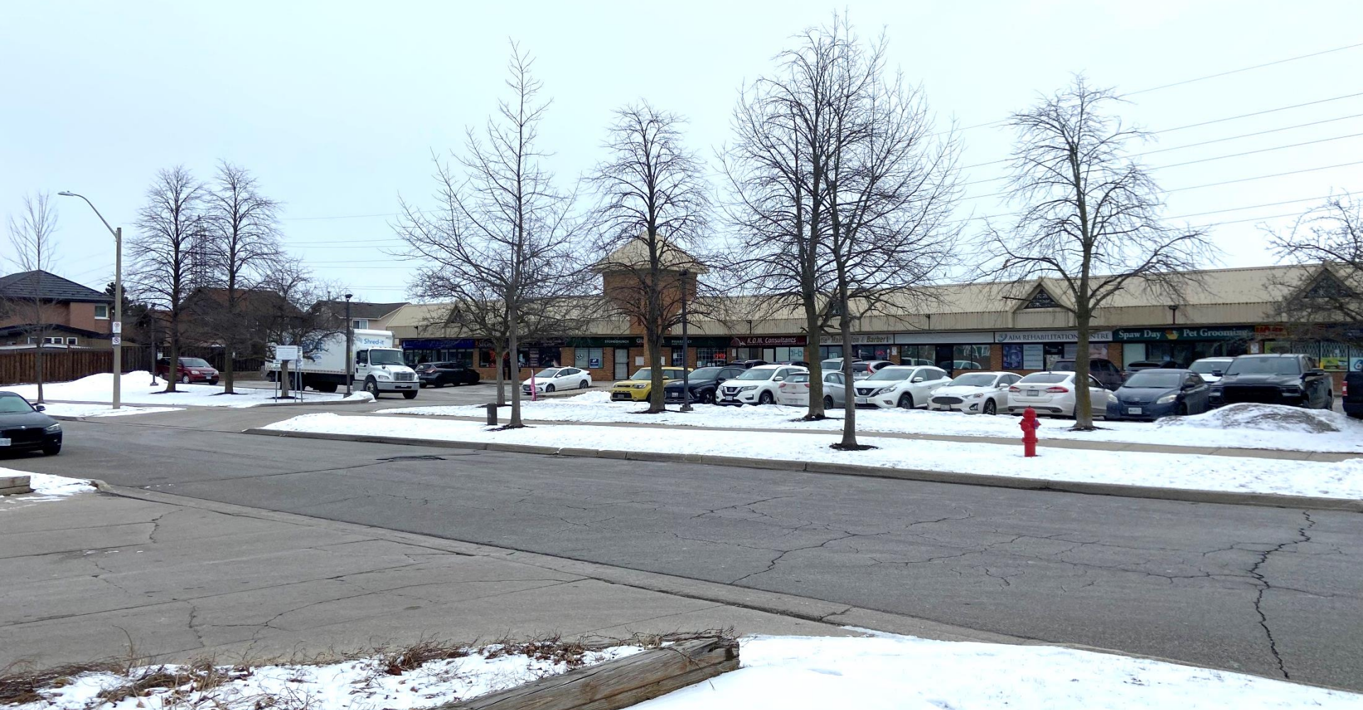
Commercial Plaza east of Subject Lands