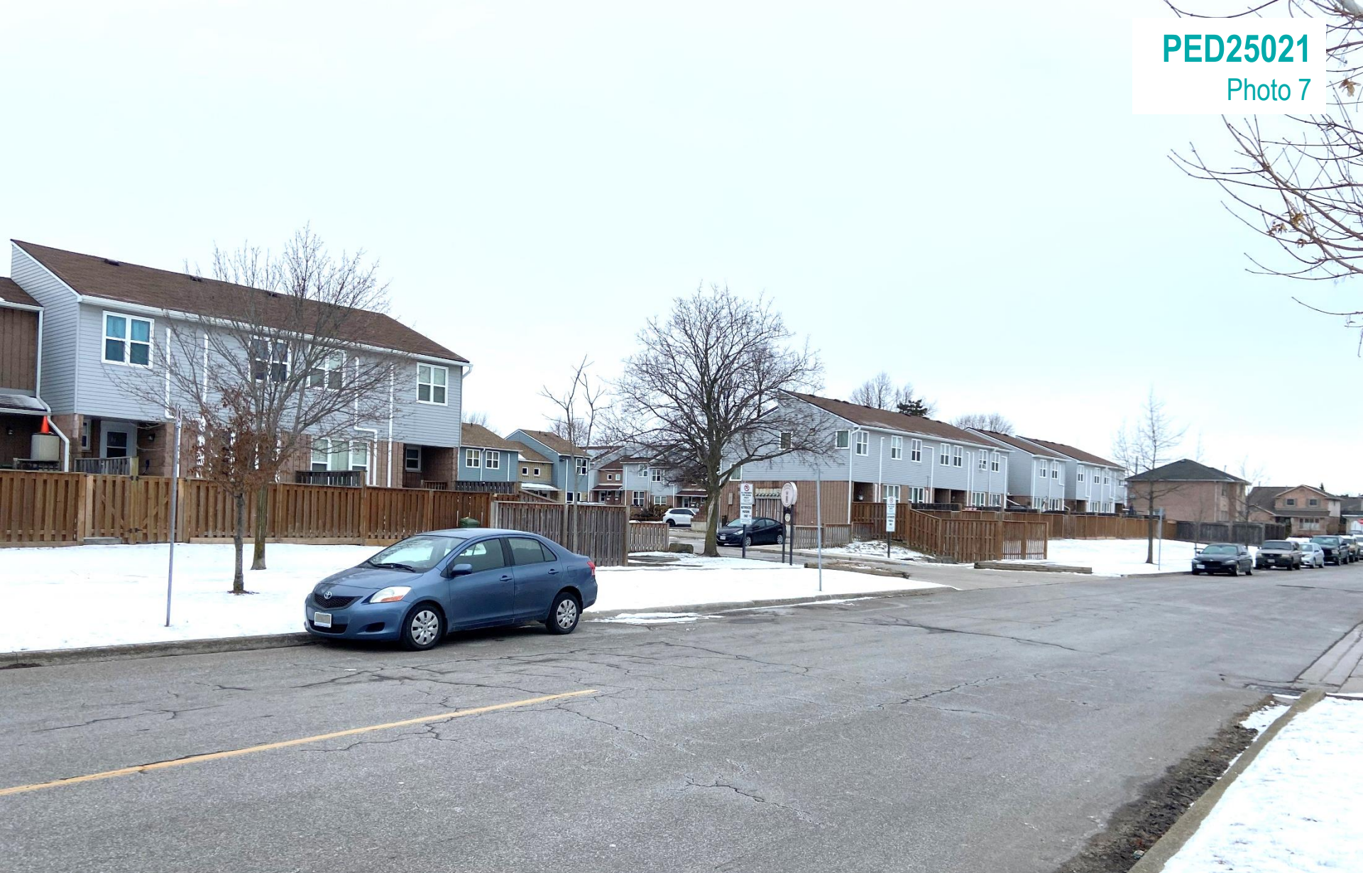
Subject Lands looking northwest from Redmond Drive