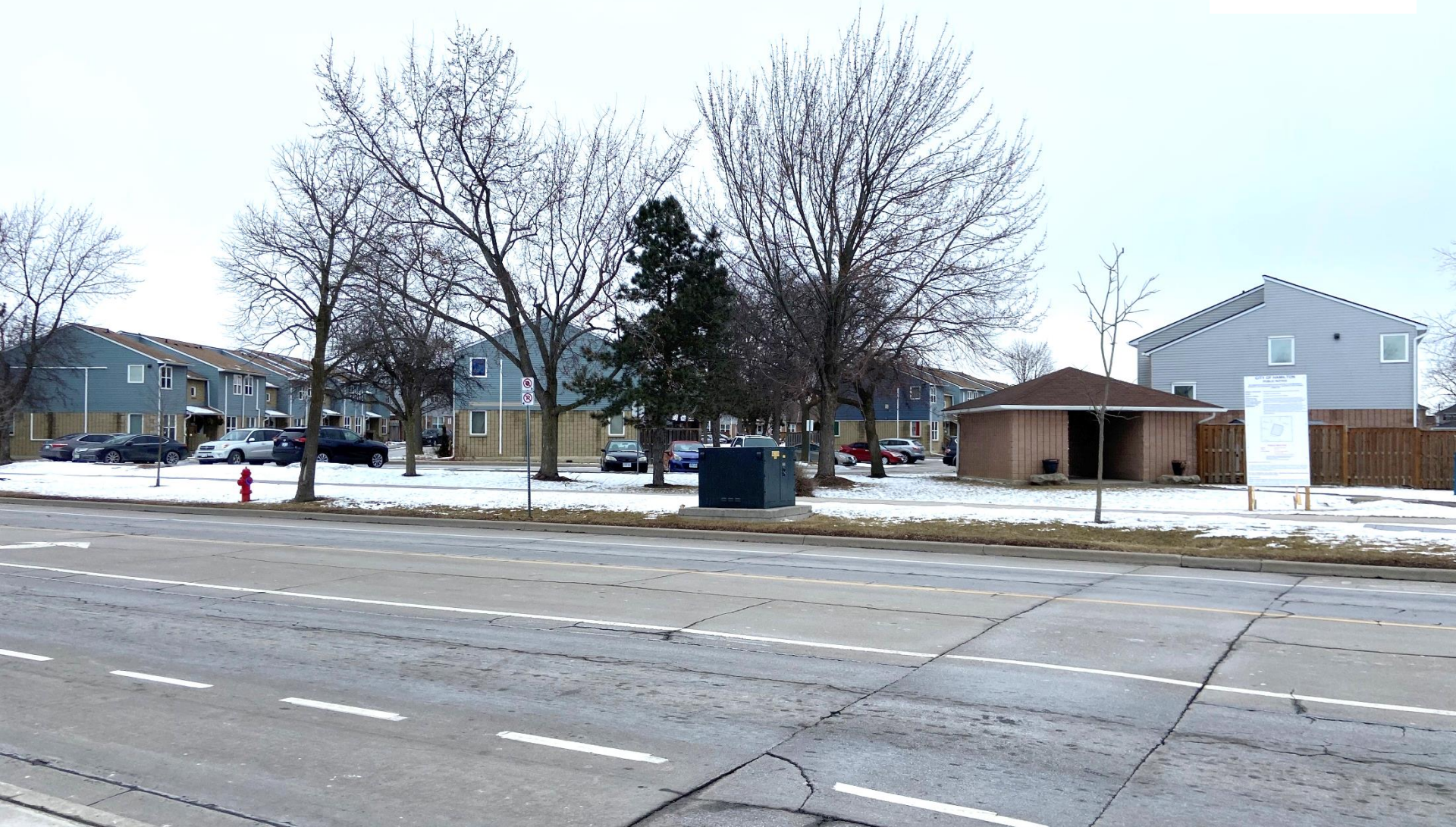
525 Stone Church Road East