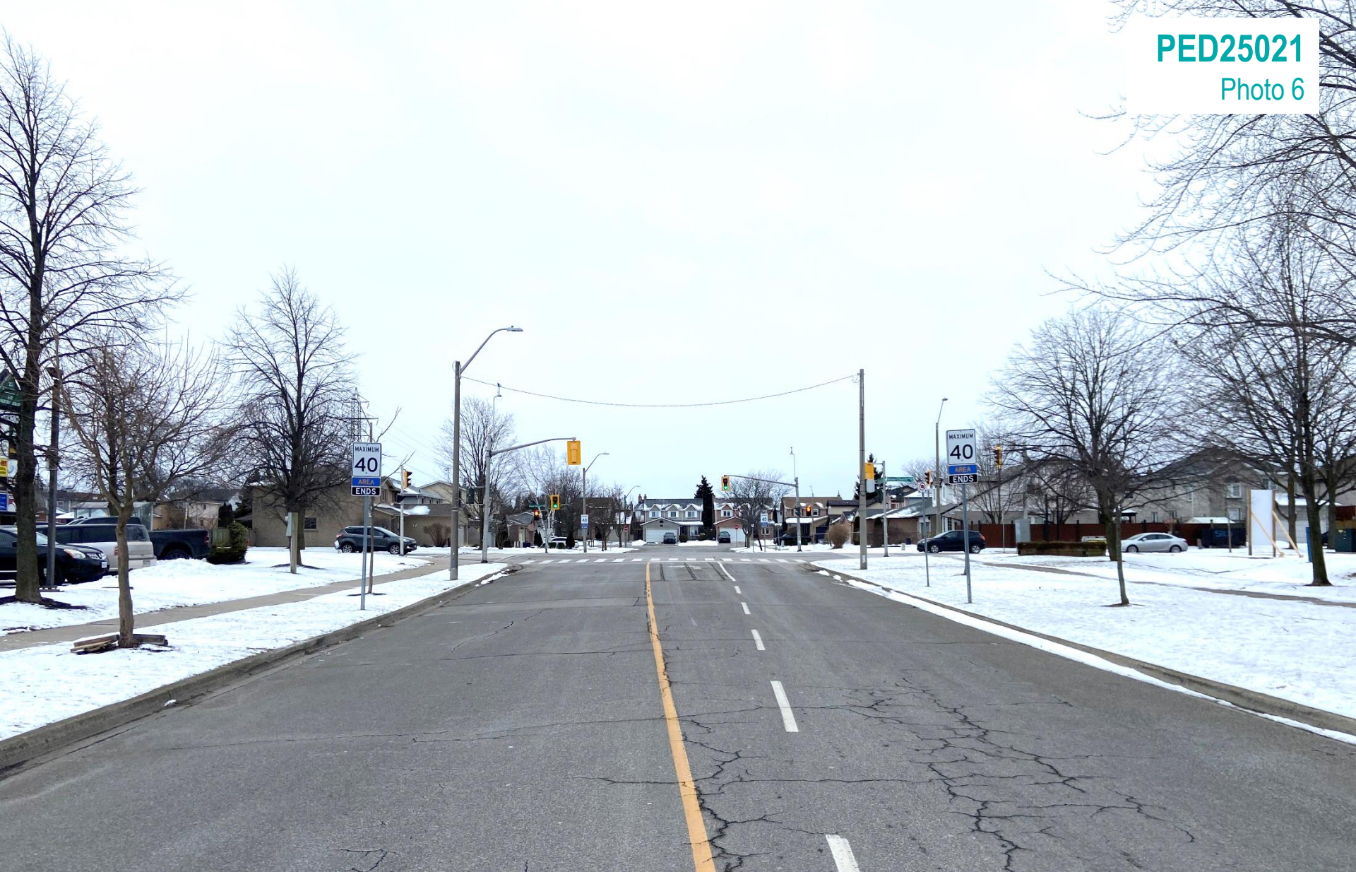
Redmond Drive looking south