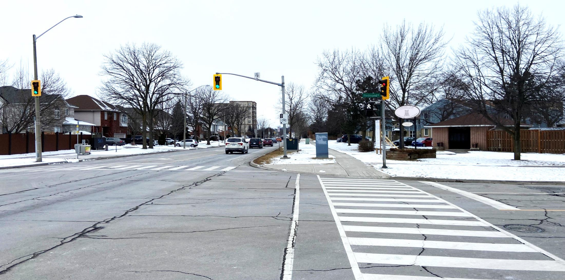
Stone Church Road East and Redmond Drive looking west