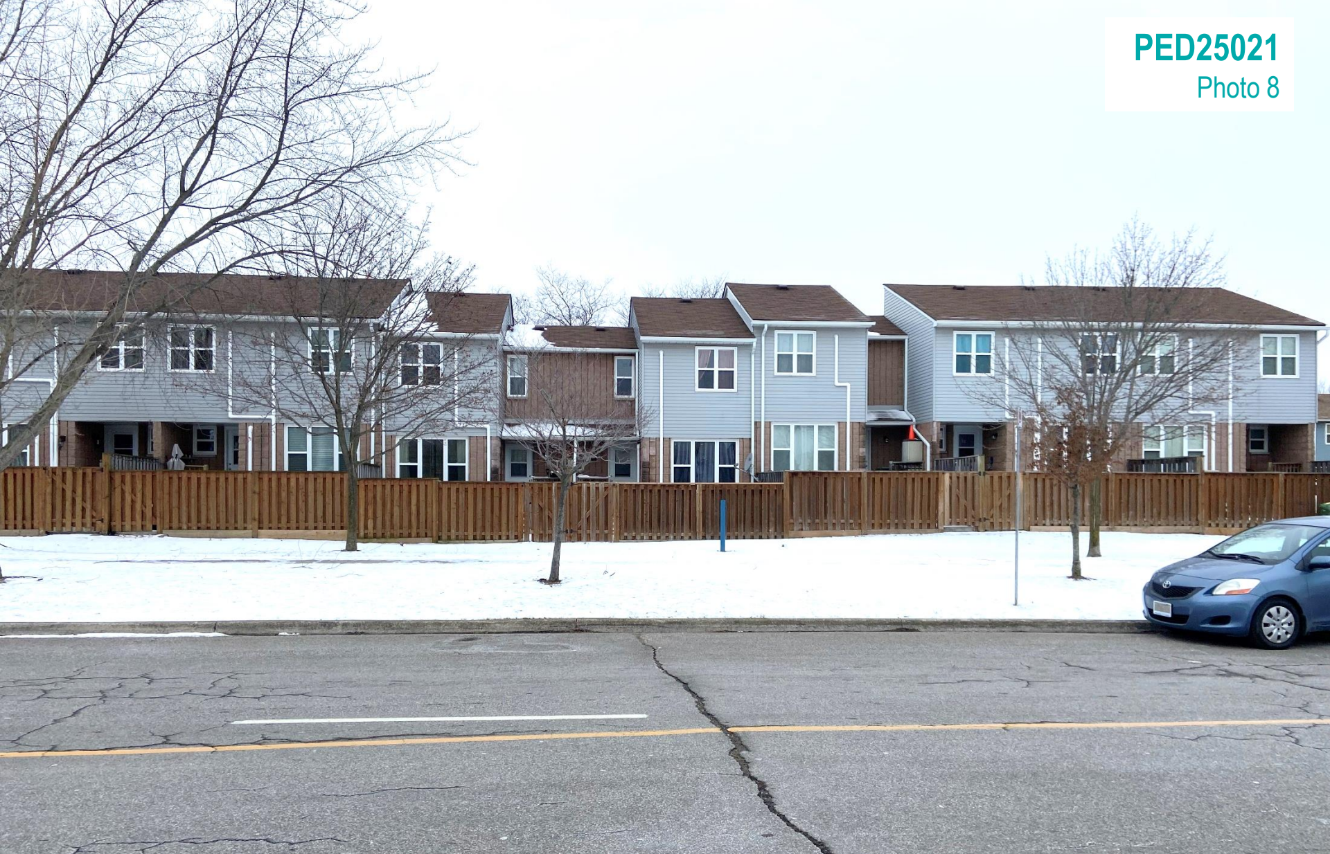
Townhouse block to be replaced by eight storey multiple dwelling