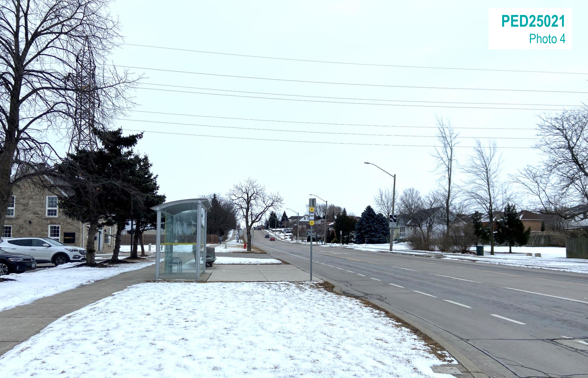
Stone Church Road looking east