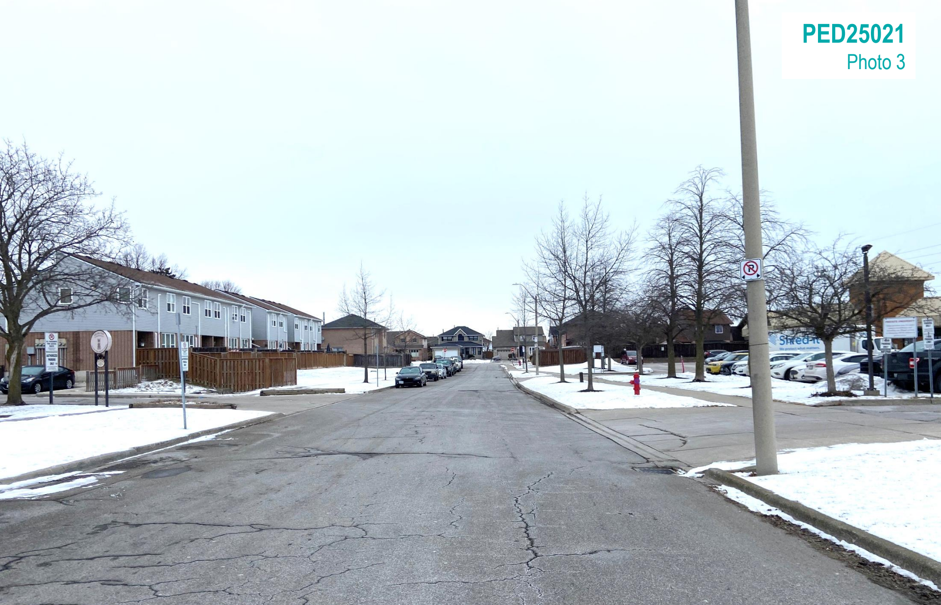
Redmond Drive looking north