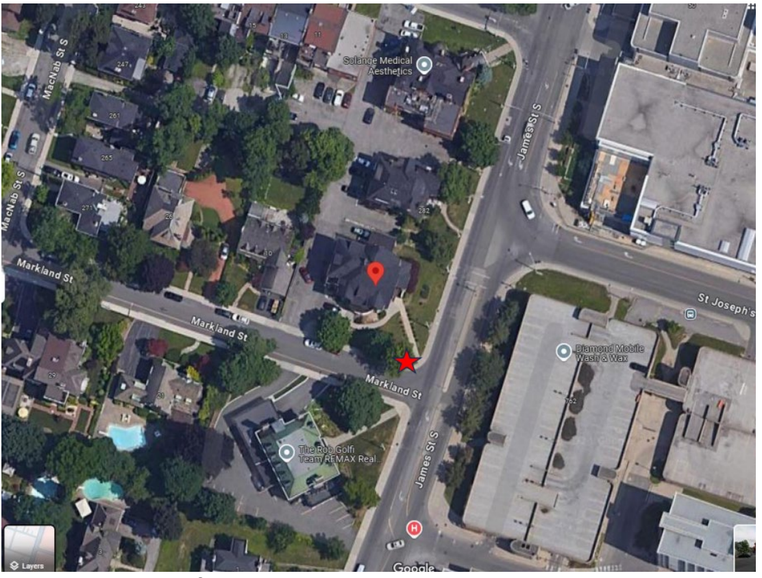
Figure 1: Location of property and tree to be removed, marked with a red star