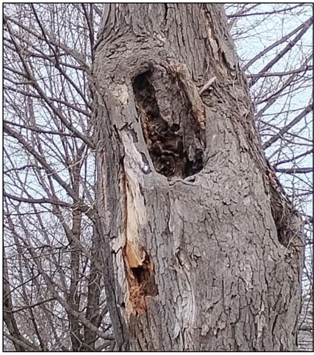
Figure 6: Additional proof of the rotting trunk and tree starting to split.

Figures 4 and 5: Photographs of the Sugar Maple flagged for immediate removal.