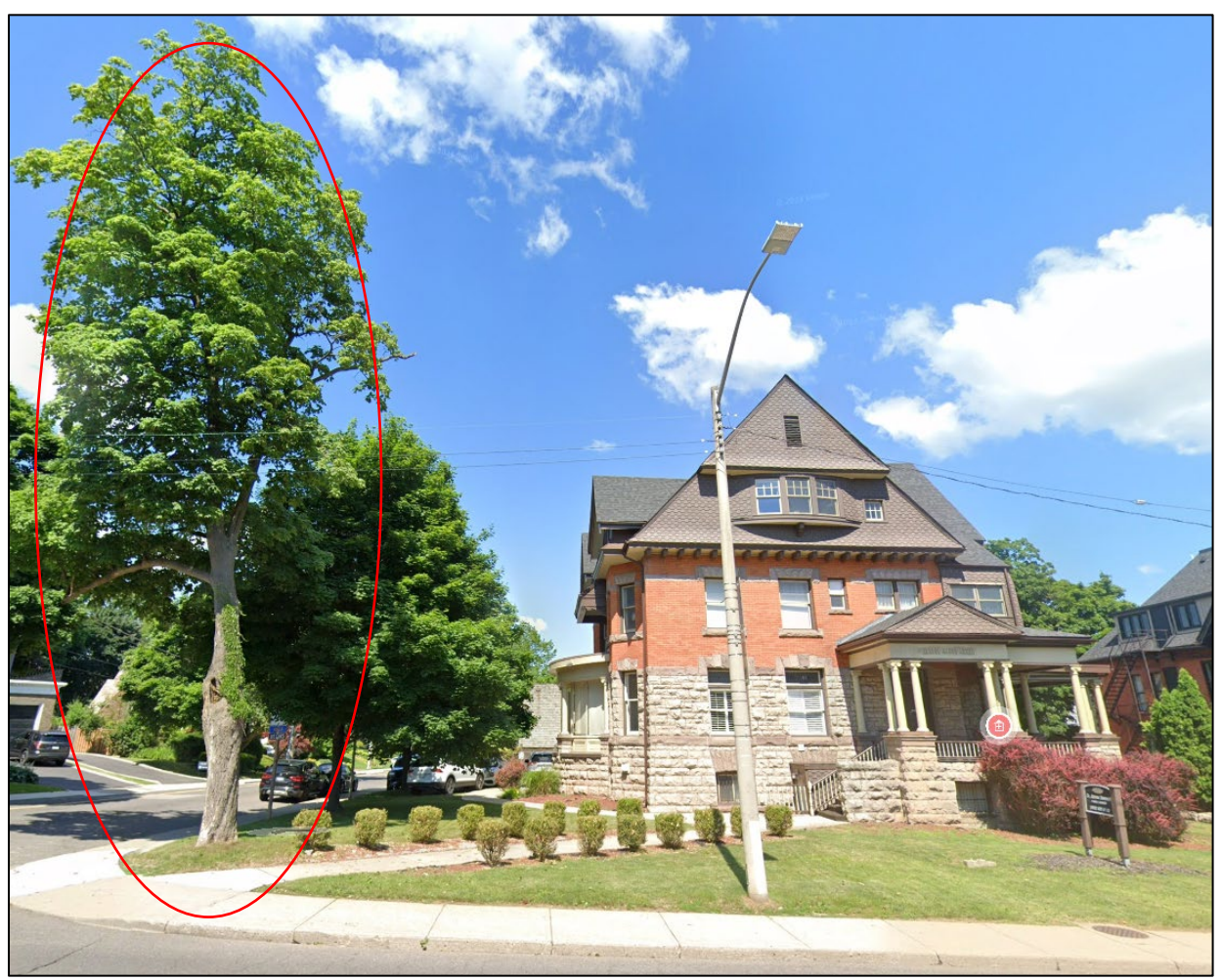
Figure 3: Tree to be removed looking west from James Street South, outlined in red. The front elevation of 268 James Street South is on the right.