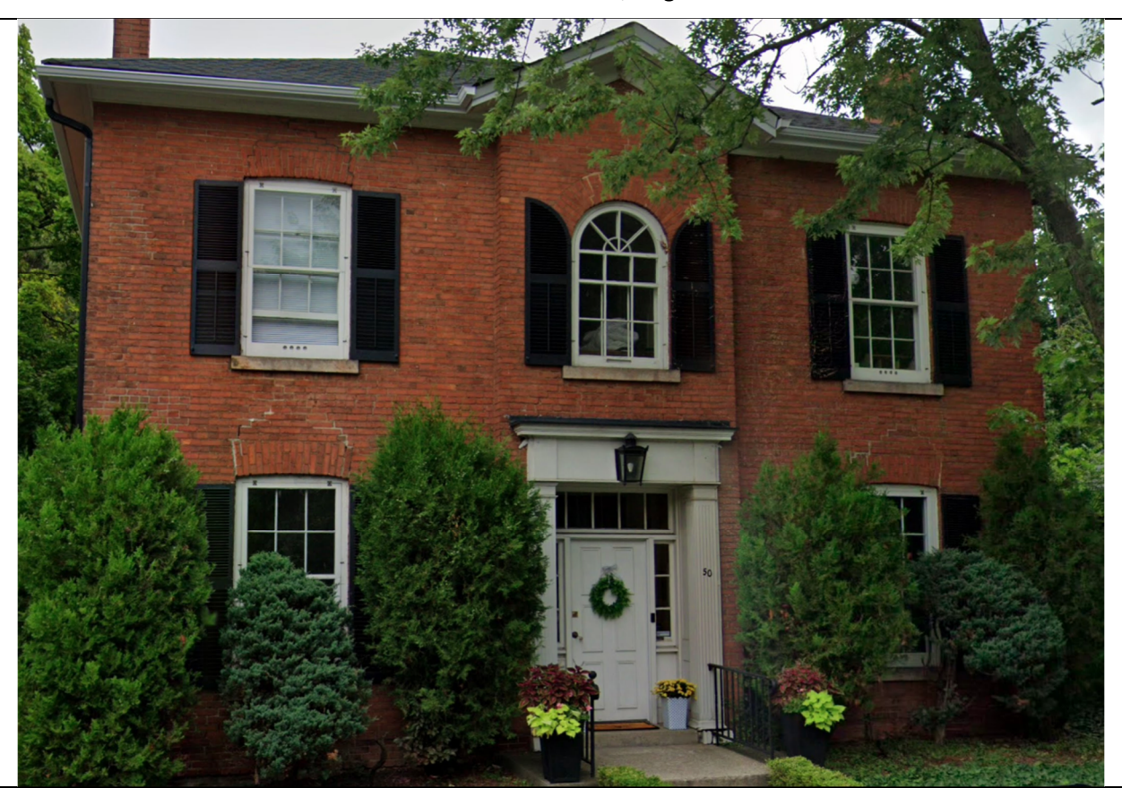
Patterson House (Oakville) 1835 – Ivory White