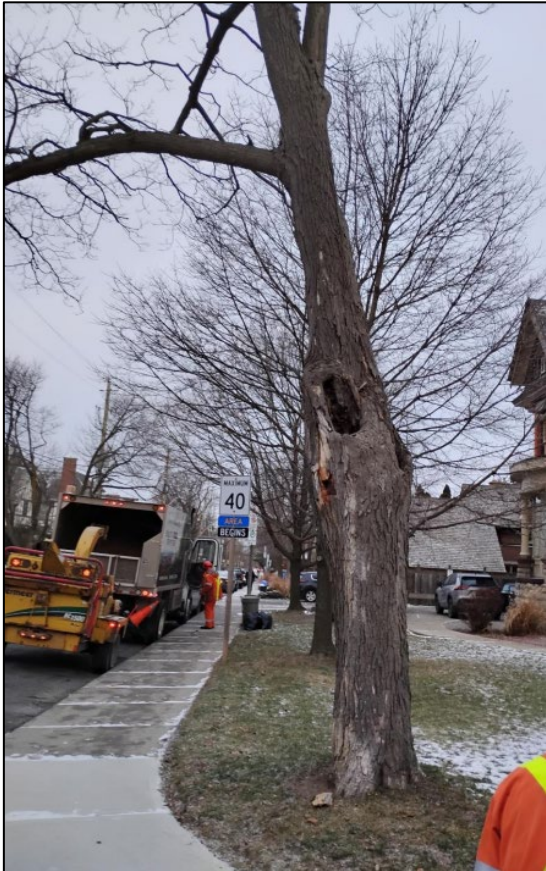
Figures 4 and 5: Photographs of the Sugar Maple flagged for immediate removal.