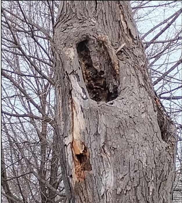
Figure 6: Additional proof of the rotting trunk and tree starting to split.