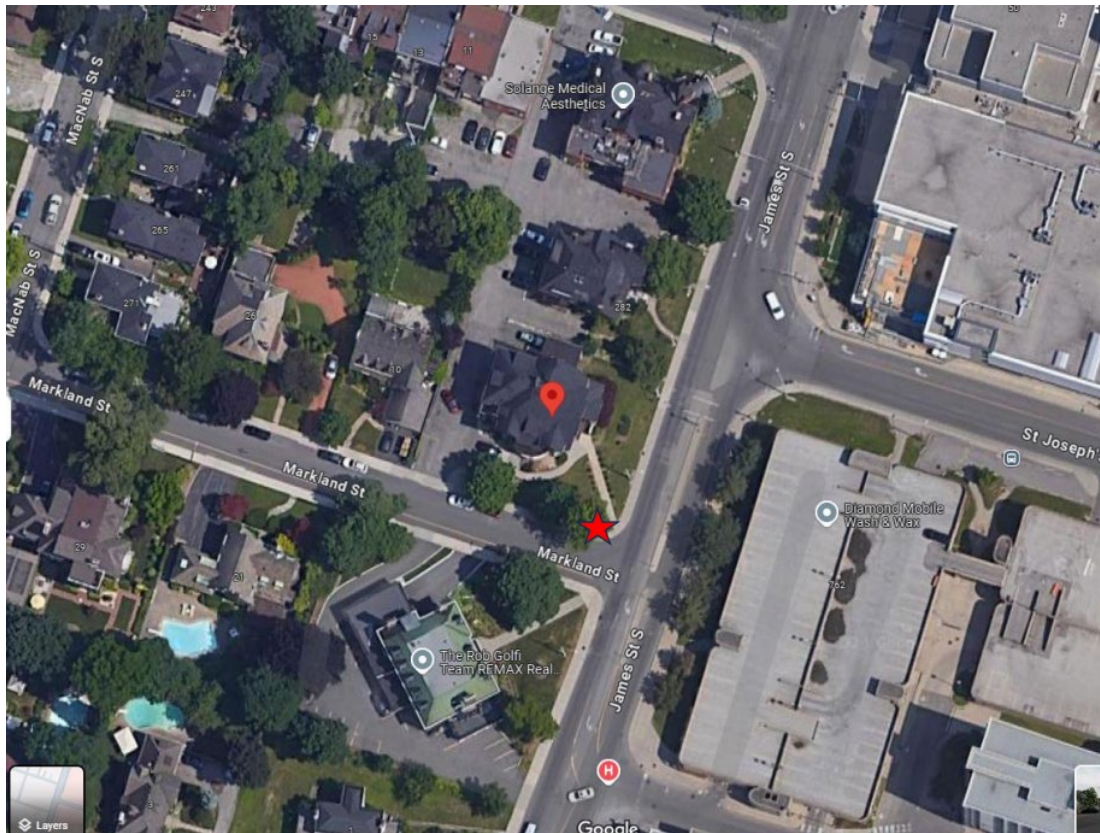
Figure 1: Location of property and tree to be removed, marked with a red star