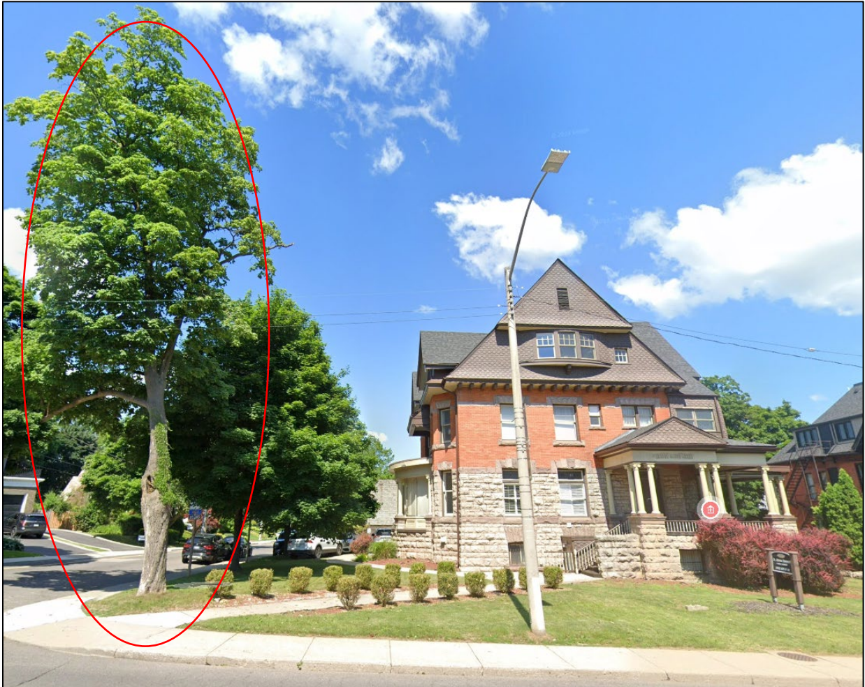
Figure 3: Tree to be removed looking west from James Street South, outlined in red. The front elevation of 268 James Street South is on the right.