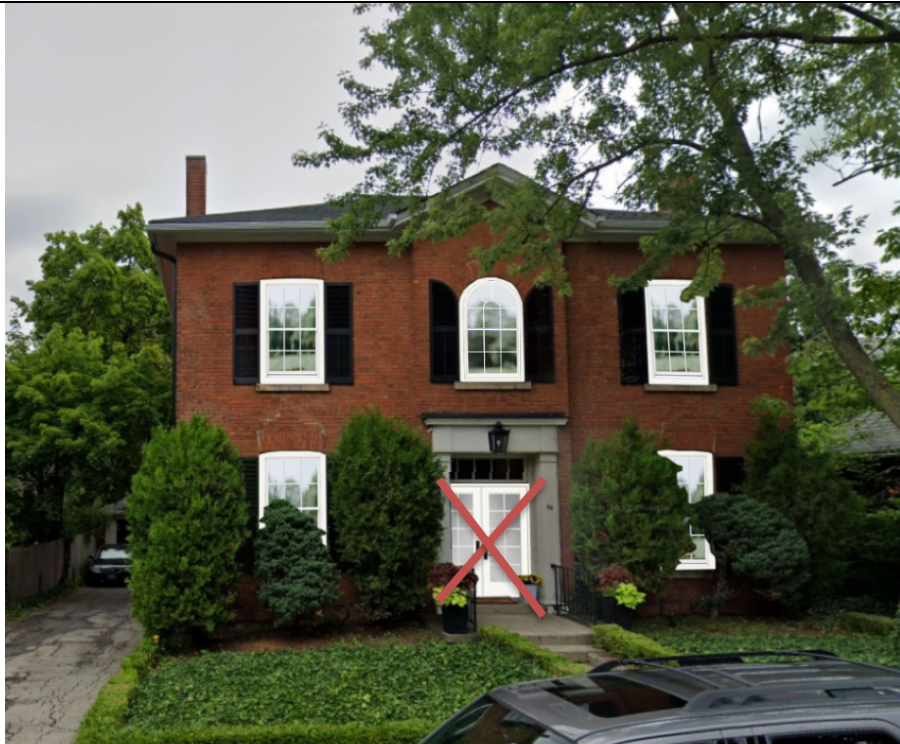
Render of replaced windows, following restoration

The remaining windows (non street facing) shall be under separate heritage application.