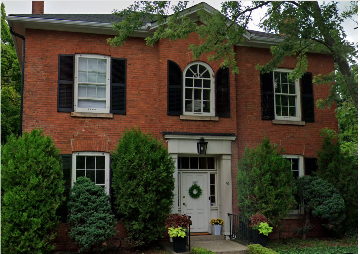
Patterson House (Oakville) 1835 – Ivory White