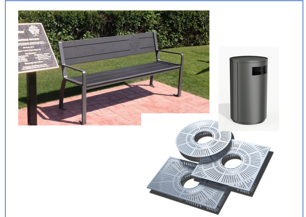
Vendor photos of selected street furniture models: Bench by Maglin; Waste container by Maglin; Tree grates by Ironsmith