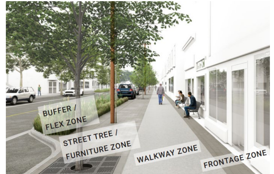
Illustration of pedestrian zones in the Complete Streets Design Manual (p.54)