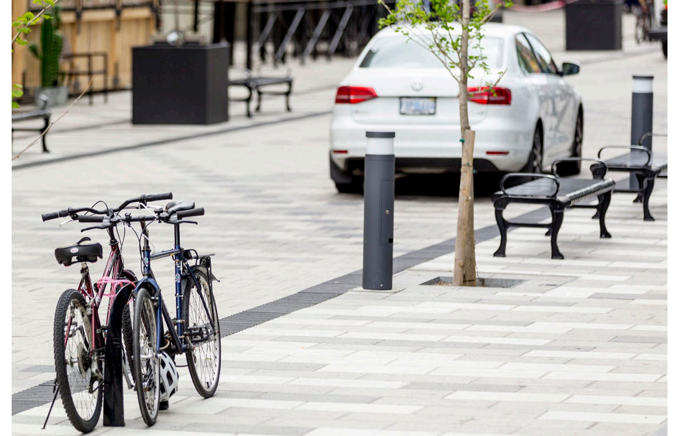
Pedestrian oriented streetscape on Argyle St (Halifax NS)