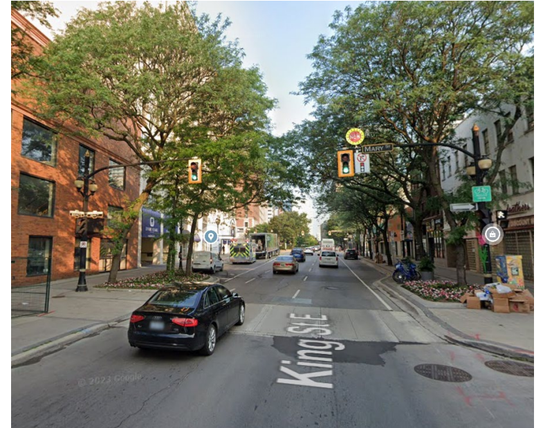
Google image of King St E, in International Village, viewing west from Mary St