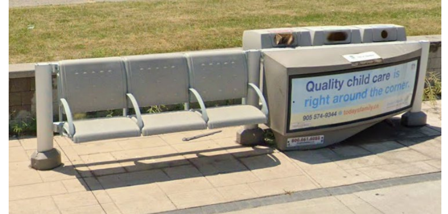
Google image of advertising bench and waste receptacle combination, near intersection of Queenston Rd and Nash Rd