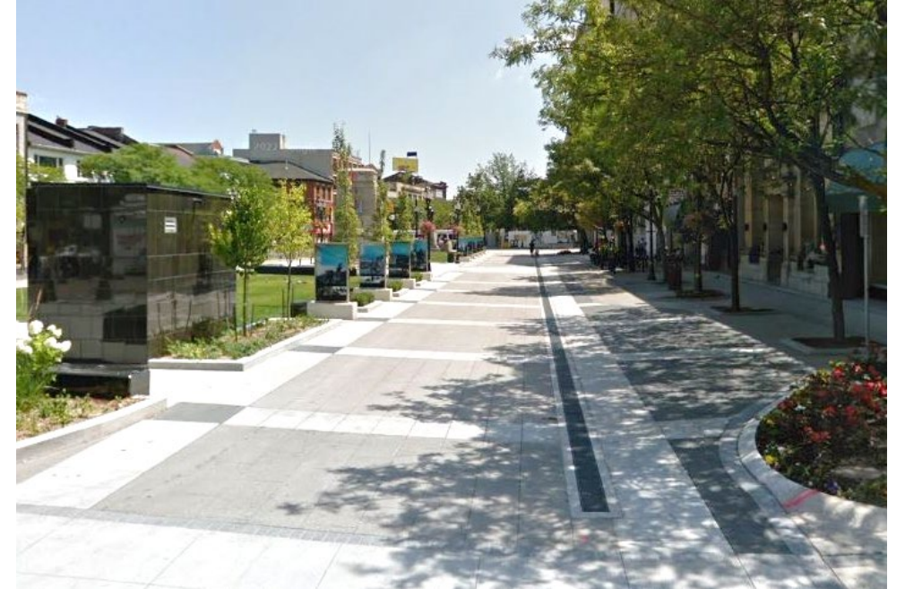
Google image of Gore Park improvements based on 'The Gore Standard: Hardscape Design'