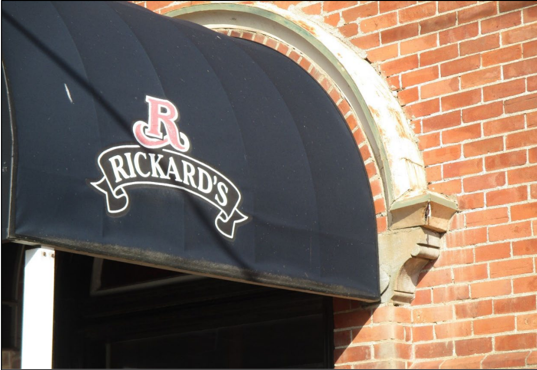
Figure 8: Detail view of archway over entrance on south elevation.