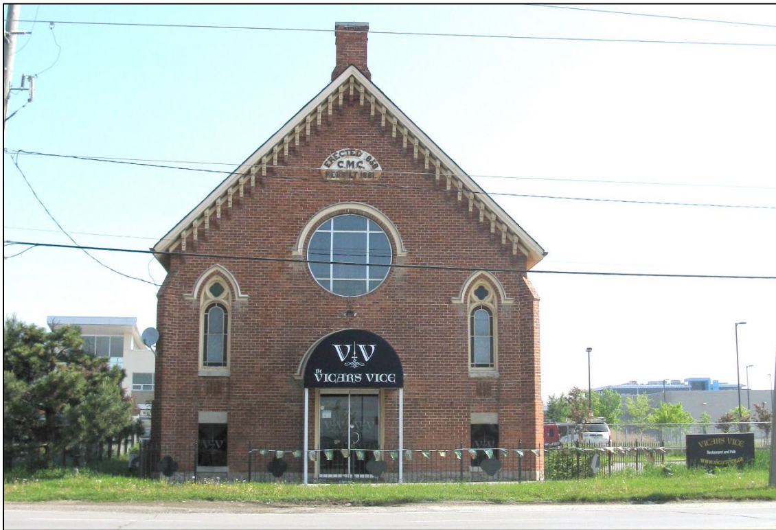
Figure 14: Front facade (City of Hamilton, 2013)