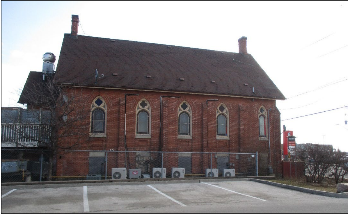
Figure 3: West elevation.