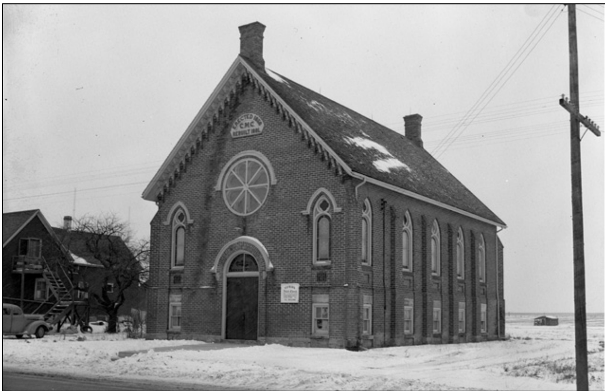
Figure 16: Former Elfrida Church (Hamilton Public Library, Special Collections, c. 1952)