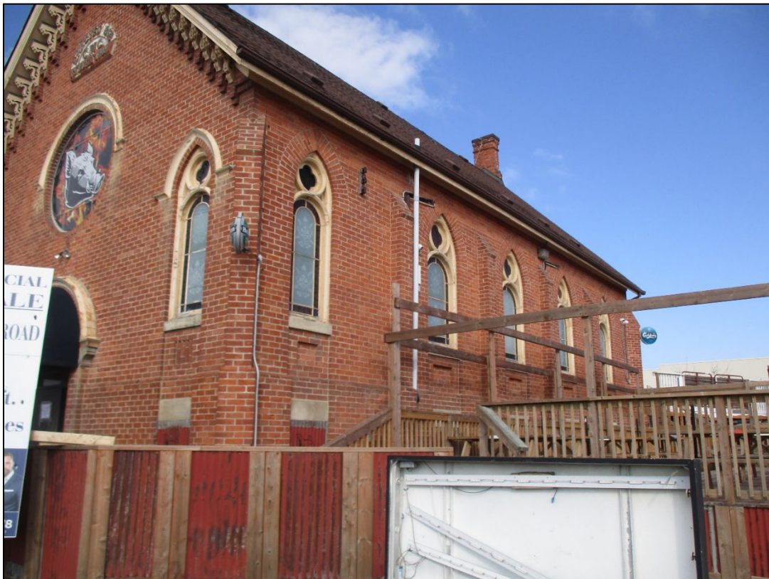
Figure 9: Southeast corner of subject property.