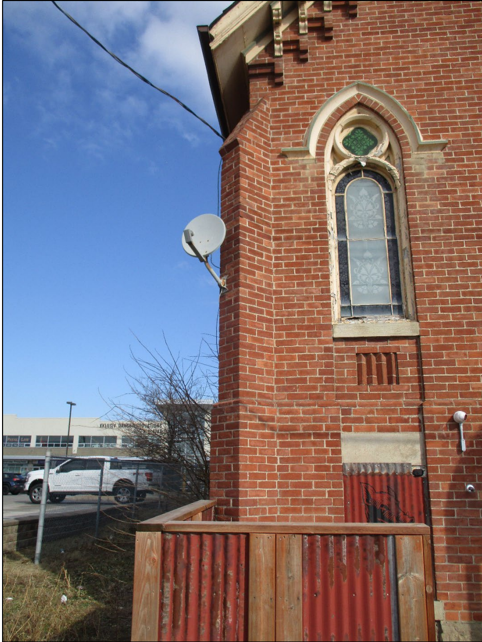
Figure 5: Detail view of window and buttresses on south elevation.