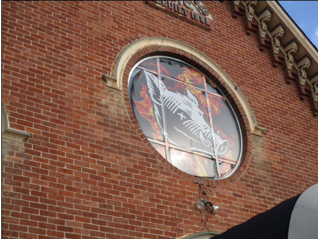
Figure 6: Detail view of rose window on south elevation.