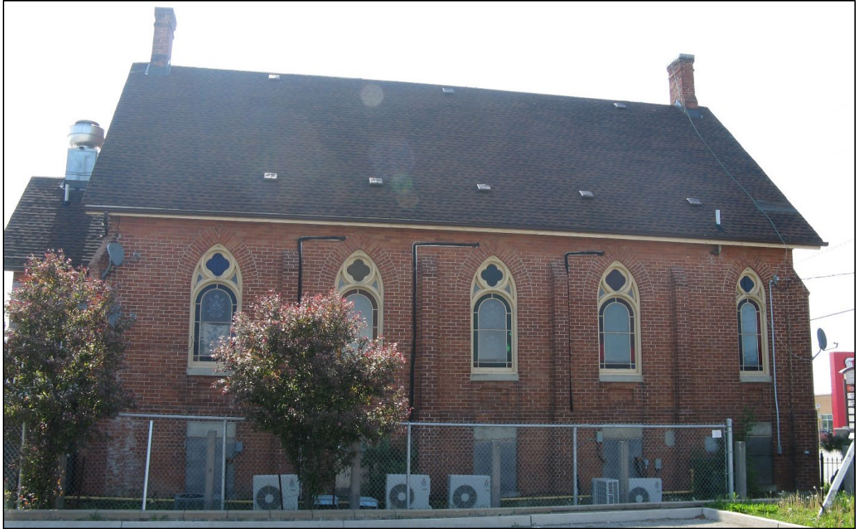
Figure 15: Side (west) facade (City of Hamilton, 2013)