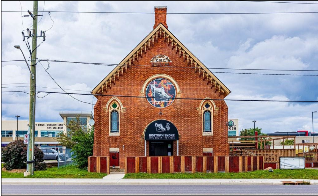
Figure 1: South Elevation of subject property

All images taken by City of Hamilton staff on February 9, 2024, unless otherwise noted.