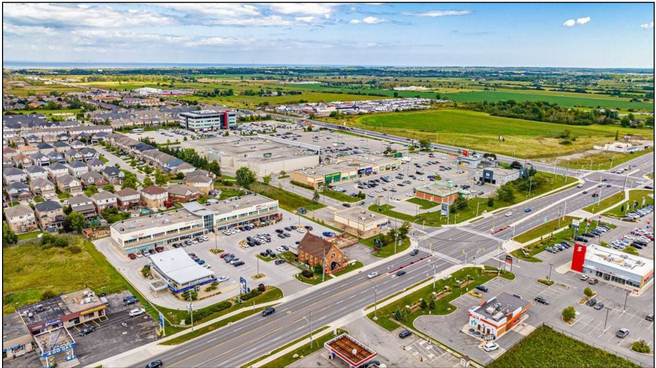
Figure 12: Aerial view showing physical context of subject property.