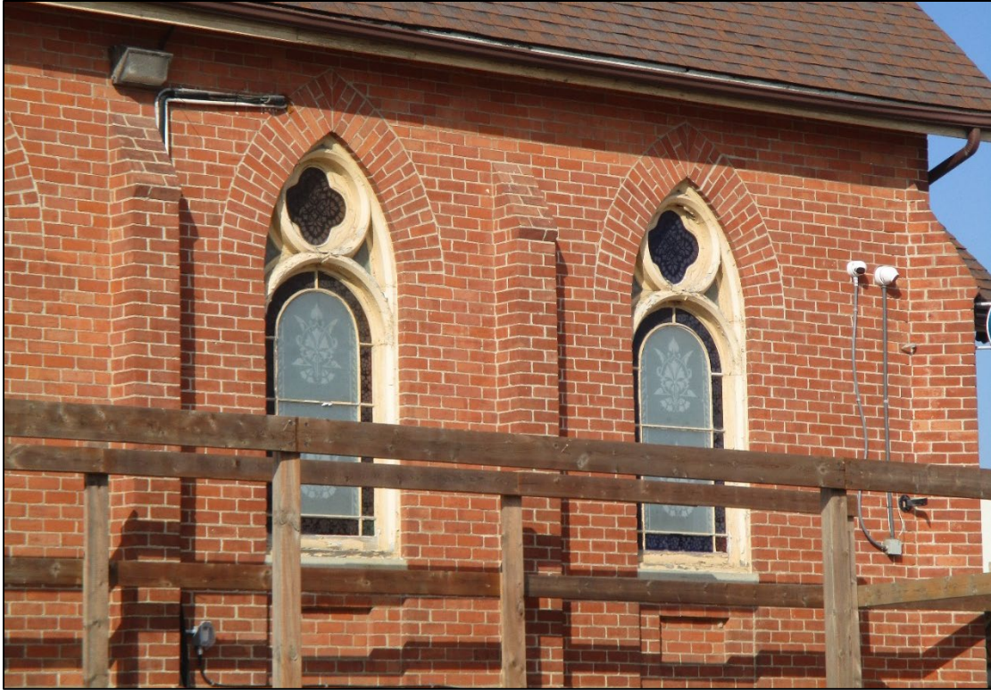
Figure 11: Detail view of east elevation.