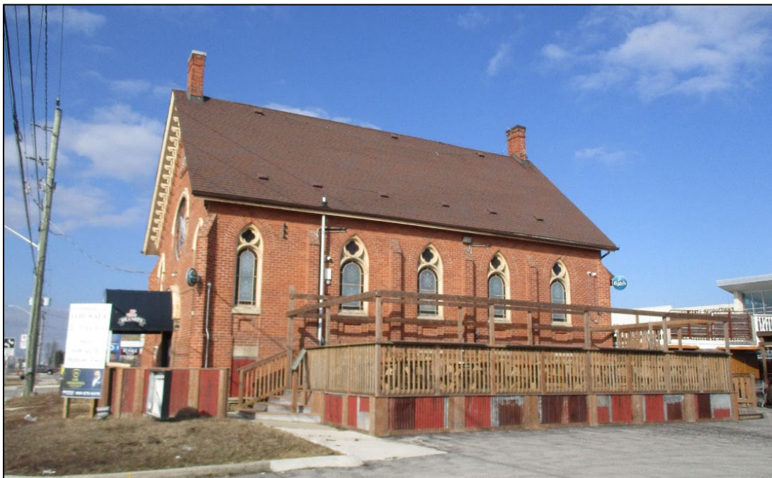
Figure 2: East elevation.