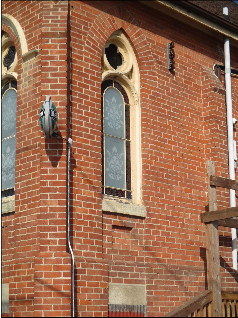
Figure 10: Detail view of east elevation.