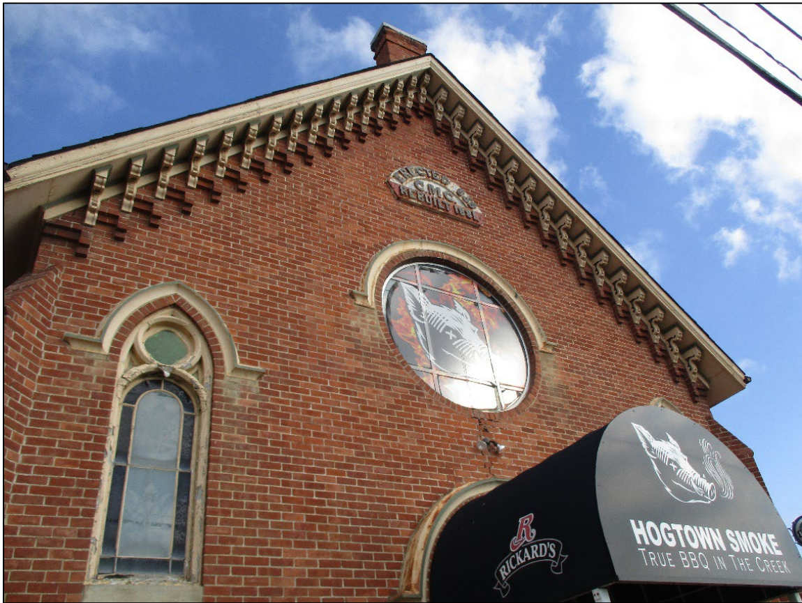
Figure 4: Detail view of south elevation.