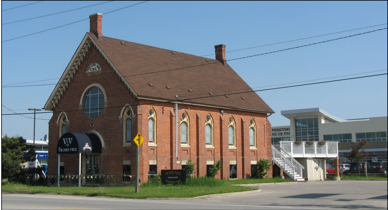
Figure 13: Looking northwest from Rymal Road East (City of Hamilton, 2013)