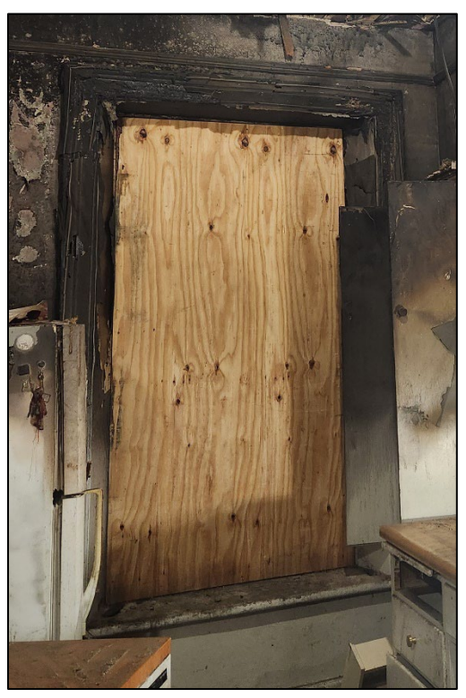
Figure 5: View from interior of one window to be replaced, due to damage from the fire.