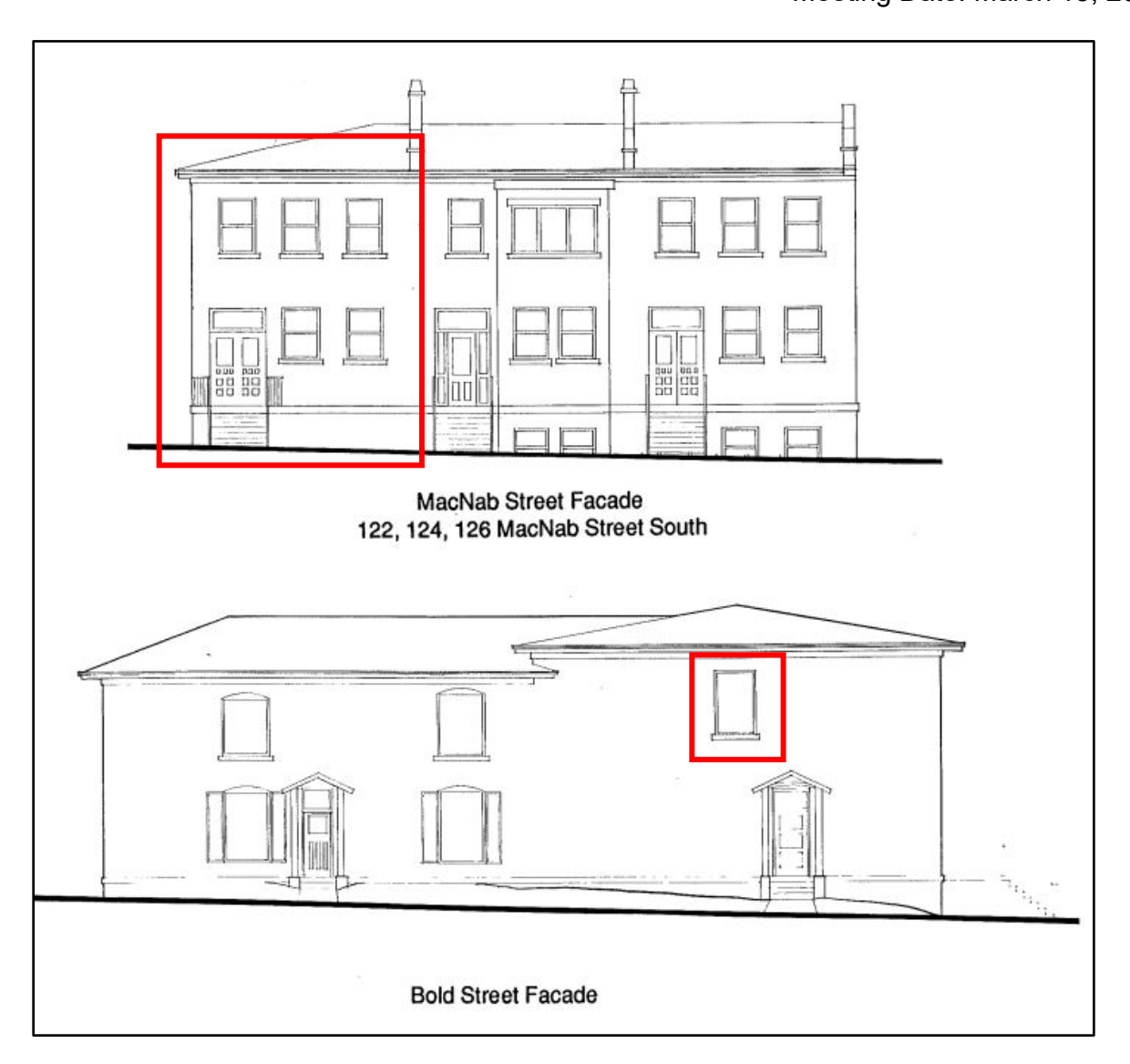
Figure 2: Line drawing from HCD plan windows and doors in scope highlighted in red.