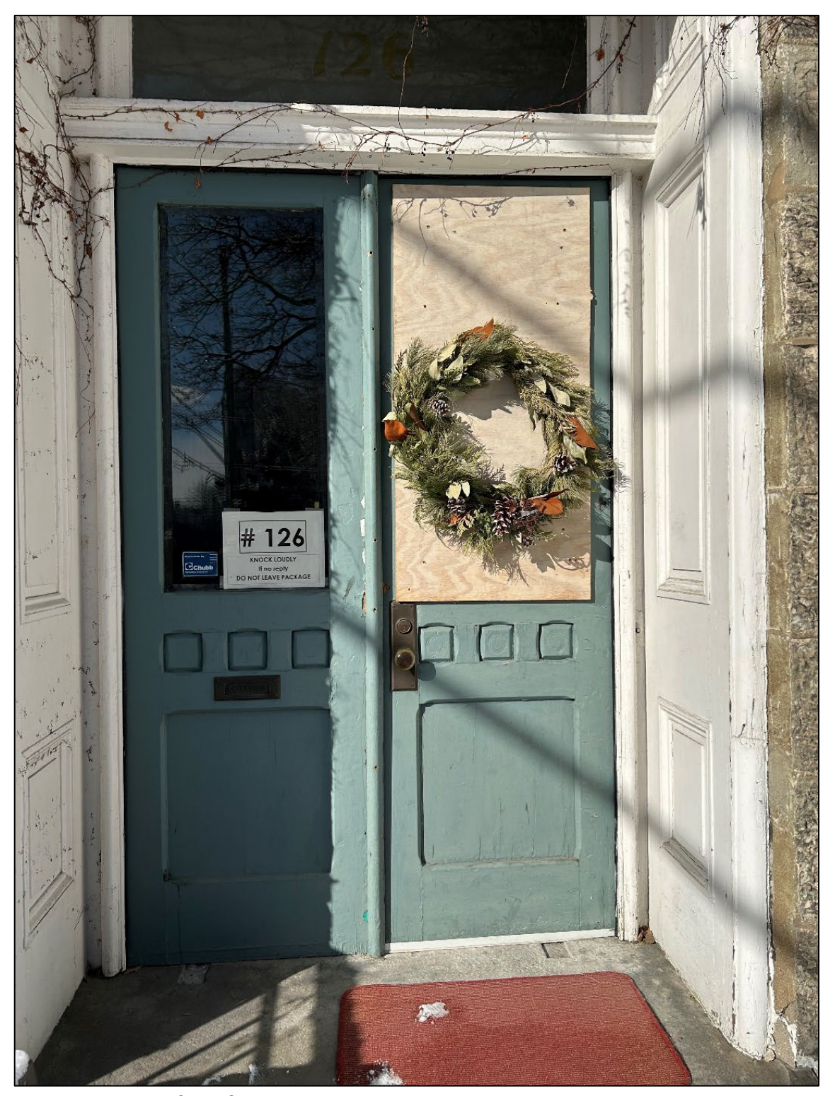
Figure 3: View of the front entry's existing condition.