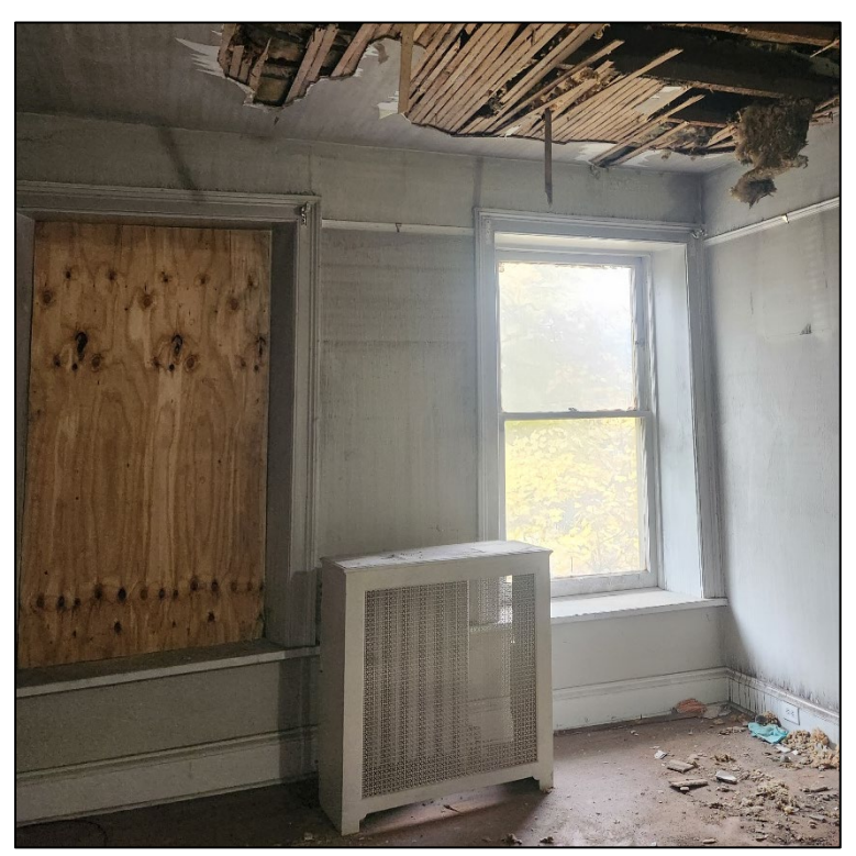
Figure 4: View from interior of one window to be replaced and one to be restored.