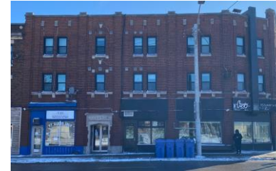
4/6 Ottawa St. N (Preserved)