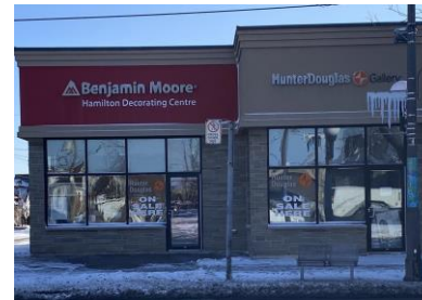
256 Ottawa St. N. (Non-contributing)