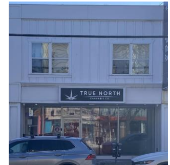
326 Ottawa St. N. (Contributing B)