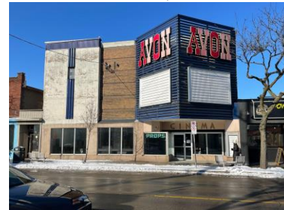
193 Ottawa St.N (Avon Theatre)