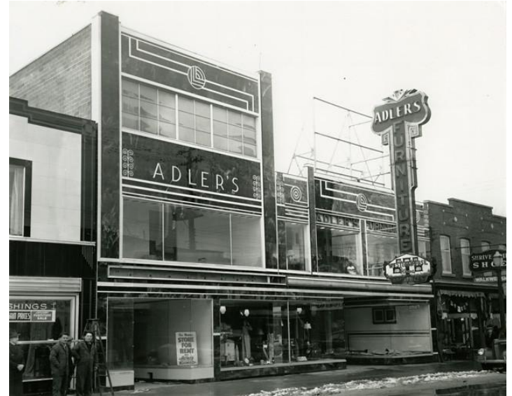
239-41 Ottawa St. N (1941)