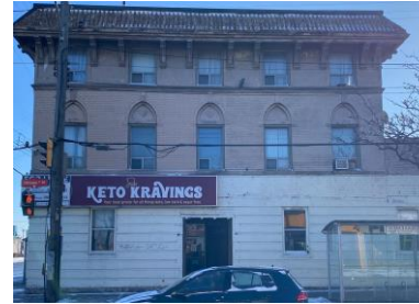
333 Ottawa St. N. (Contributing A)