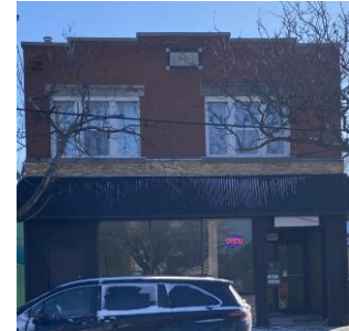
148 Ottawa St. N (Modified)