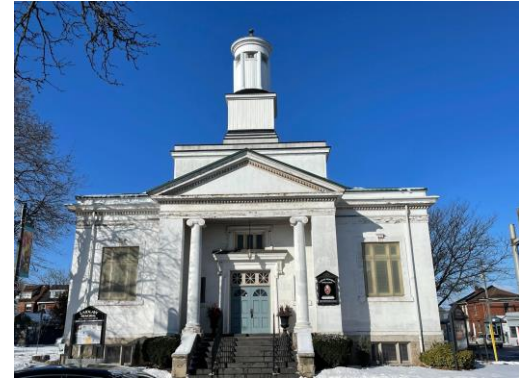
155 Ottawa St.N (Laidlaw United Church)