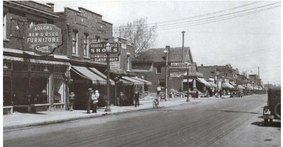
Ottawa and Campbell: Early 1930's