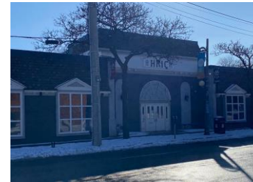
34 Ottawa St. N (Compromised)