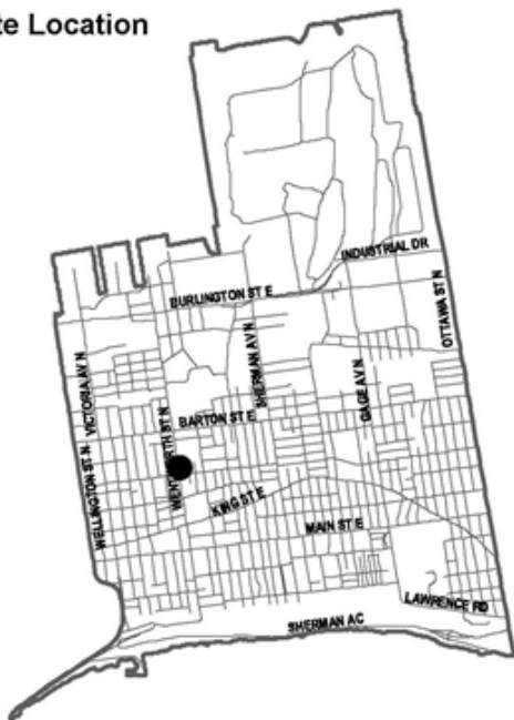
Key Map - Ward 3