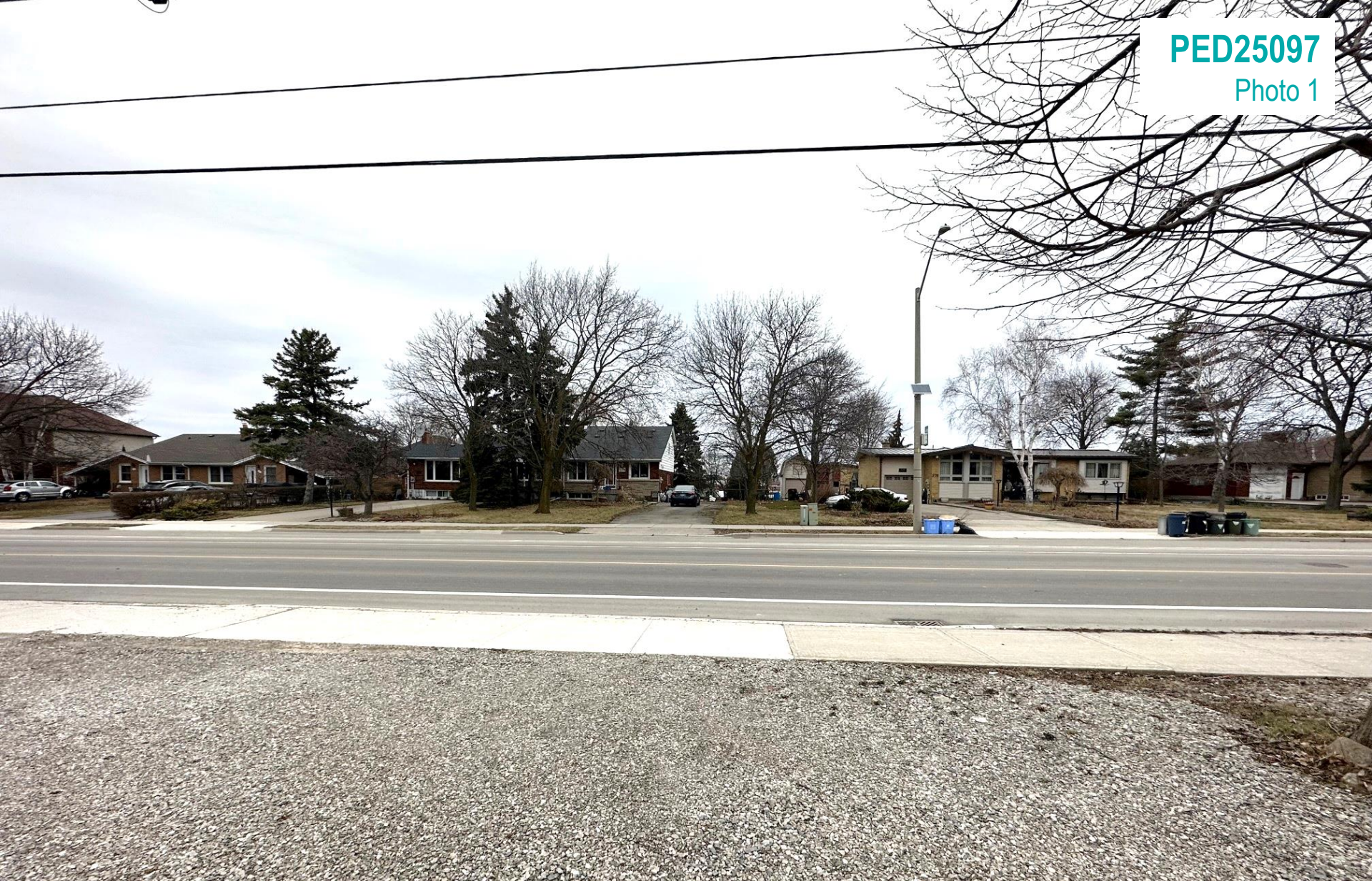
238 240 and 242 Highland Road West