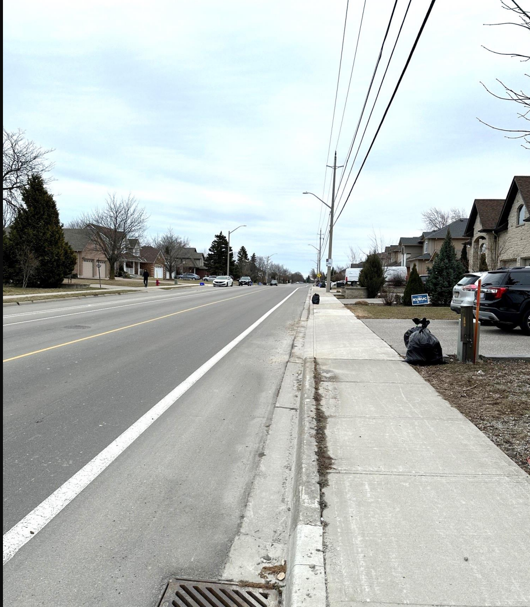
238 240 and 242 Highland Road West - Facing East