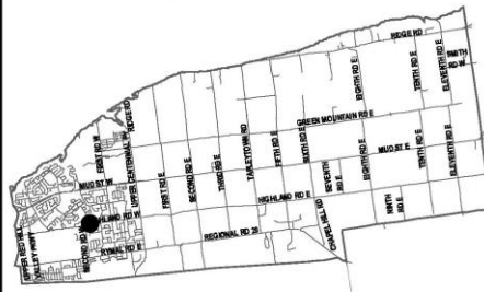
Key Map - Ward 9