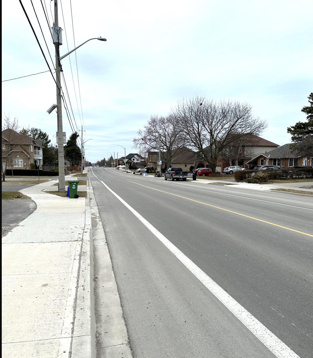
238 240 and 242 Highland Road West - Facing West