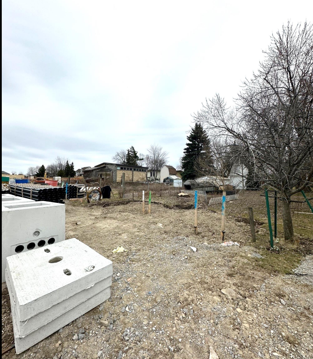
238 240 and 242 Highland Road West - Along Carlson Street Facing the rear of the subject lands