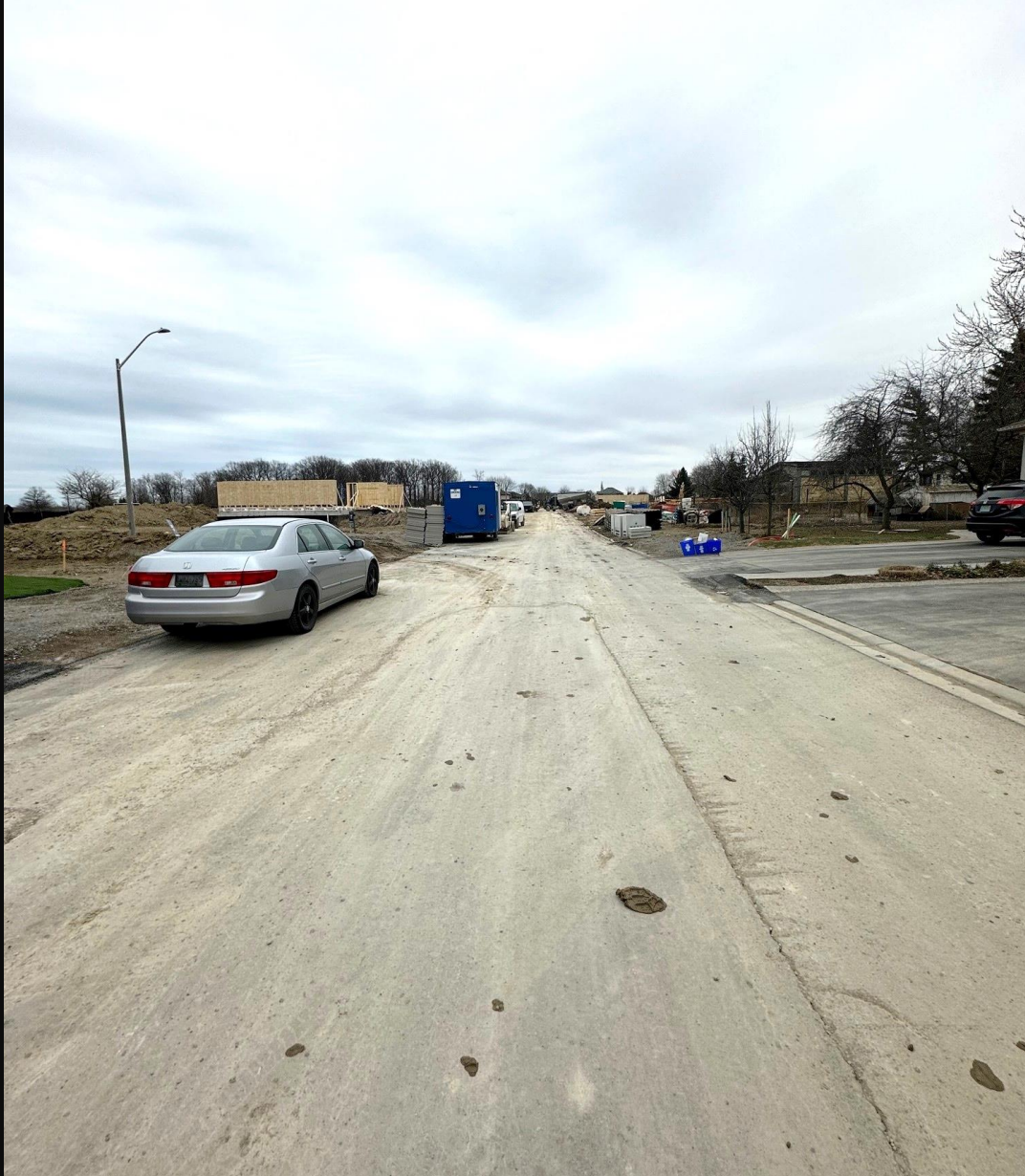
238 240 and 242 Highland Road West - Along Carlson Street