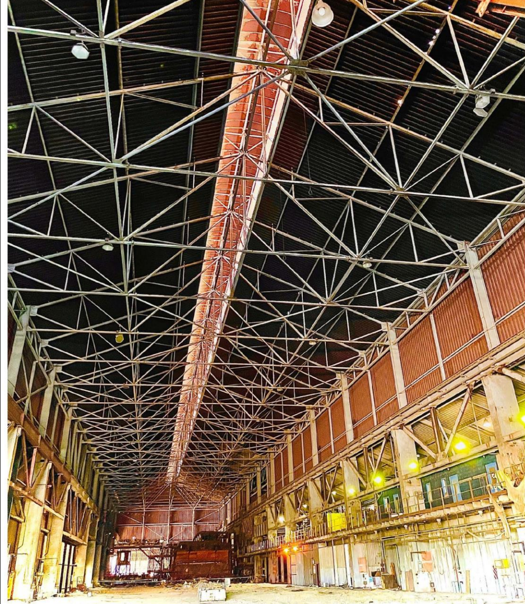
Interior dewatering facility building