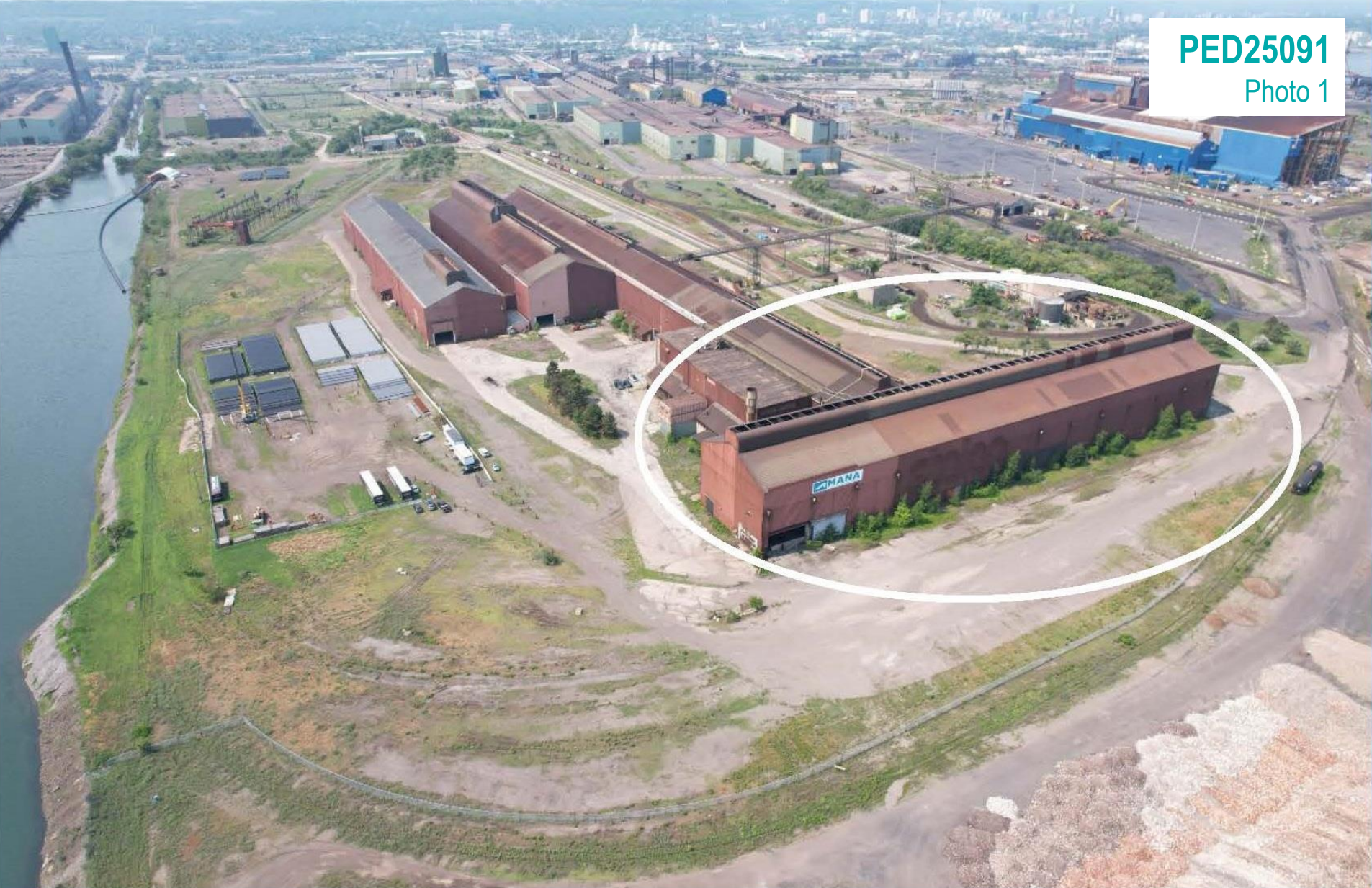
Dewatering facility building