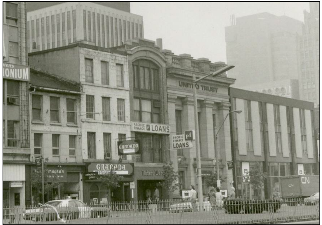
Image 11: Historic image of the front (north) elevation, circa 1973. (Hamilton L.A.C.A.C. Flashcard, circa 1973)