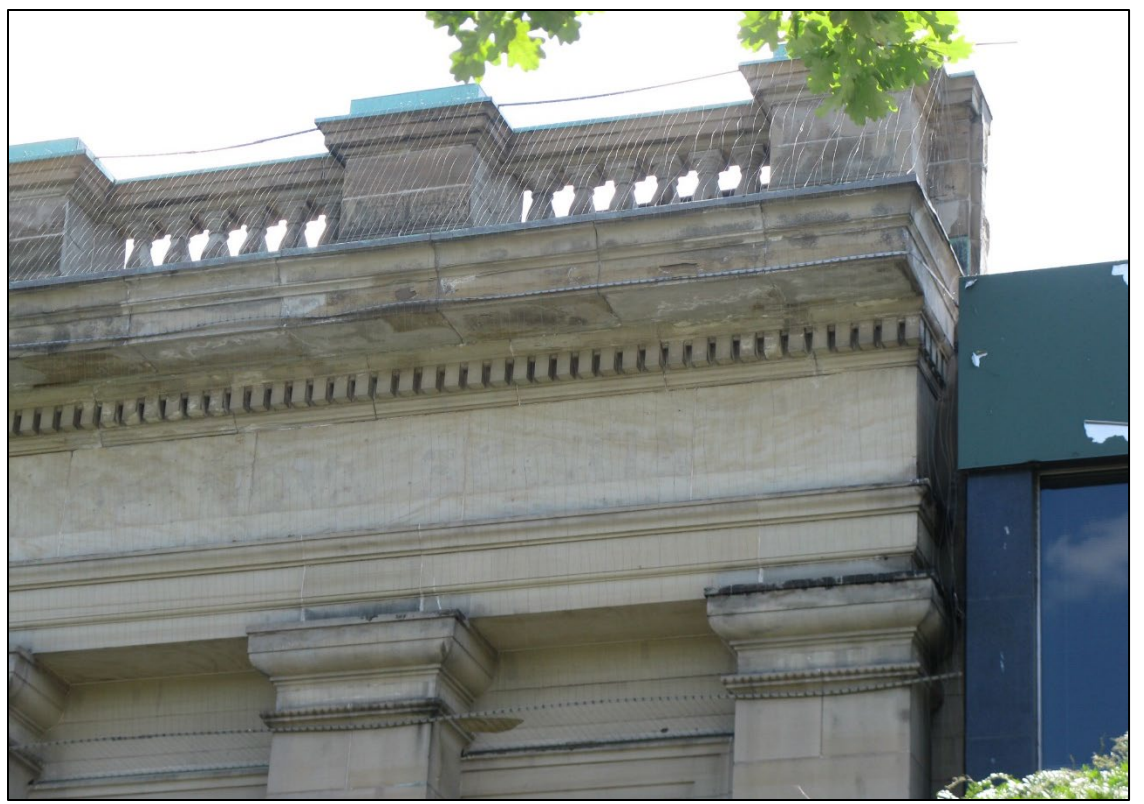
Image 4: Close-up of the stone balustrade, entablature, and doric capitals (July 10, 2012)