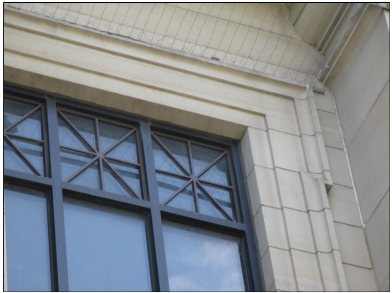
Image 6: Close up of multi-pane metal windows with decorative metal Roman lattice window grillwork (July 10, 2012)