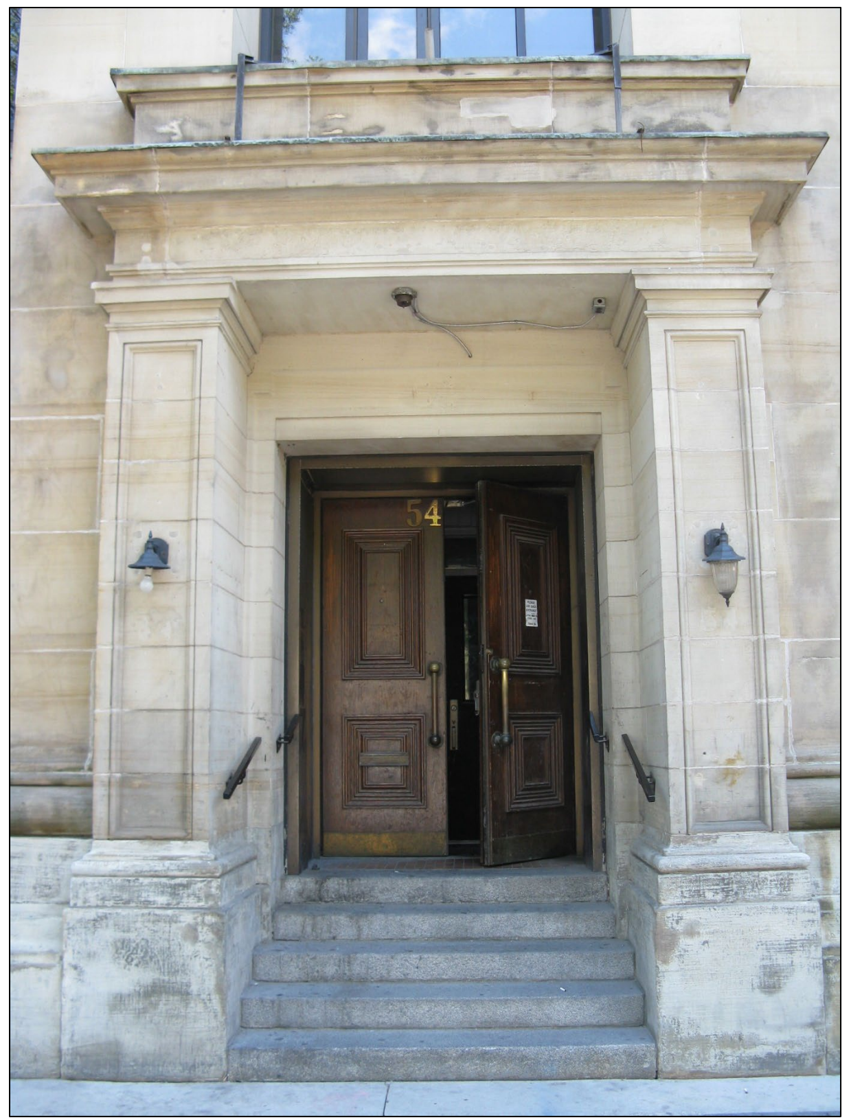
Image 7: Close-up of the recessed central entrance with stone surround, flanking columns with moulded panels and Doric capitals and entablature (July 10, 2012)