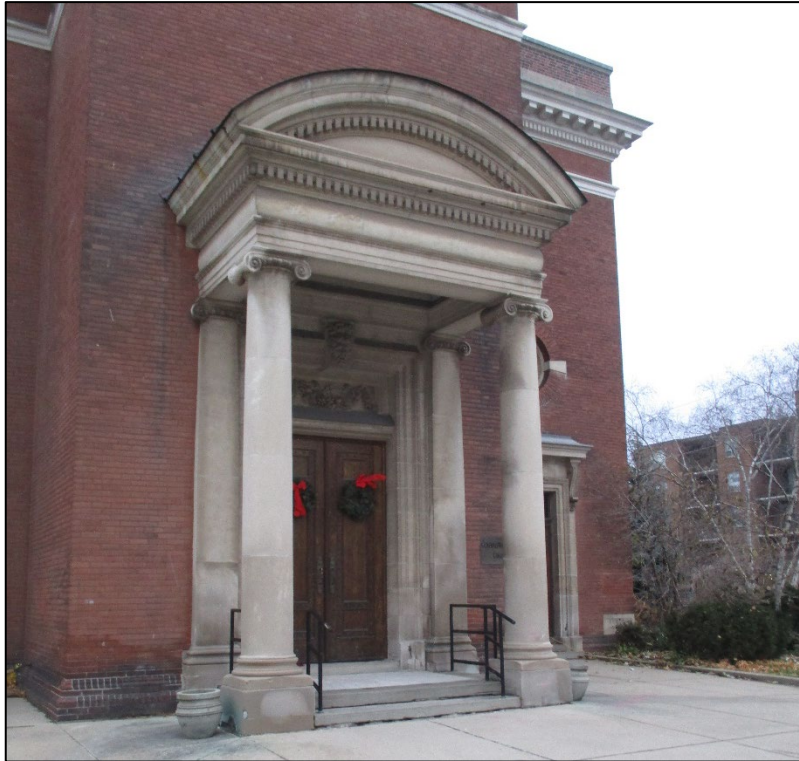
Figure 10: Detail view of front (east) elevation.