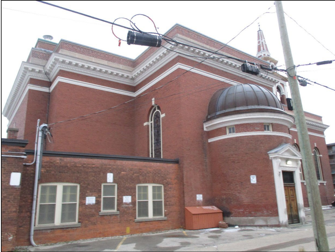
Figure 4: View of southwestern corner.