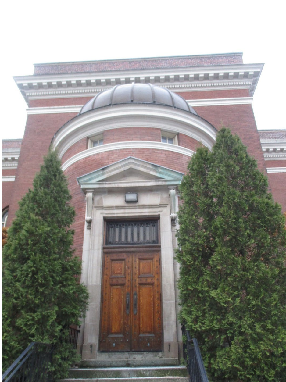
Figure 18: Detail view of doorway on side (north) elevation entrance.