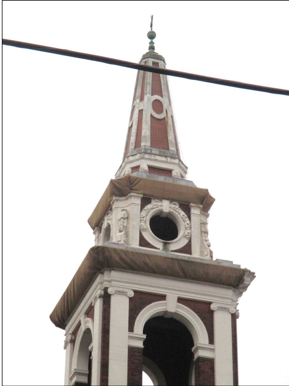
Figure 9: Detail view of spire top.