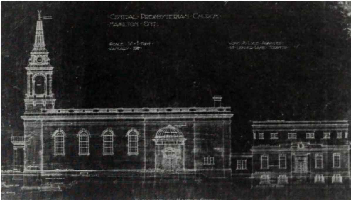
Figure 23: Elevation of subject property by John Lyle, 1907 (John M. Lyle: Towards a Canadian Architecture, 1982).