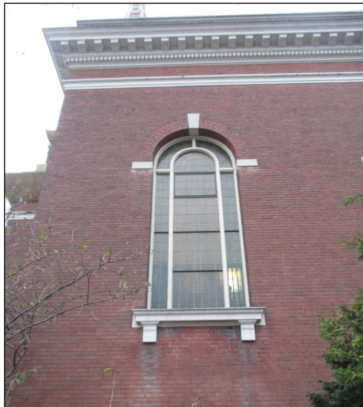
Figure 15: Detail view of window surround.