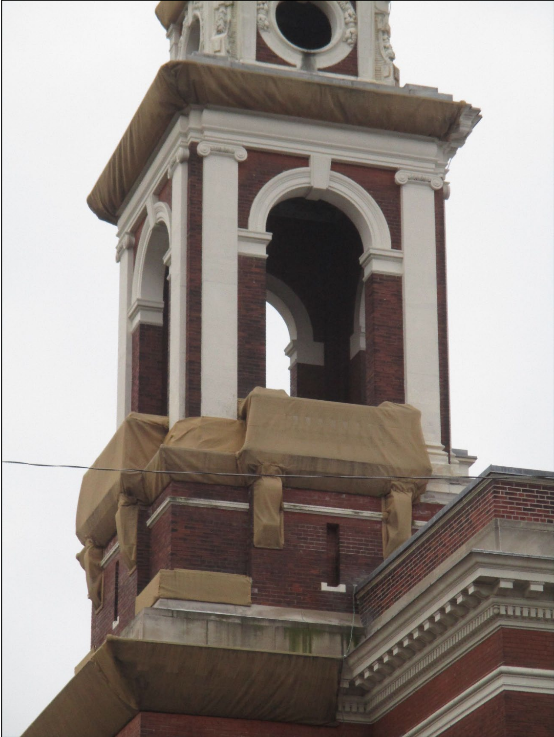
Figure 8: Detail view of spire base.