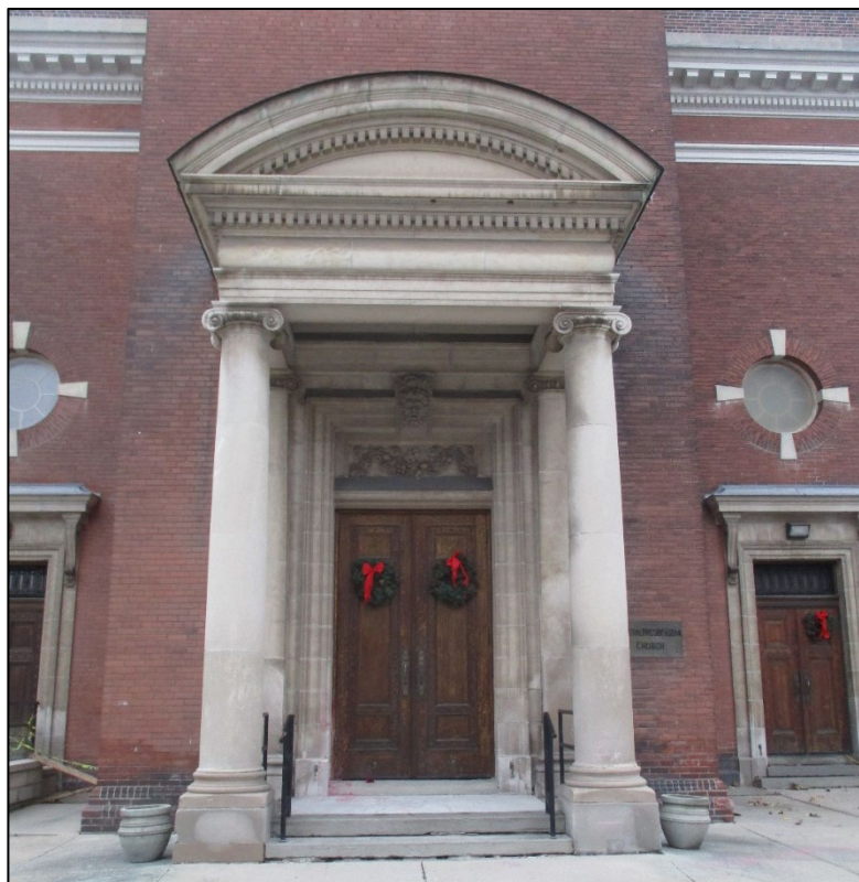
Figure 11: Detail view of front (east) elevation.