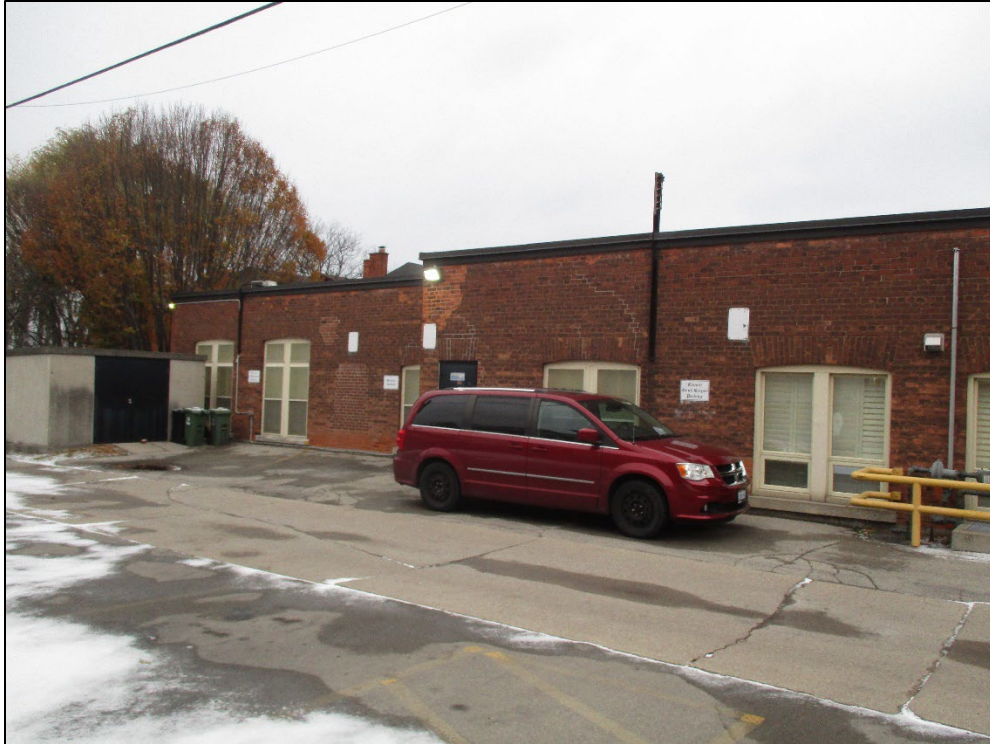
Figure 6: View of Sunday School rear (south) elevation.