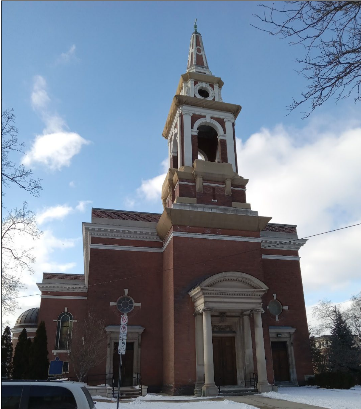
Figure 1: Central Presbyterian Church from the intersection of Charlton Avenue and Caroline Street. City of Hamilton staff, February 7, 2025.

All photographs taken by City of Hamilton staff on December 4, 2024, unless otherwise noted.