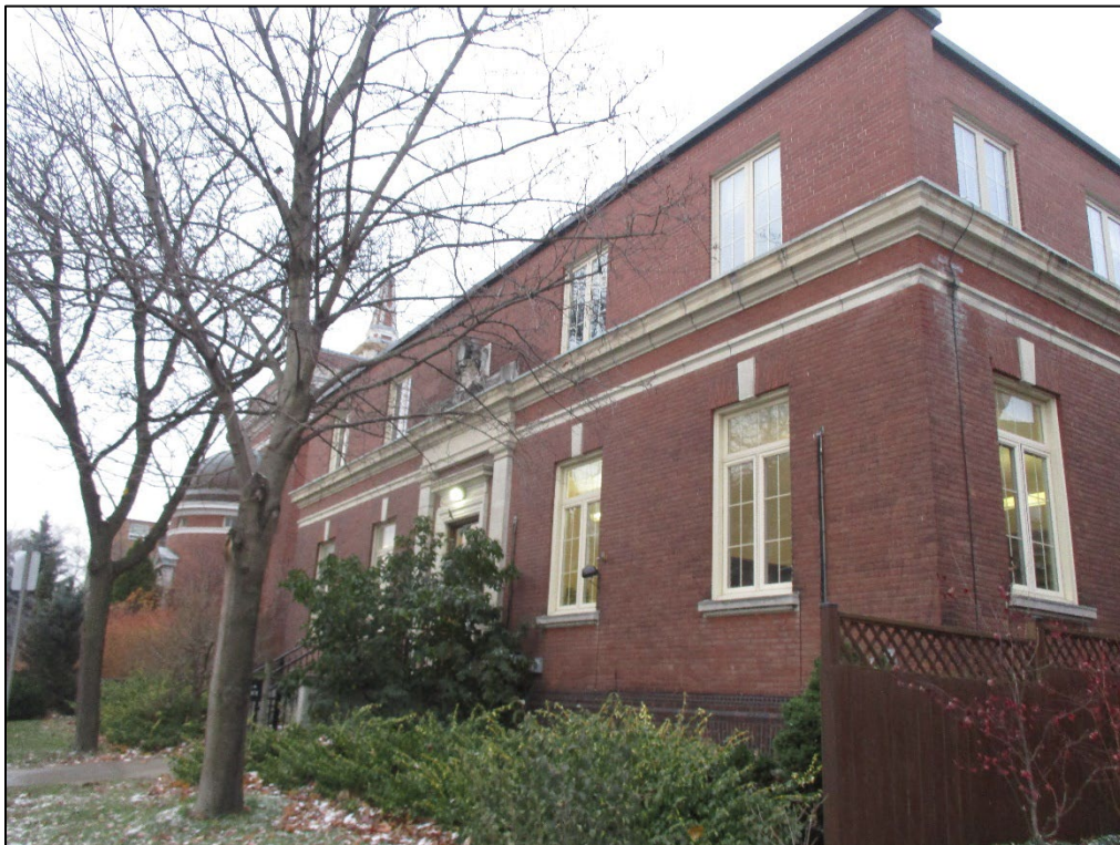
Figure 5: View of Sunday School front (north) elevation.