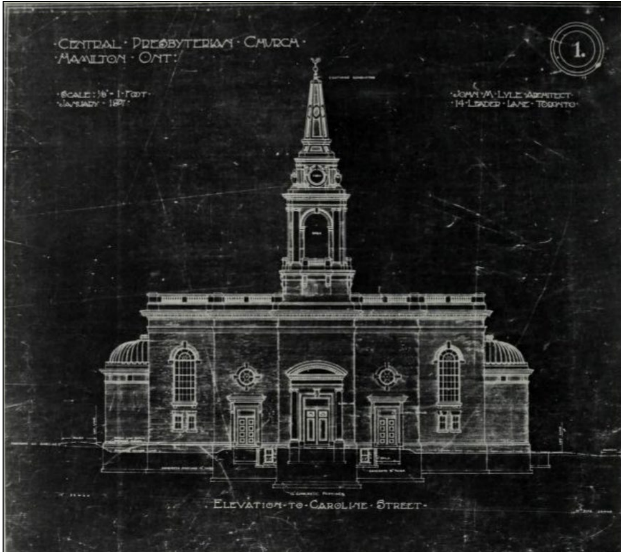
Figure 22: Elevation of subject property by John Lyle, 1907 (John M. Lyle: Towards a Canadian Architecture, 1982).