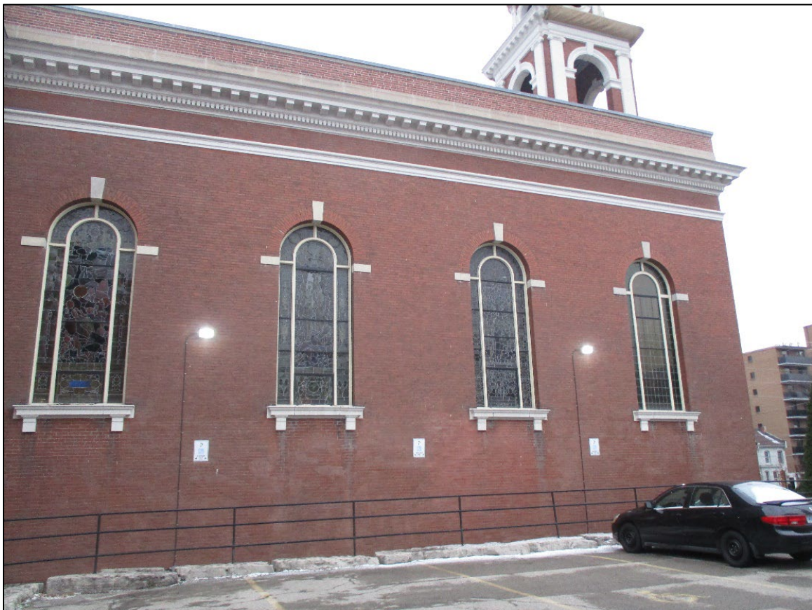
Figure 3: View of south elevation.