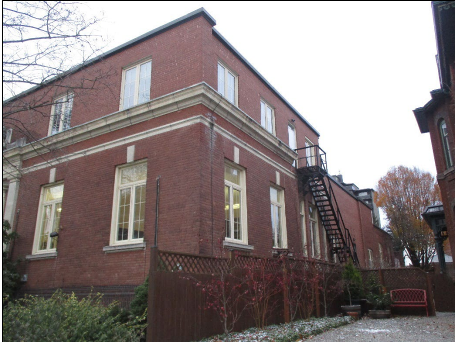
Figure 19: Detail view of northwest corner of Sunday School.