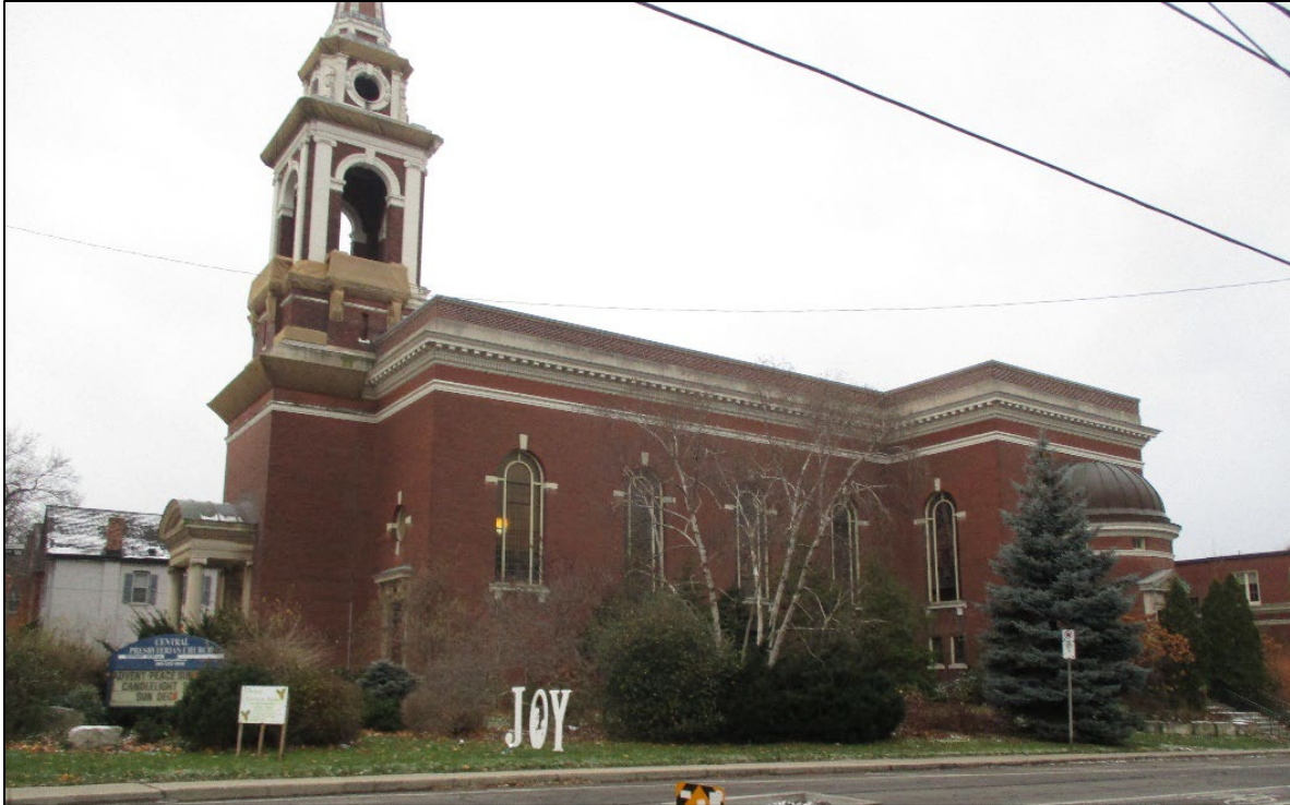
Figure 2: View of north elevation.