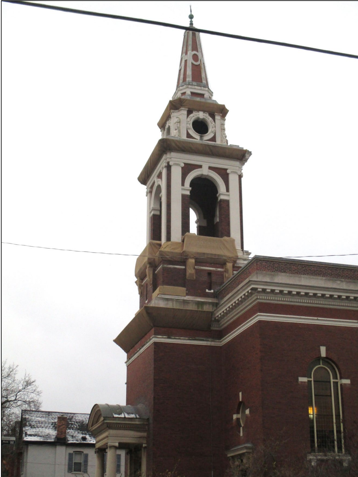
Figure 7: Detail view of spire.