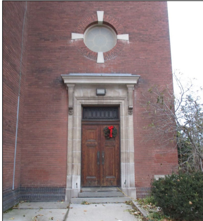
Figure 14: Detail view of secondary entrance on front (east) elevation.