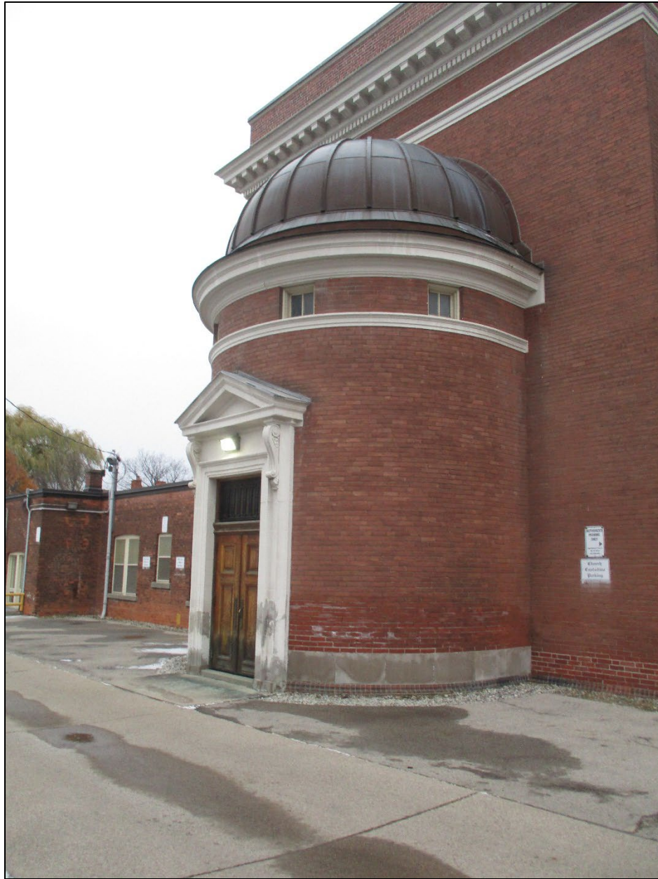
Figure 16: View of side (south) elevation entrance.