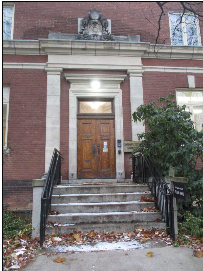
Figure 20: Detail view of Sunday School entrance on front (north) elevation.