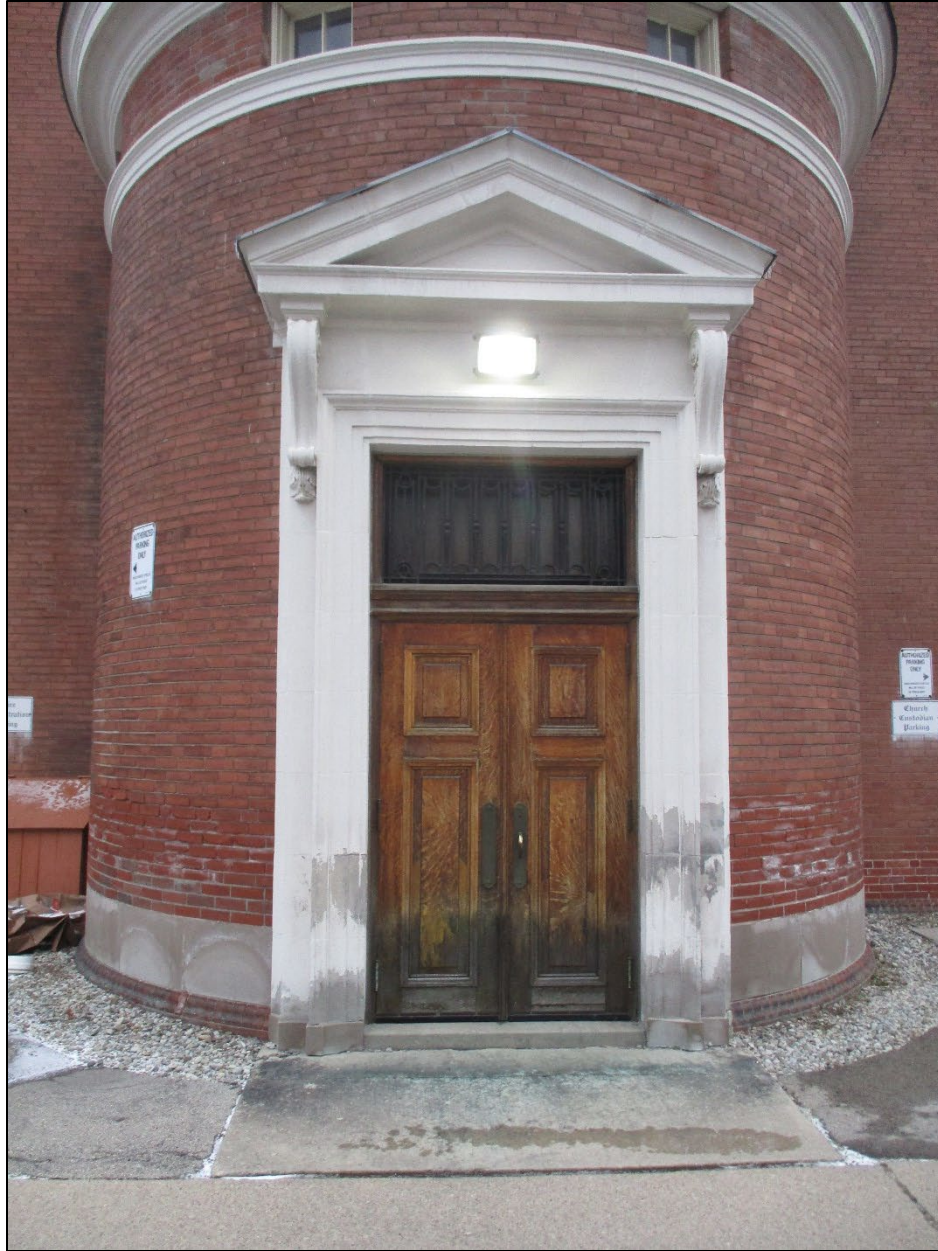
Figure 17: Detail view of doorway on side (south) elevation.