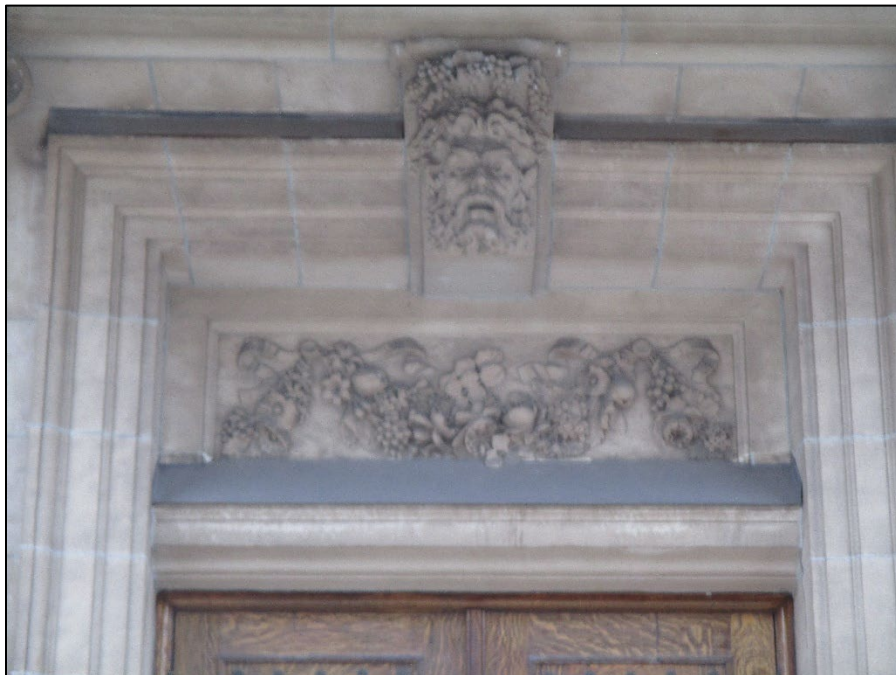
Figure 13: Detail view of carved decorative elements.