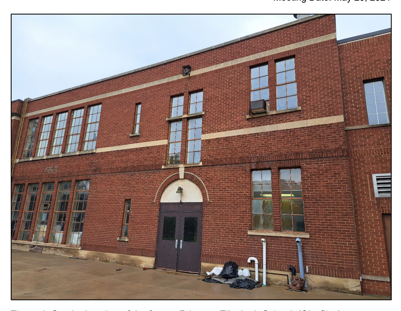
Figure 4: South elevation of the former Princess Elizabeth School.