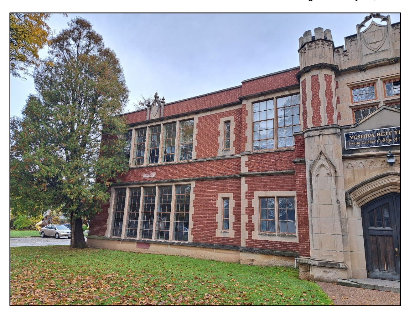
Figure 2: North side of the west elevation of the former Princess Elizabeth School.