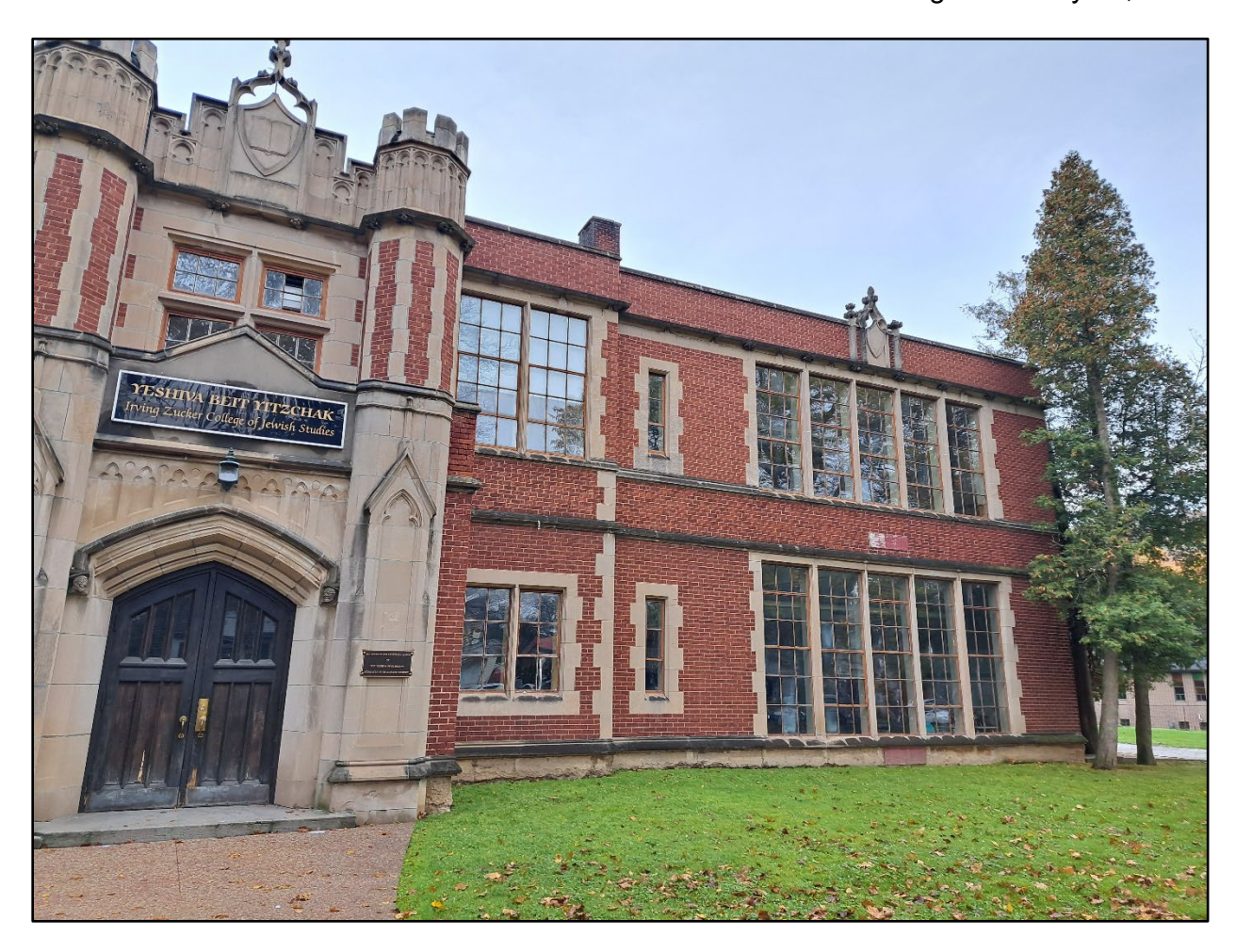
Figure 3: South side of West elevation of the former Princess Elizabeth School, (City Files).