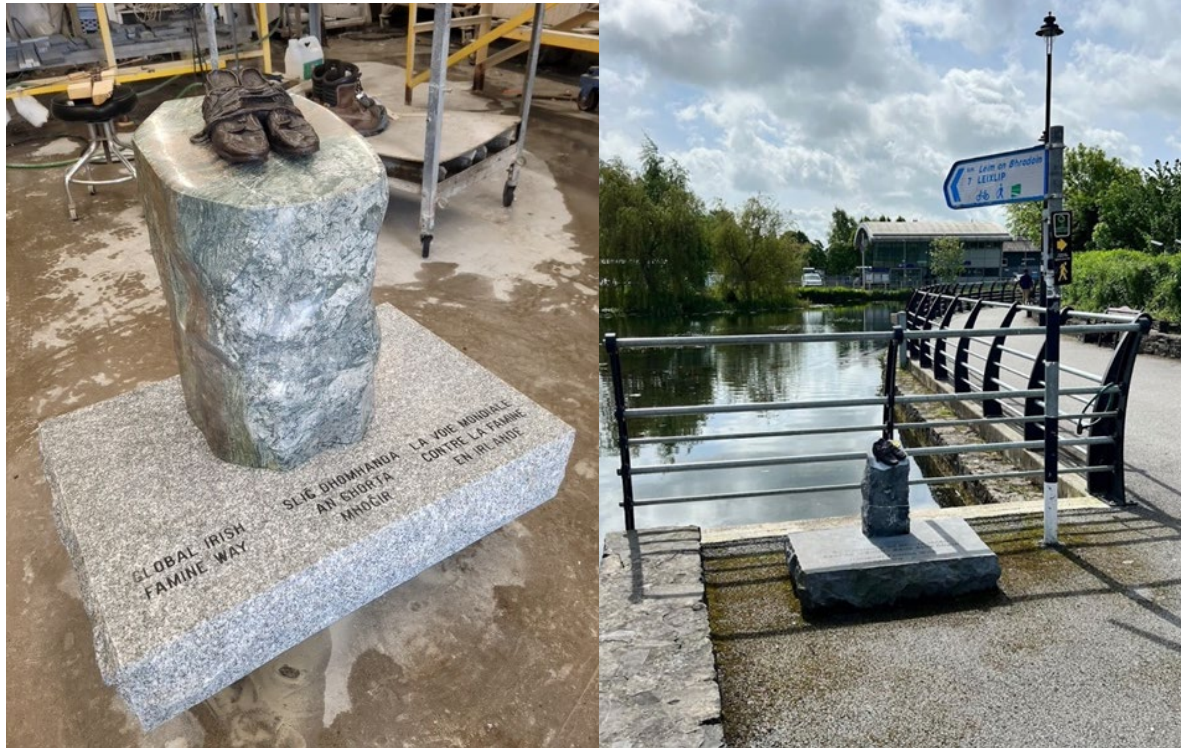
Figure 1-2: Examples of other monuments along the National Famine Way in Ireland.