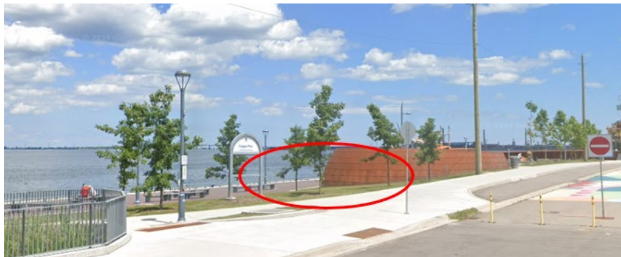
Figure 8: View of the proposed location from Harbourside Way, monument will be placed on the grass next to the Waterfront Trail, an accessible walkway. The monument will be next to an existing Corten steel art piece and playground.