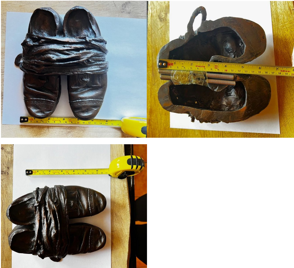
Figure 4-6: Images of the bronze shoes that will be cast and sent to Hamilton.

An interpretive plaque will be installed next to the monument with the name of the monument, donor recognition, and a brief historical background of the monument.