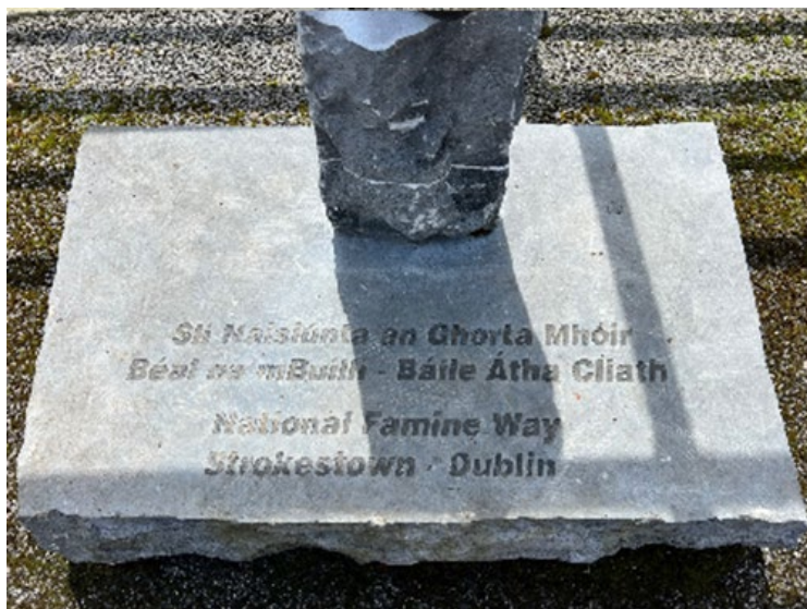
Figure 3: Example of text included on plinth.