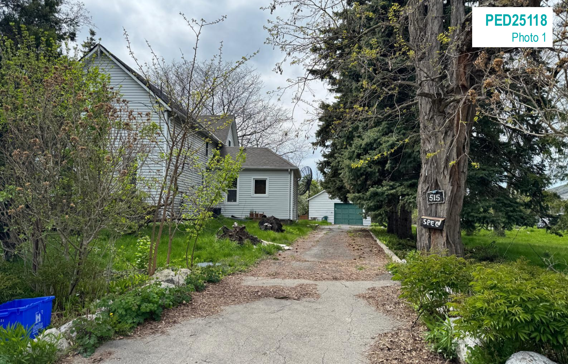
Frontal view of the existing heritage house on the property