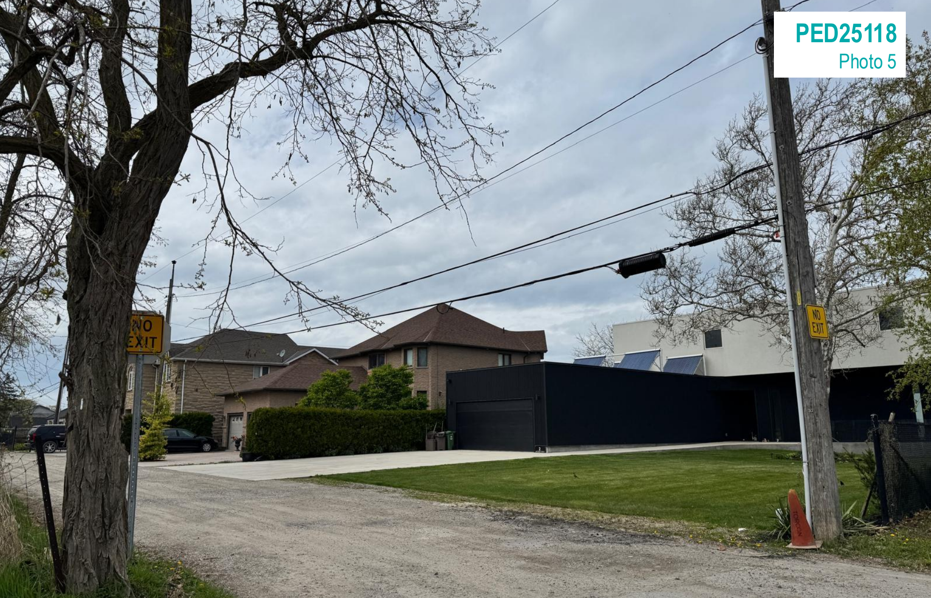
Single Detached dwellings on the north