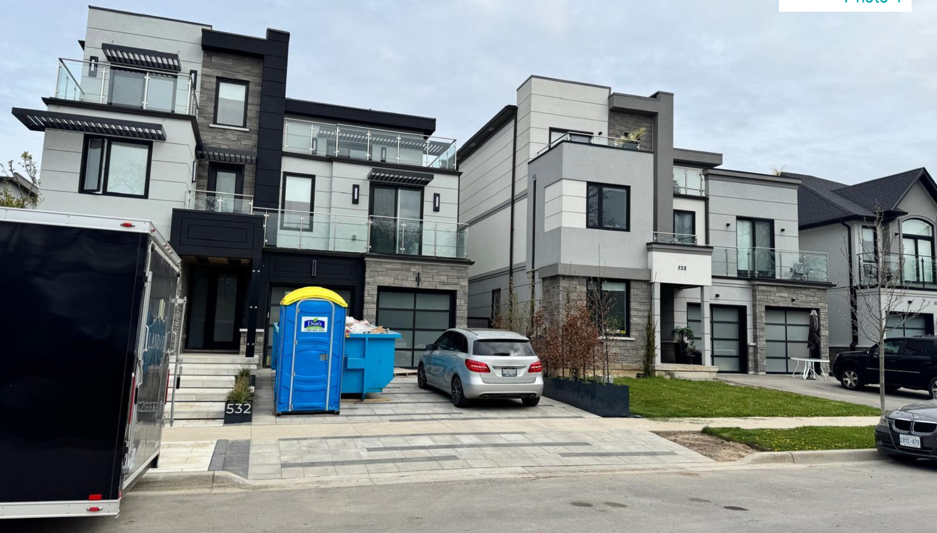
Single Detached dwellings on the east