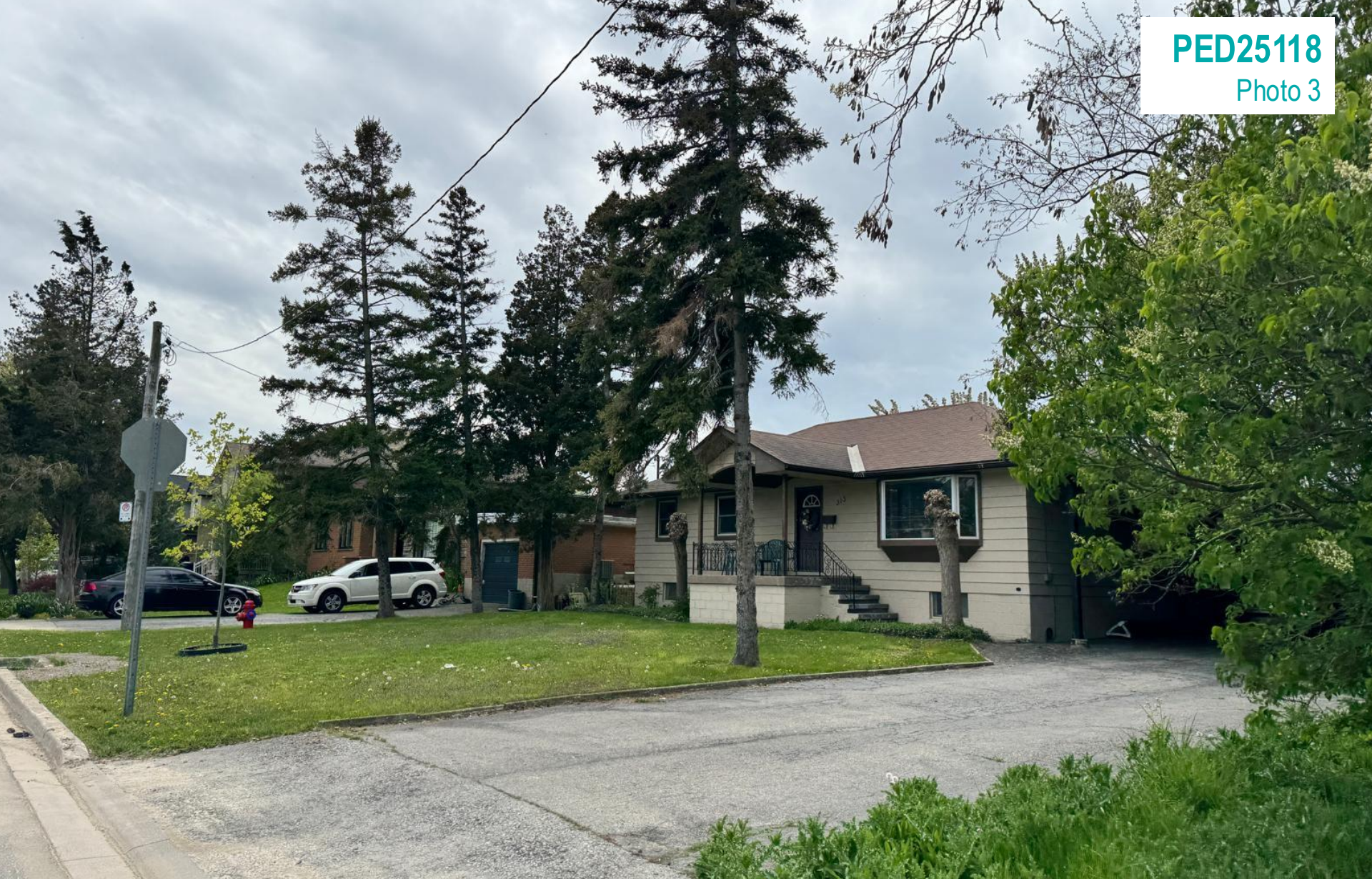
Single Detached dwelling on the south