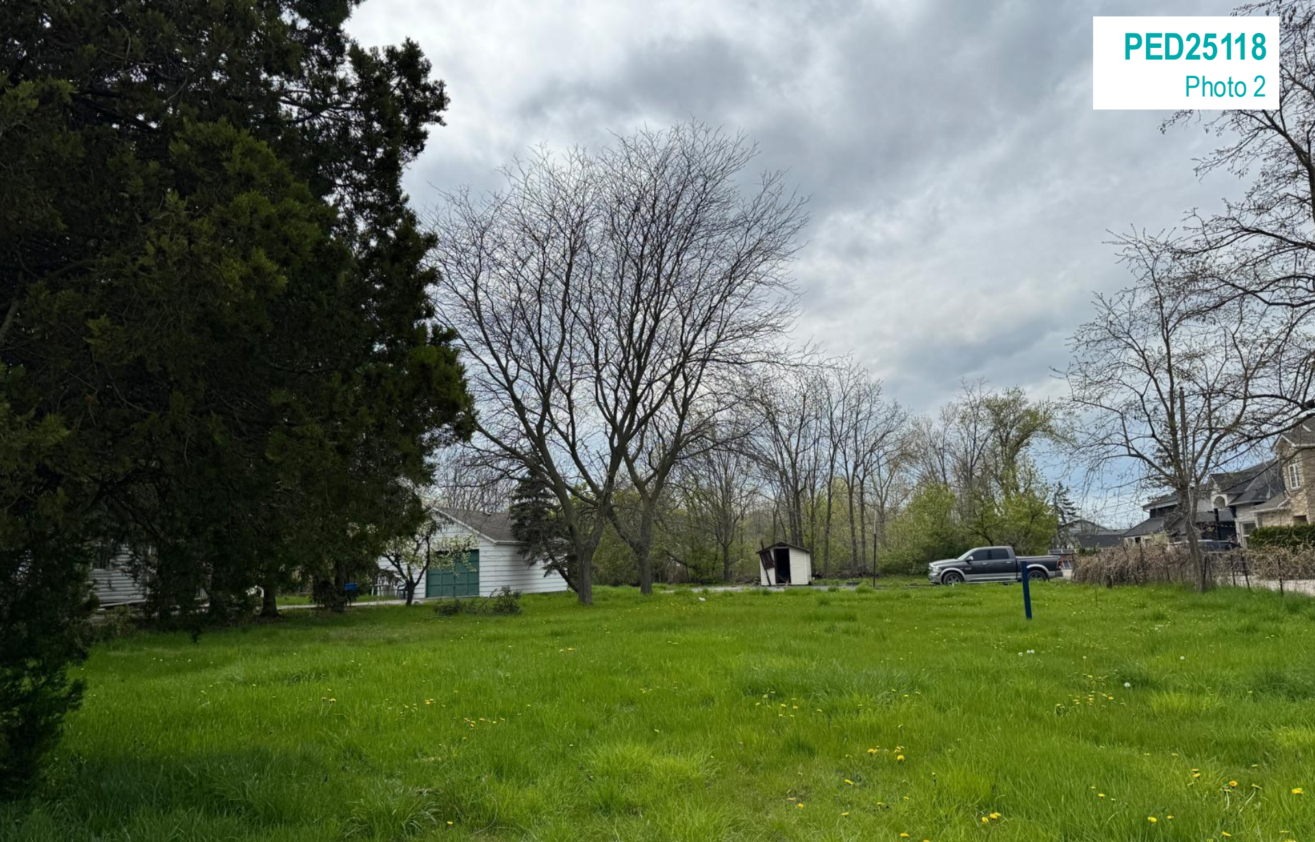
View of the subject property