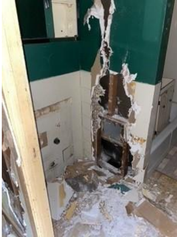
1294 Upper James – Photo No. 5: Washroom