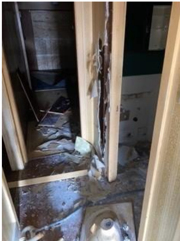
1294 Upper James – Photo No. 6: Hallway