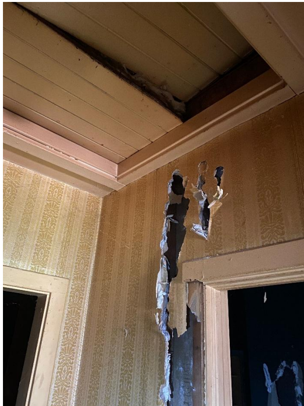
1294 Upper James – Photo No. 1: Hallway