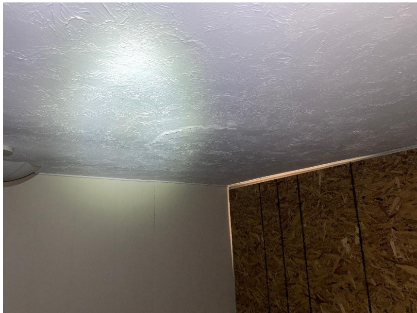
1290 Upper James – Photo No. 4: Living Room Ceiling Water Damage