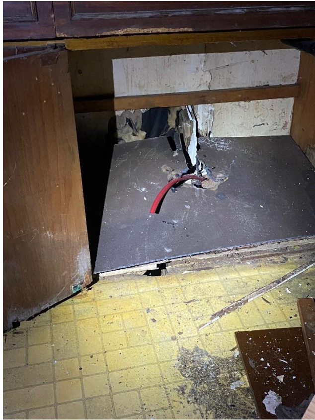
1294 Upper James – Photo No. 1: Kitchen