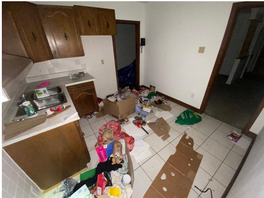
1290 Upper James – Photo No. 2: Kitchen