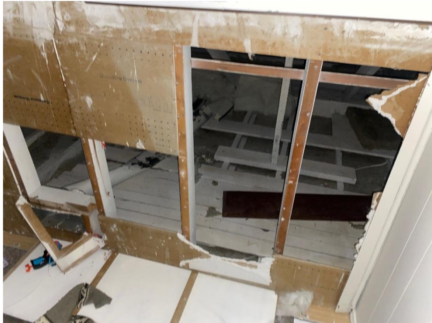
1290 Upper James – Photo No. 3: Bedroom