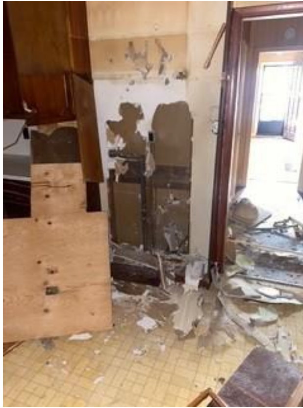
1294 Upper James – Photo No. 3: Kitchen