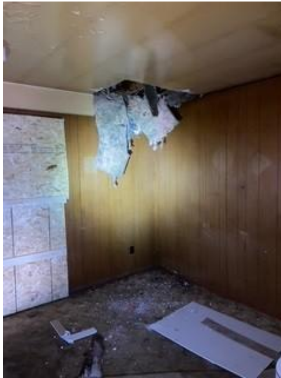
1294 Upper James – Photo No. 4: Living Room