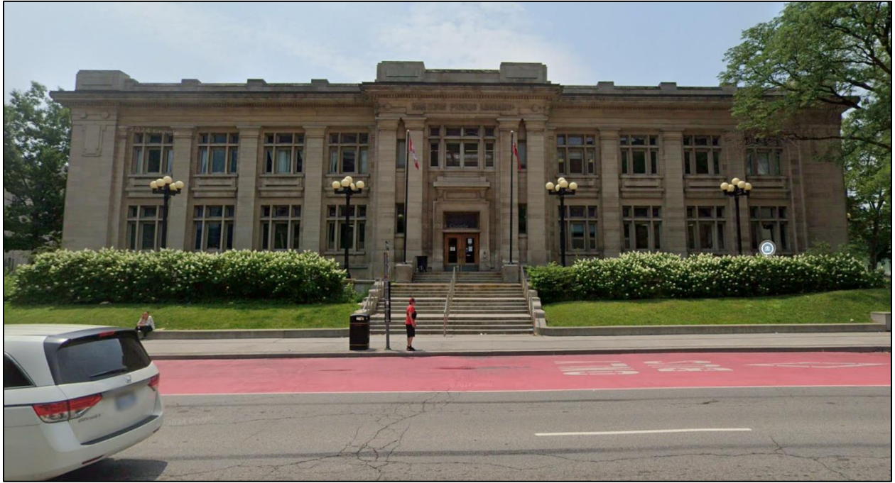
Figure 1: Front view of the Hamilton Carnegie Building at 55 Main Street West from Google Street View (June 2024).