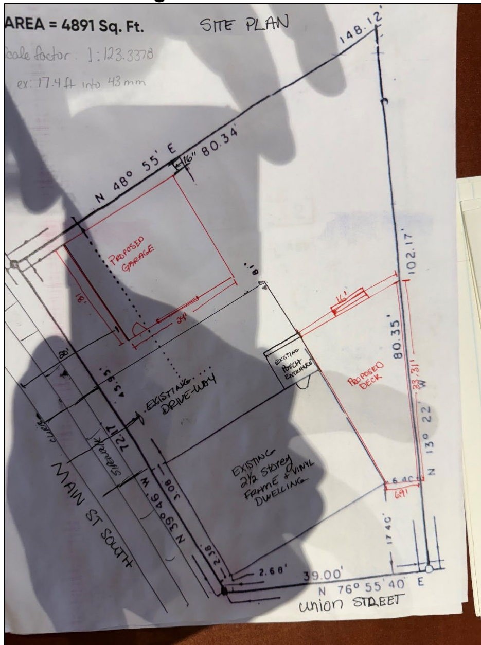
Figure 4: Site Plan Submitted by owner. Please note the proposed deck is no longer part of the scope of work.