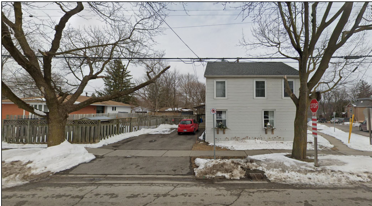
Figure 2: View of 3 Union Street from Main Street South.