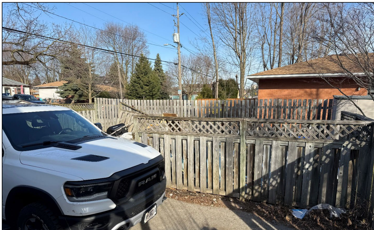
Figure 3: View to garage location.