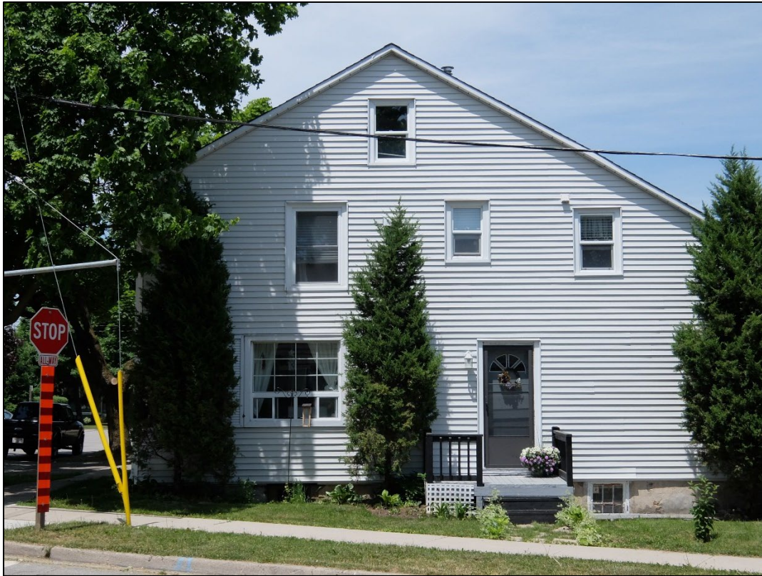
Figure 1: View of 3 Union Street from Union (City Files).