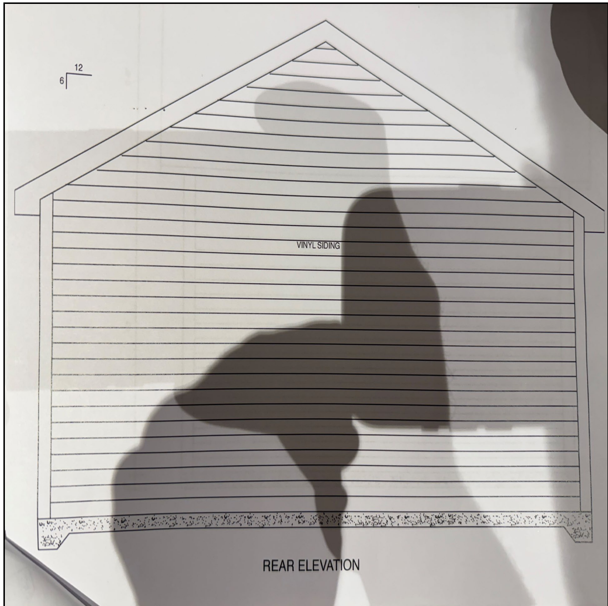
Figure 6: Rear elevation of the proposed garage (c/o Owner).