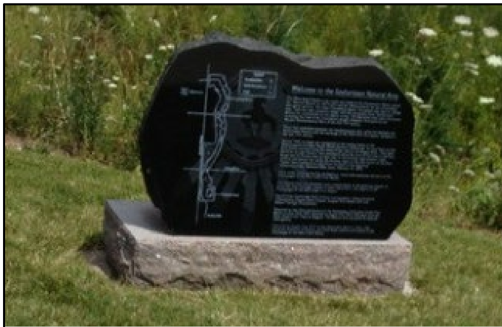
Figure 4: Example of a similar installation example in Flamborough, showing the style of the proposed granite treaty marker (Proponent Submission, 2026). The final design for this project is pending but is likely to include smooth sides and angled face for easier reading, as well as moccasin imagery in accordance with the Moccasin Identifier Project.