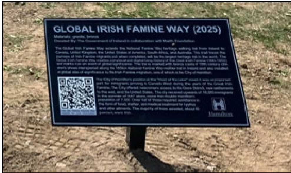
Figure 4: Example of the aluminum sign to be placed adjacent to the Treaty Marker (Proponent Submission, 2026)