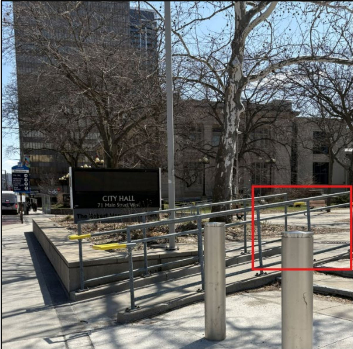
Figure 3: Close up of the proposed project area outlined in red, looking east along Main Street West from the City Hall forecourt (Site Visit, 2026)