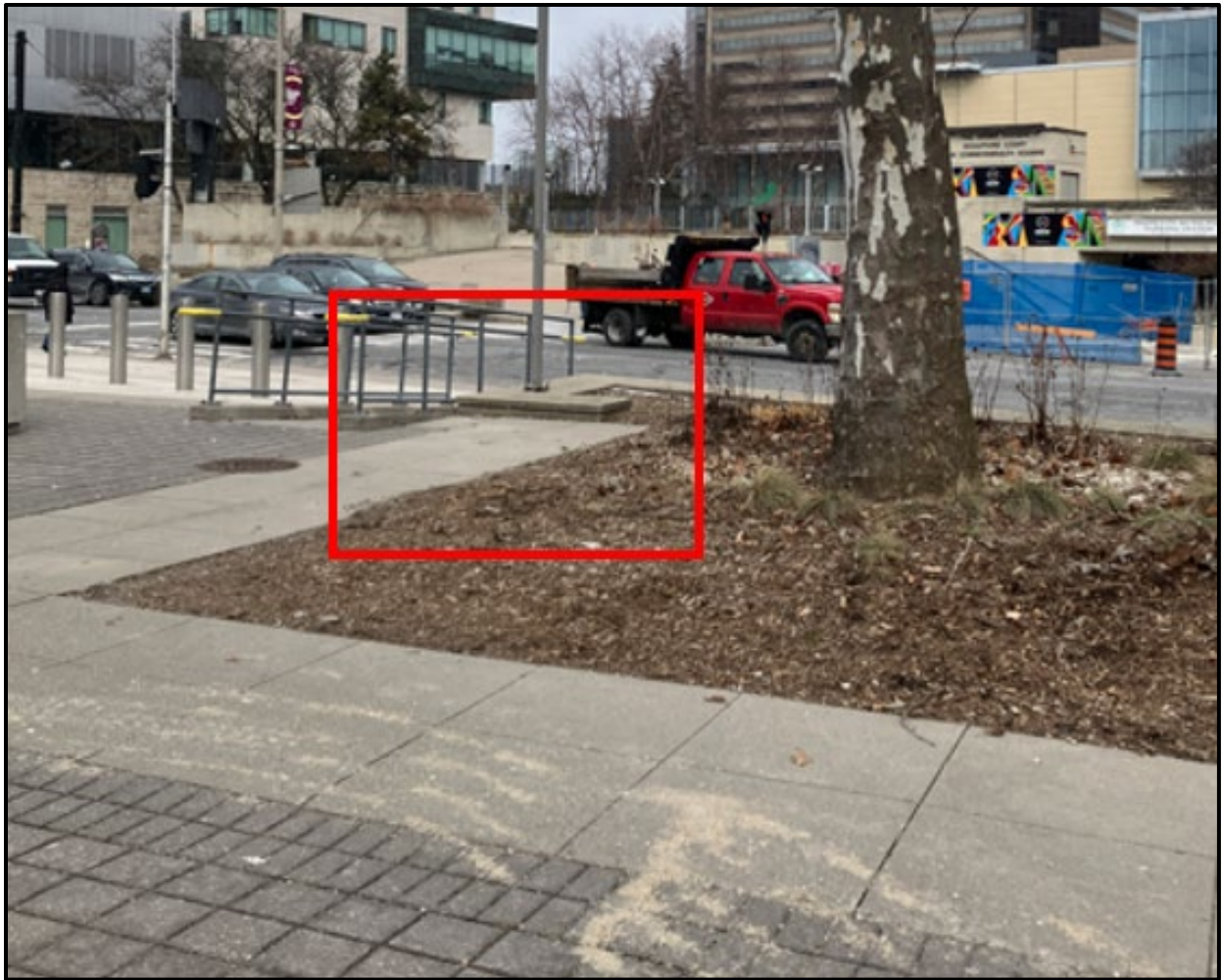
Figure 2: Close up of the proposed project area outlined in red, looking north towards Main Street West from the City Hall forecourt (Proponent Submission, 2026)