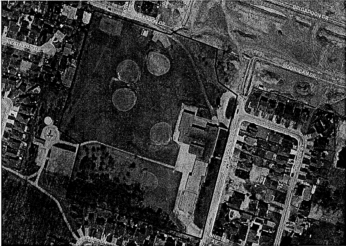
15 Acre Site 3 Baseball Diamonds used by City Parks & Recreation