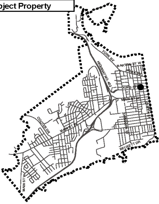
Ward 1 Key Map