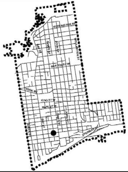
Ward 2 Key Map