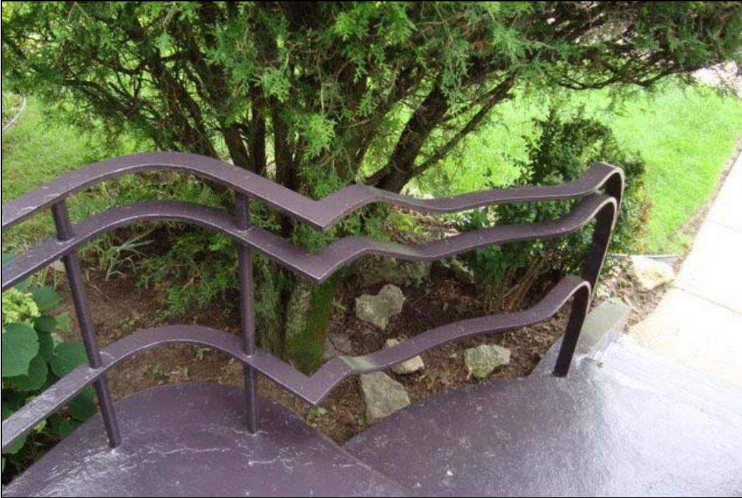
170 Longwood Road North - Curved railings