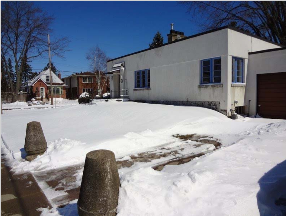
170 Longwood Road North - View from the southwest