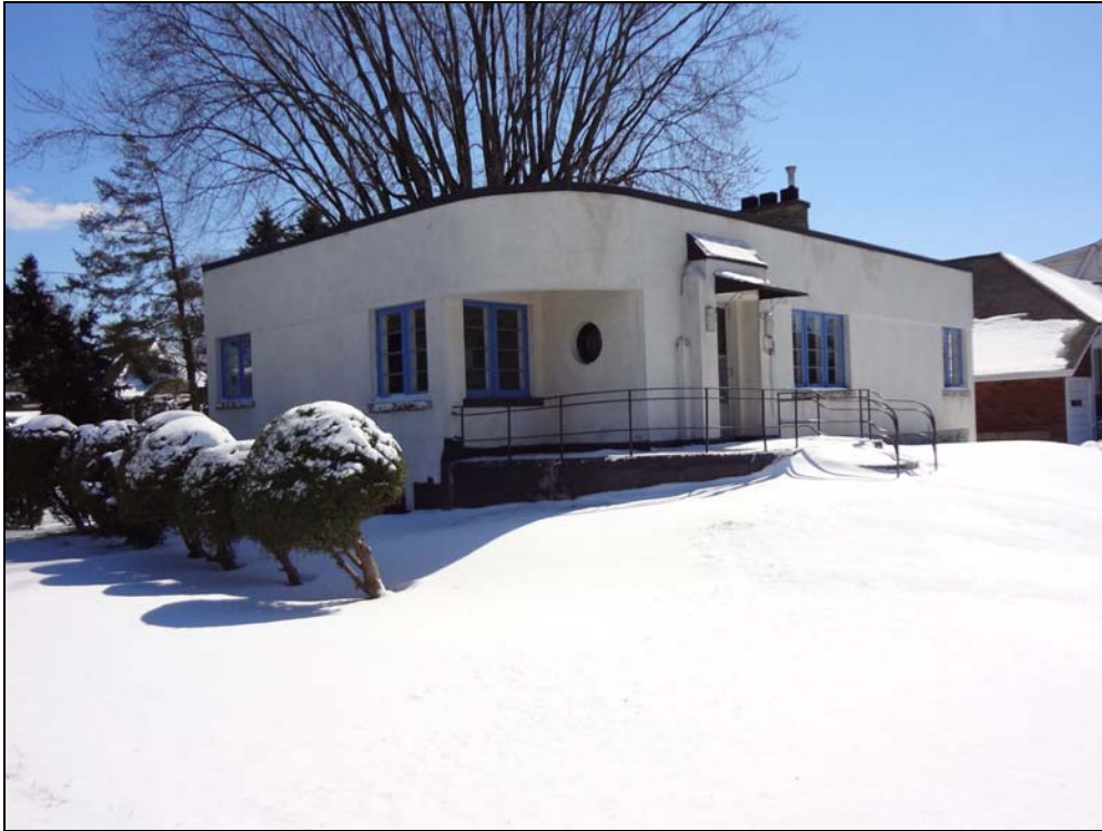
170 Longwood Road North - View from the northwest