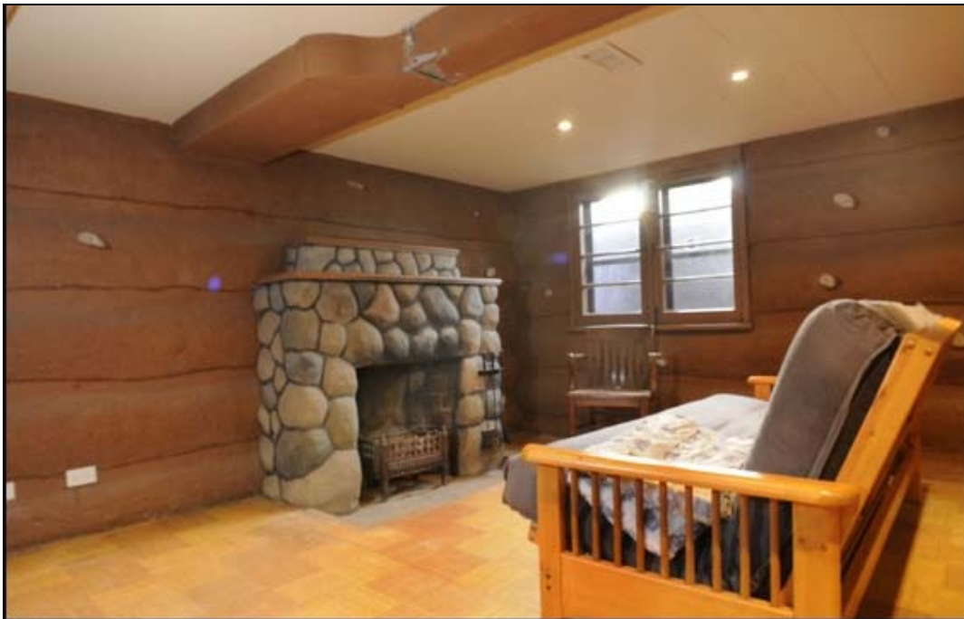
170 Longwood Road North - Interior recreation-room