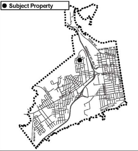
Ward 1 Key Map N.T.S.