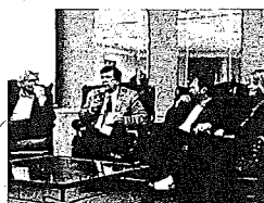
Plenary speakers, 2010 Annual Conference, Cornwall, ON