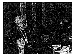
Board of Health Orientation Session, Feb. 2011