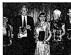
2010 Distinguished Service Award winners