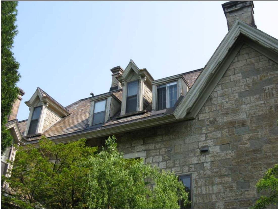
Dormers and eaves on the south side of the roof.