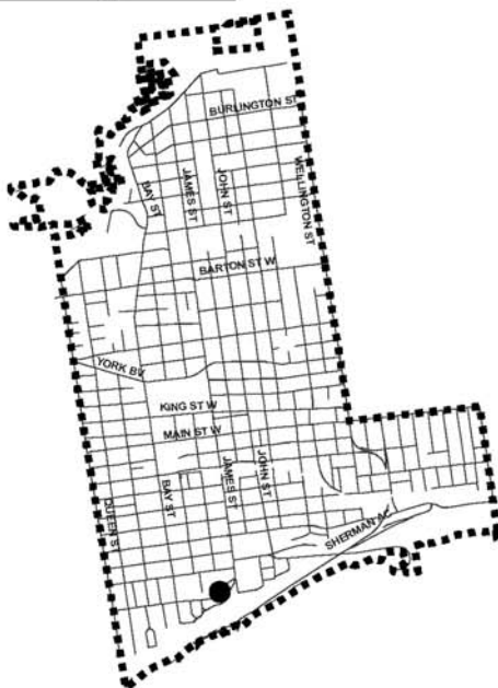
Ward 2 Key Map