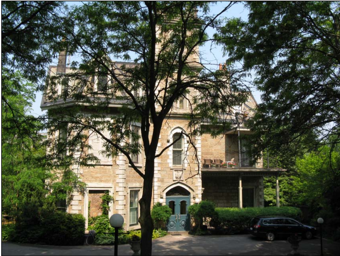
Front (East) Elevation