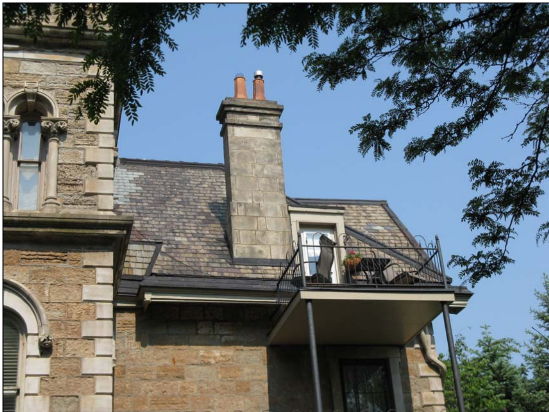
Detail of the slate roof, flashings, and balcony door at the northeast corner of the roof.