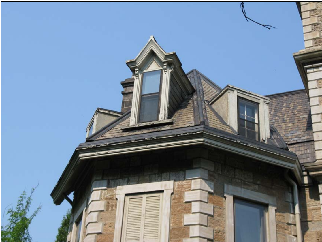
Dormers, shutters and eaves on the southeast corner of the building.