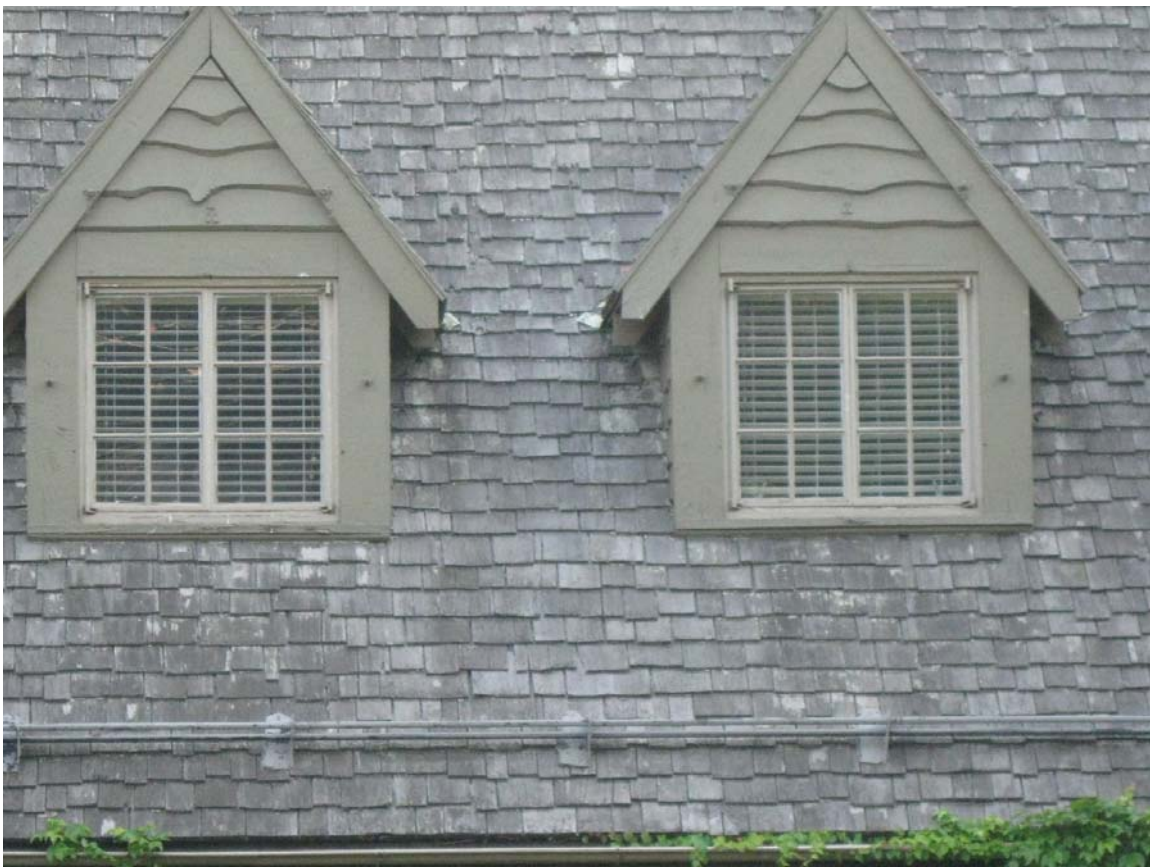
Front dormer windows – South façade