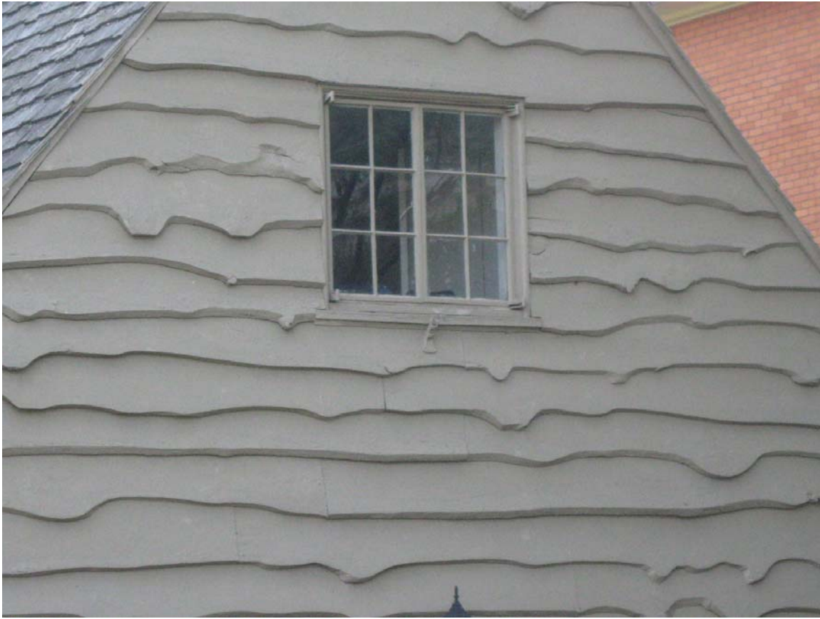
Window above garage – South façade