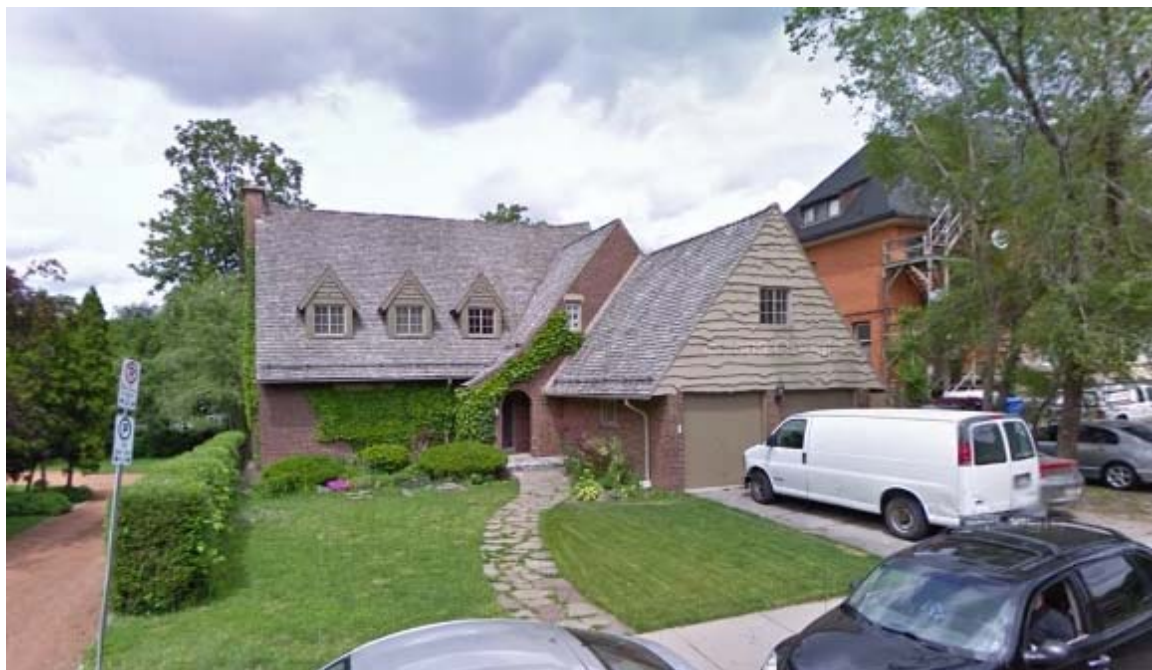
Front elevation – South