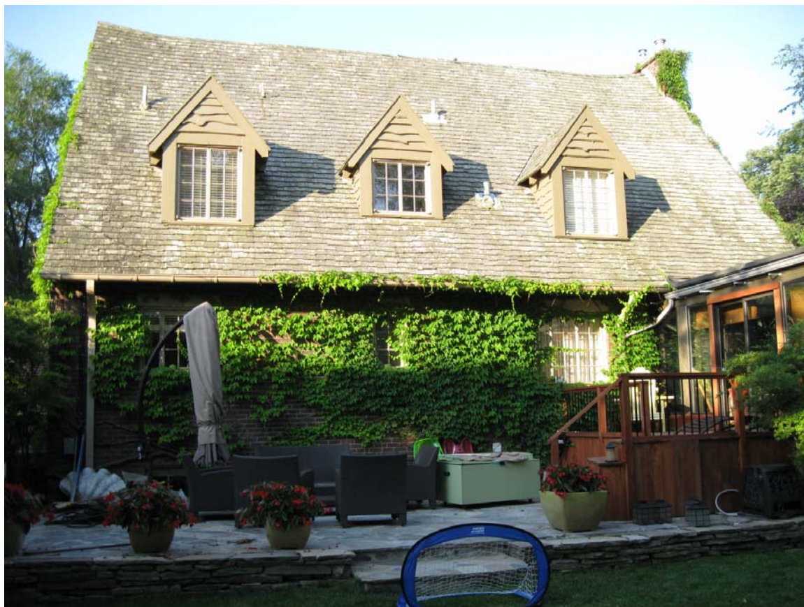
Rear elevation – North