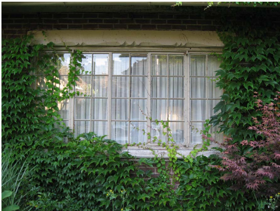
First floor window – South façade