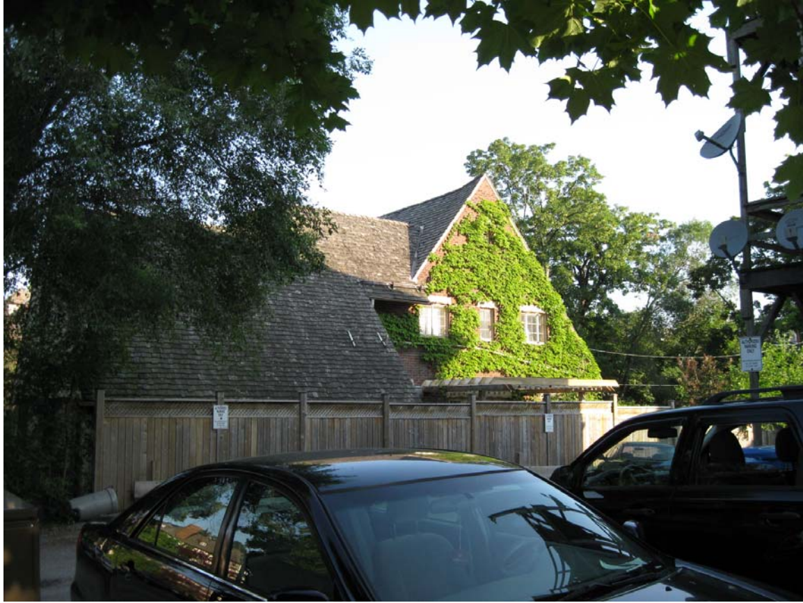
Easterly side yard windows