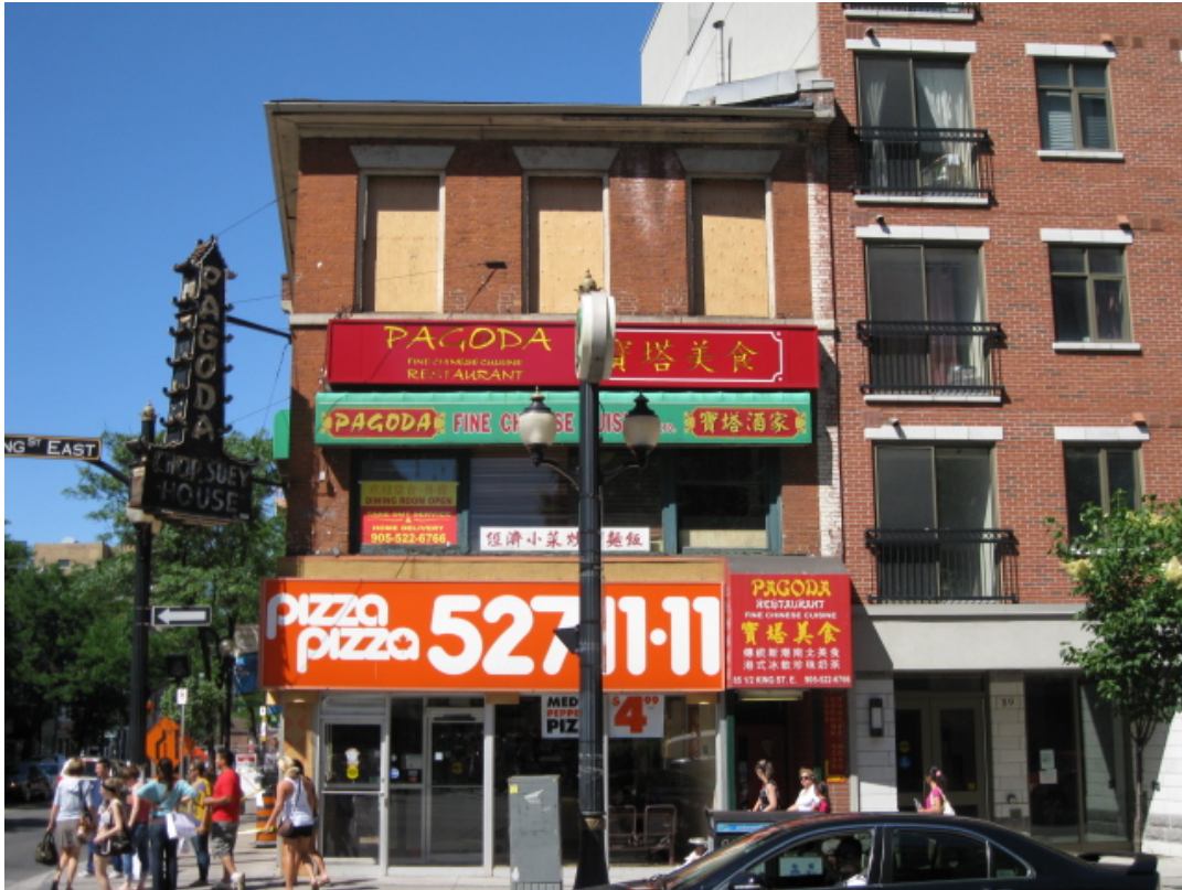
85 King Street East – South Elevation