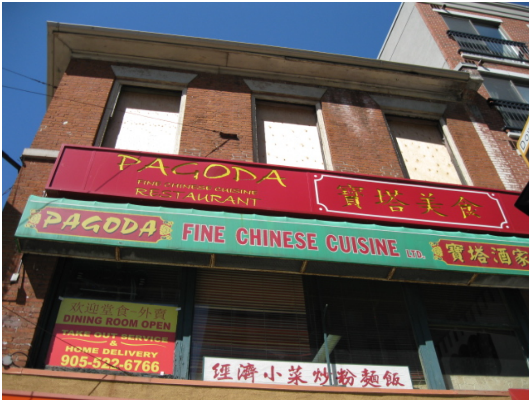
85 King Street East – View of eaves on South façade