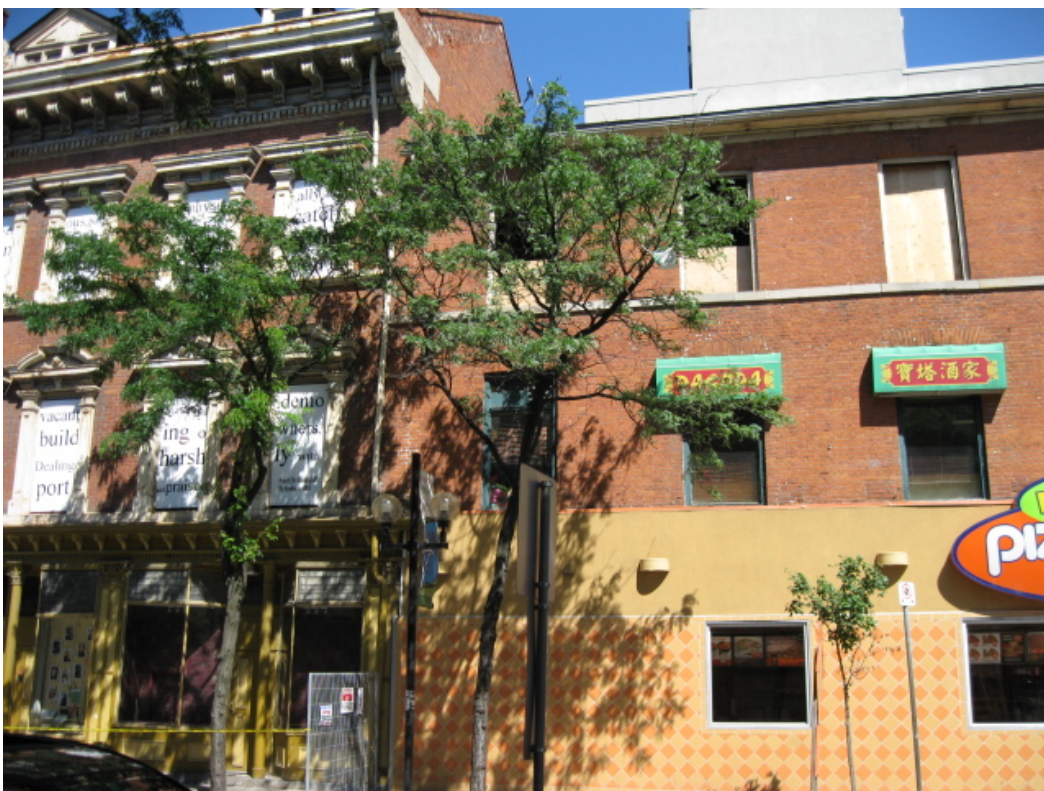
Shared wall between Treble Hall and Pagoda