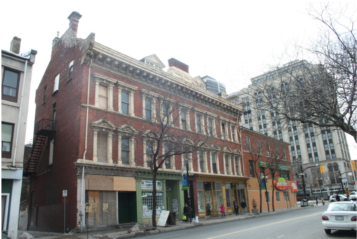
4-12 John Street North – West Elevation