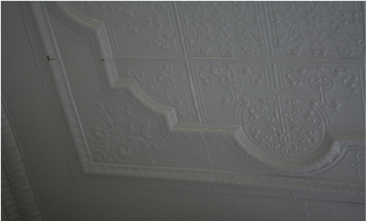
4-12 John Street North – Tin ceilings throughout first floor deluxe storefronts