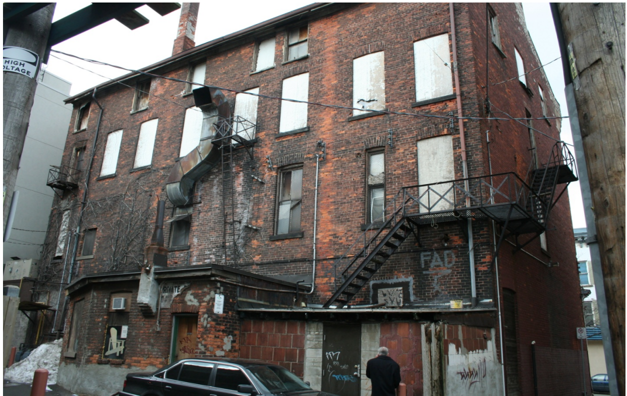
4-12 John Street North – East Elevation