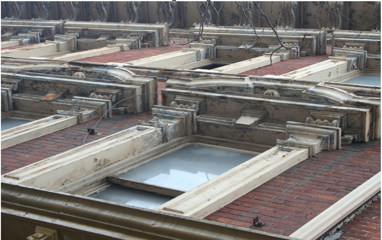
4-12 John Street North – unique Ornate sculptural windows (west façade)