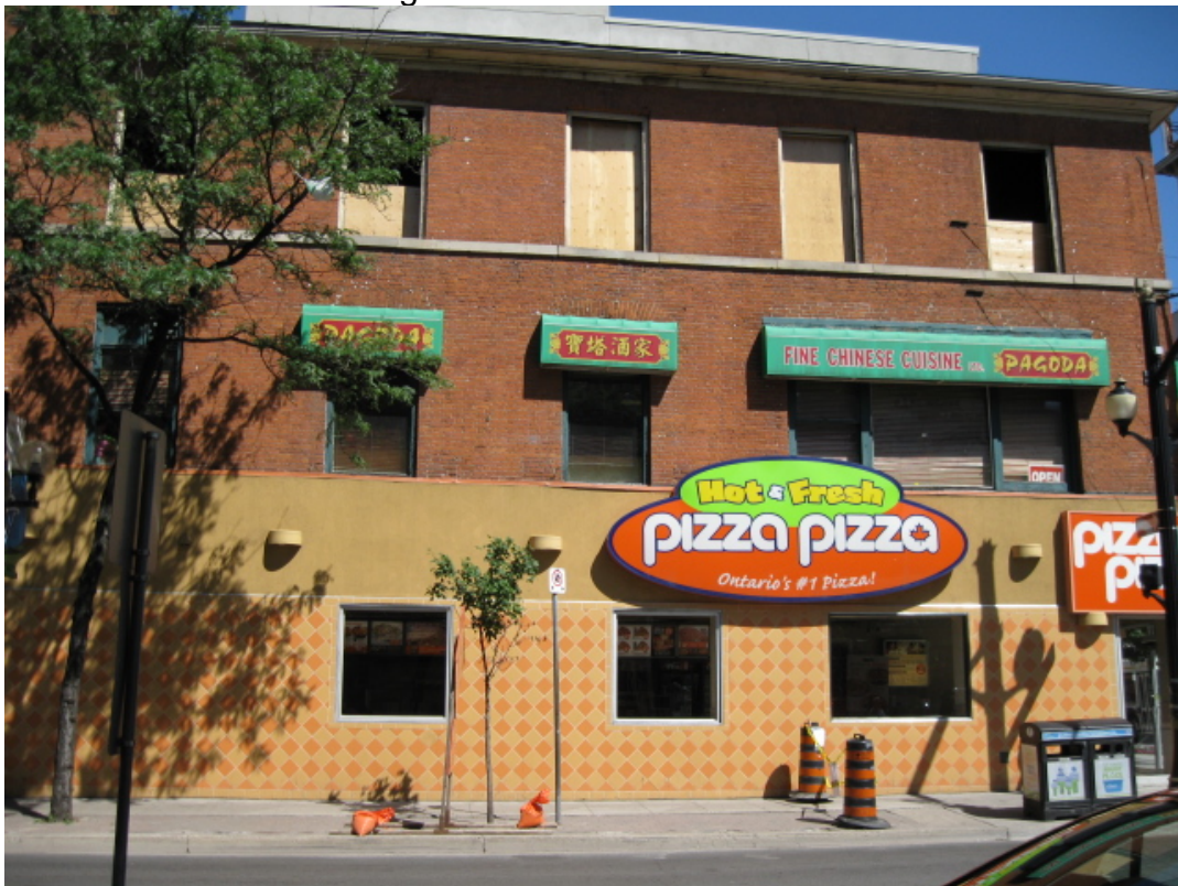
85 King Street East – West Elevation