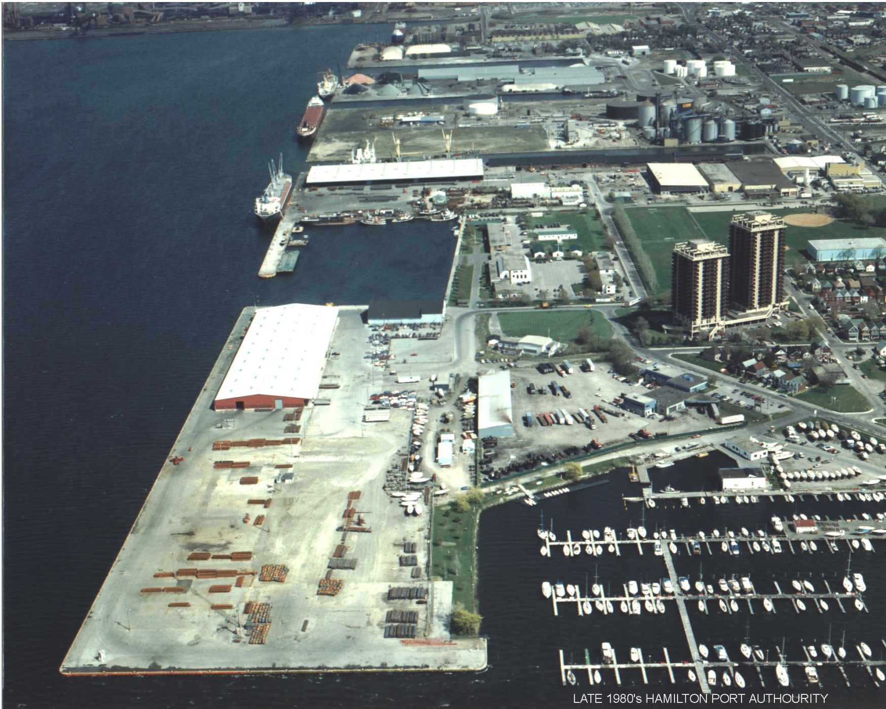
LATE 1980's HAMILTON PORT AUTHORITY