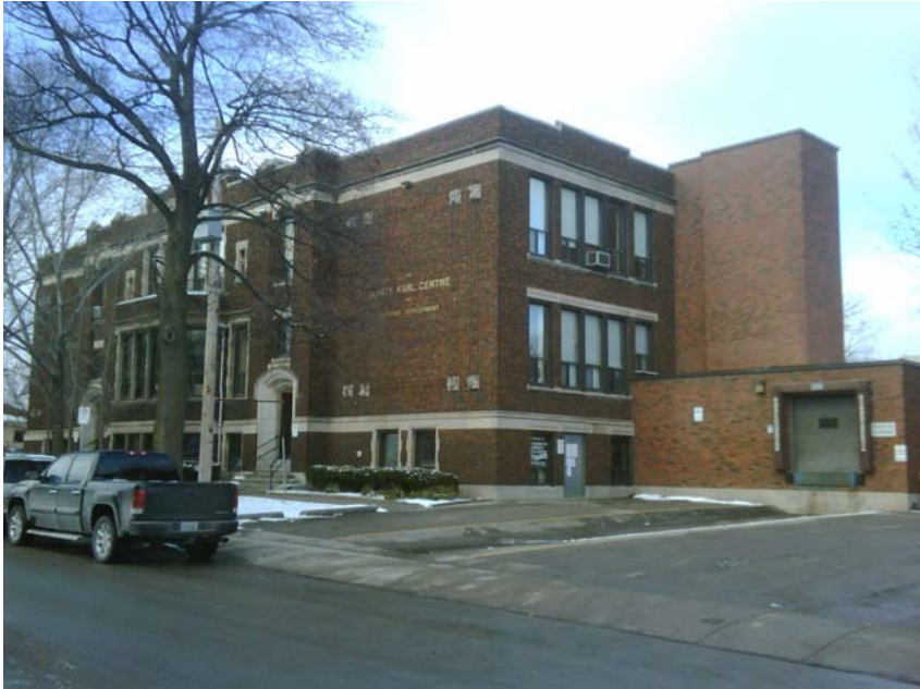
50 Murray Street - Pre-development

Development of the property at 50 Murray Street West will create thirty-six condominium units by way of the adaptive reuse of the existing heritage building together with a three-storey addition to the top of the existing three-storey building. An accessory one-storey parking garage, together with additional surface parking would provide thirty-nine parking spaces for residents and visitors of the development.