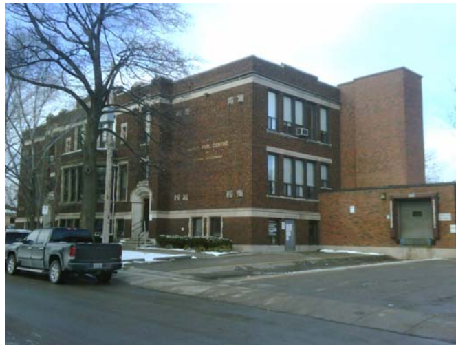
50 Murray Street West - Pre-development

In addition, on an annual basis, prior to the issuance of a grant payment, the property owner will be required to sign an affidavit attesting to compliance with the terms and conditions outlined within the Agreement.