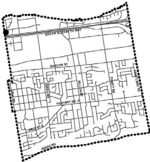
Ward 10 Key Map