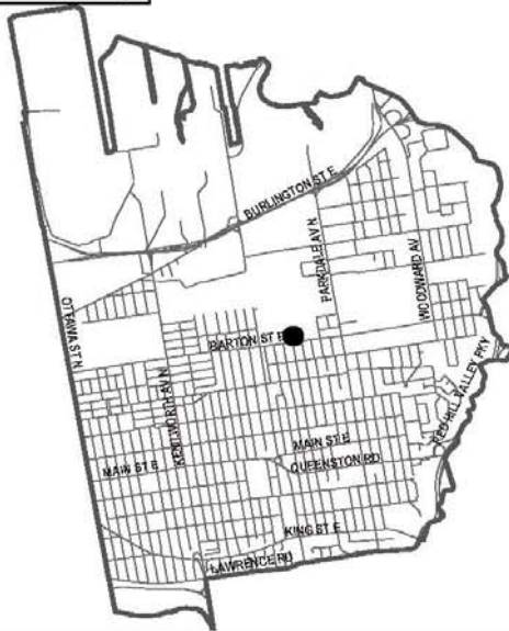
Ward 4 Key Map