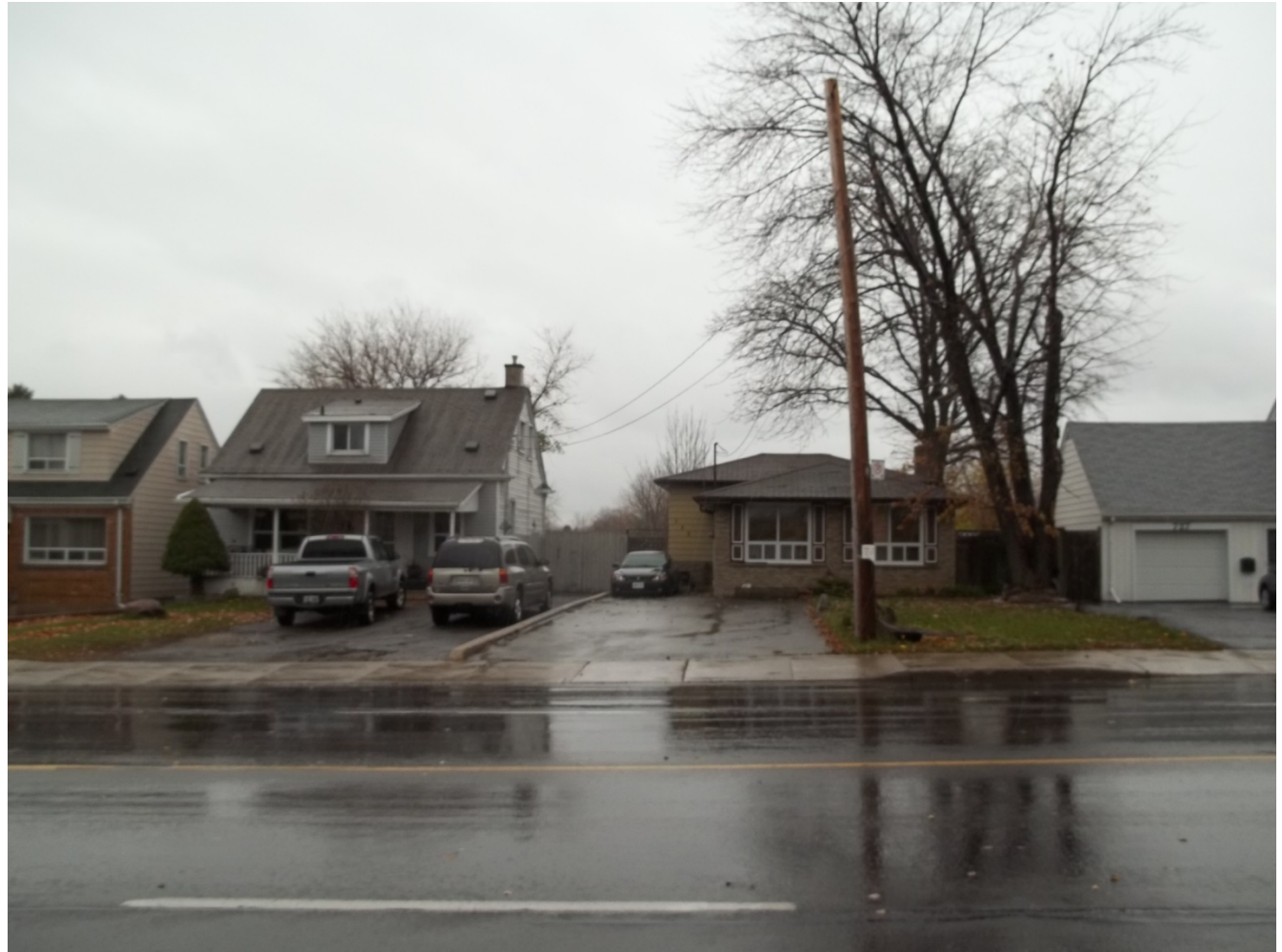
Photo 4 - East side of Upper Gage Avenue across from Subject Lands