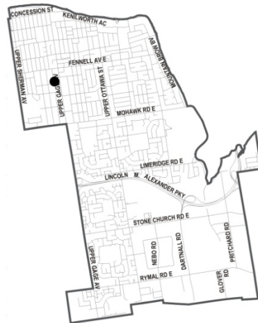
Ward 6 Key Map