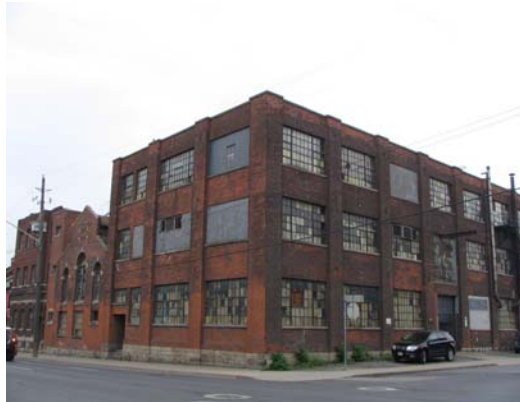
134 Cannon Street East – Pre-redevelopment

HDWHRLP, in the event the full 10 year grant is not sufficient to repay the loan in its entirety, supplemental payments will be a requirement of the applicant in order that each year through the 10 year repayment term, one-tenth of the loan amount is repaid. Therefore, based on a loan of $400,000, the annual repayment will be $40,000. The annual ERASE RGP grant is estimated at $158,535.86, therefore, supplemental payments will not be required from the applicant.