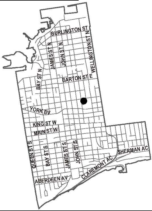
Ward 2 Key Map