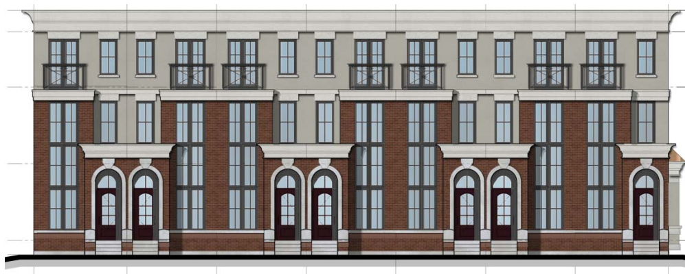
Elevation of 149 Young Street

Staff also undertook due diligence with respect to undertaking a search to determine if the applicant or shareholder of the corporation is in litigation with the City of Hamilton; if property taxes were paid current and, whether there were any Building Code, Fire Code or Property Standard violations outstanding on the property. There were no issues with the aforementioned.