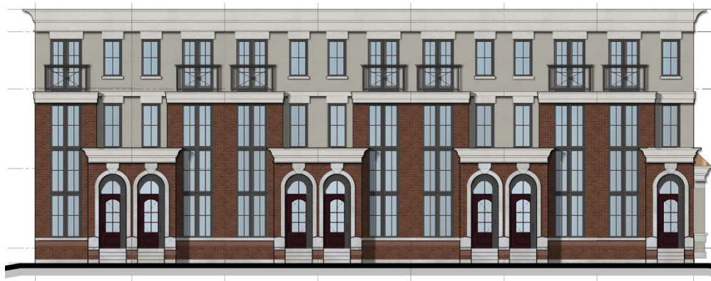
Elevation of 149 Young Street

In addition, on an annual basis, prior to the issuance of a grant payment, the property owner will be required to sign an affidavit attesting to compliance with the terms and conditions outlined within the Agreement.